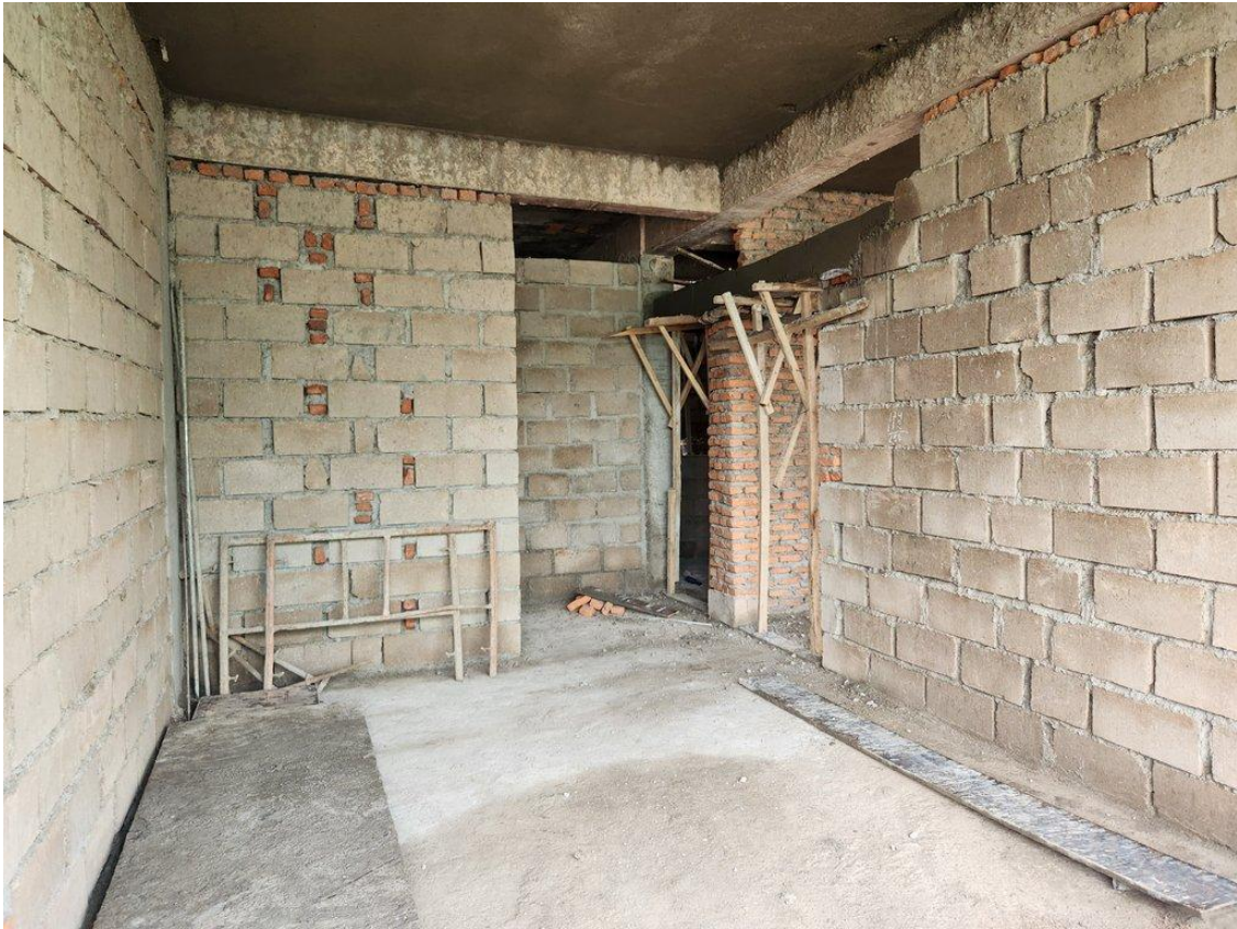
One of the apartments in phase 3, showing the bedroom