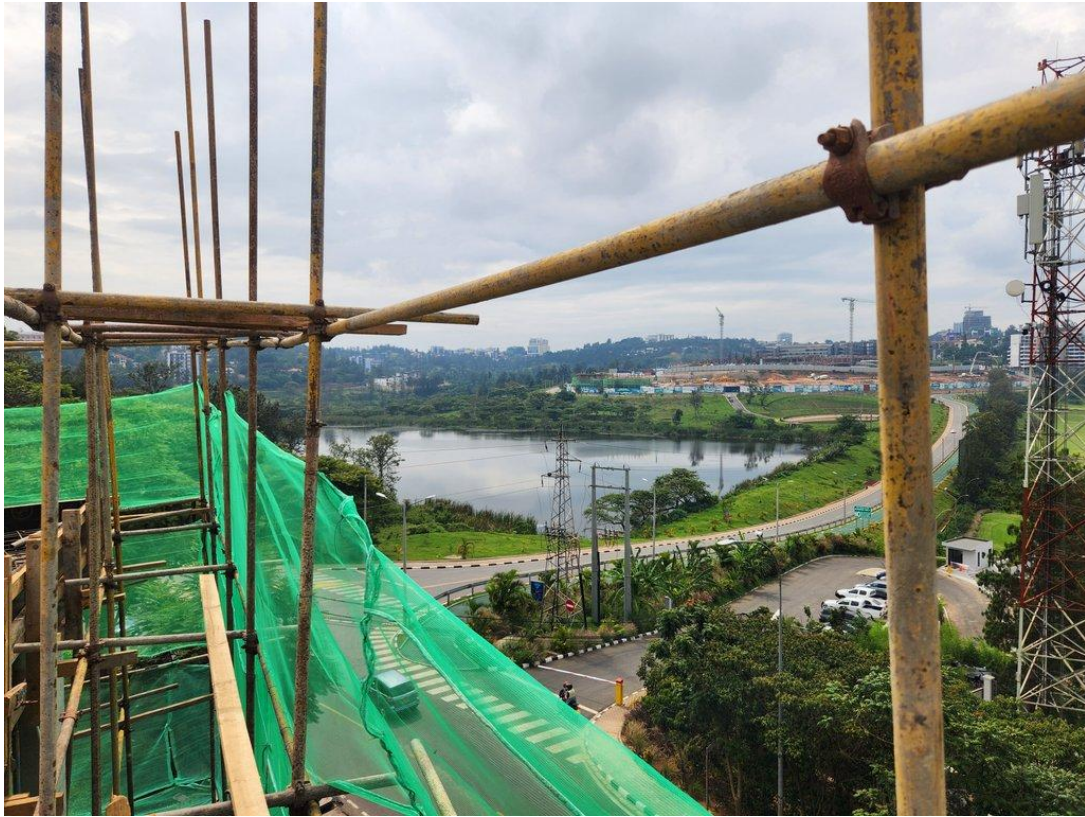
Views from Phase 4, block O