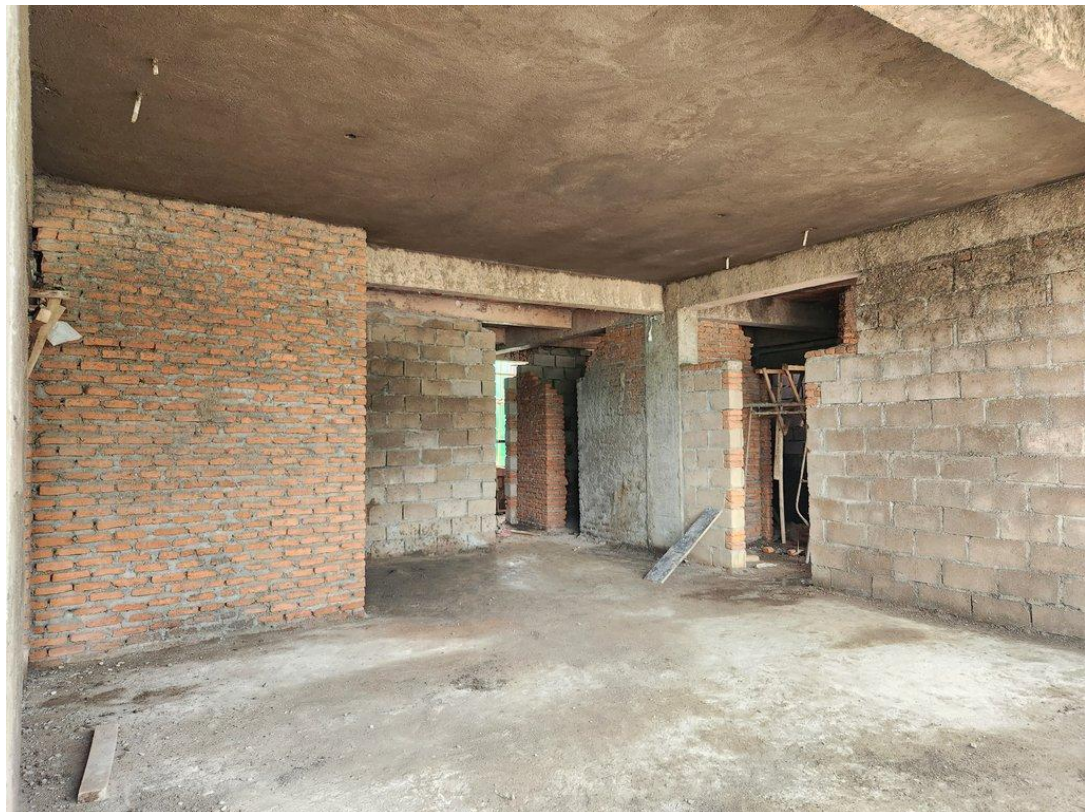
Inside one of the apartments in phase 3