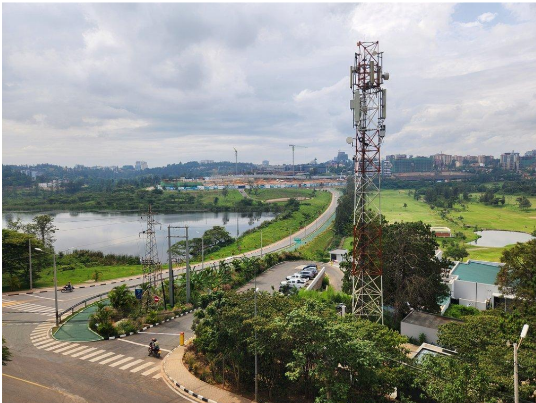
The golf course and lake seen from Phase 4