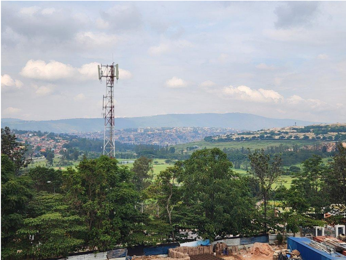
Views from Phase 3, 4 th floor