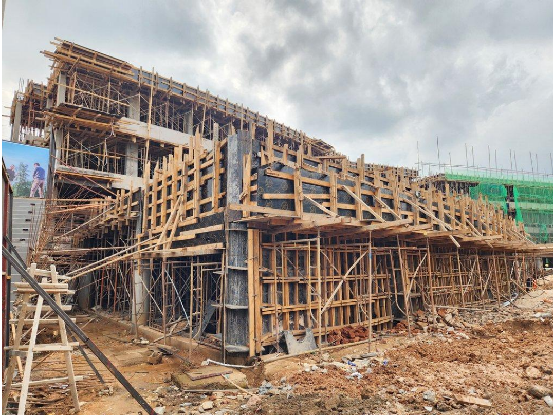
Phase 3 pool area