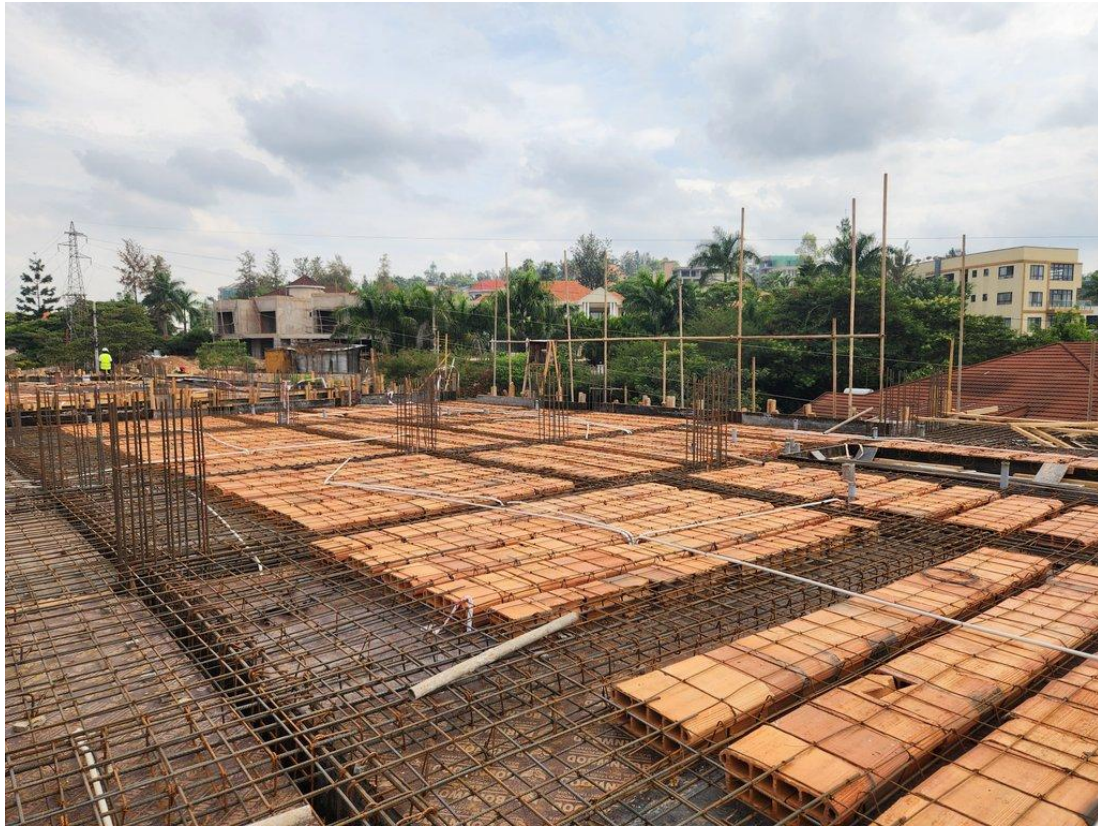
Preparation for slab casting, 4 th floor Phase 1 and 2