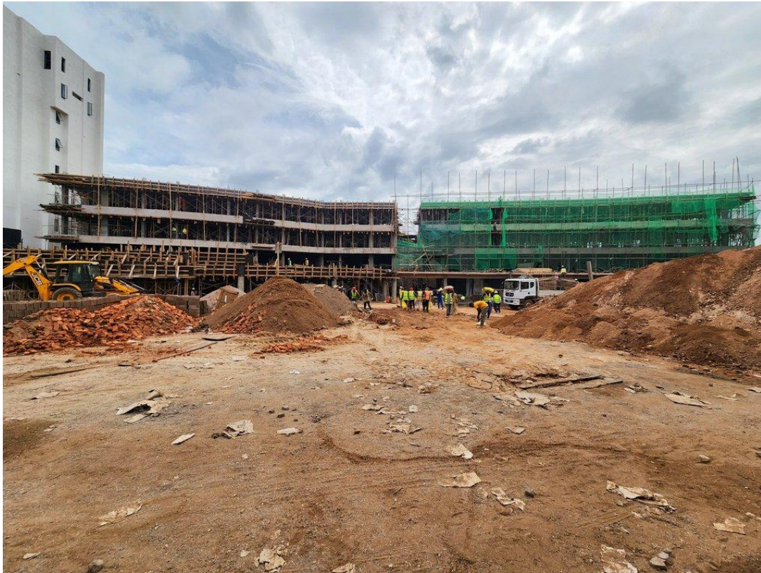
View of Phase 3 and 4 from the front yard