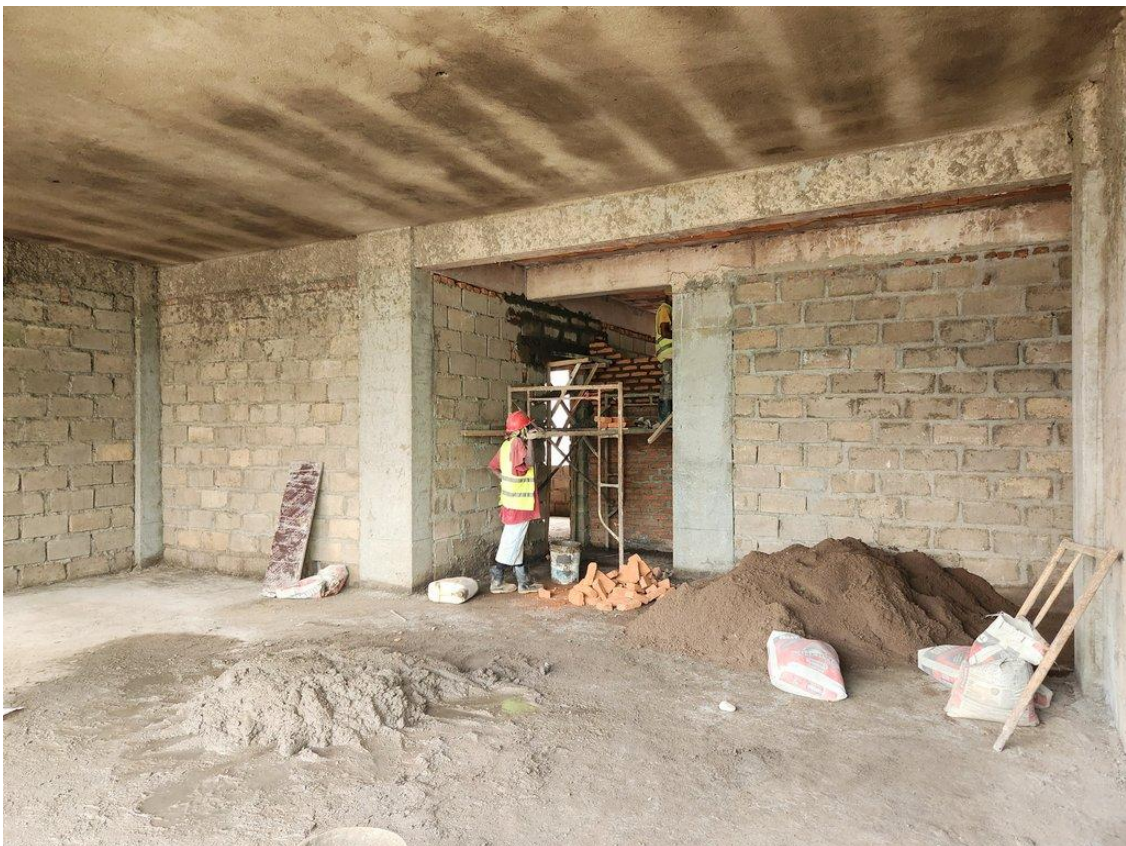
Works progressing inside the apartments