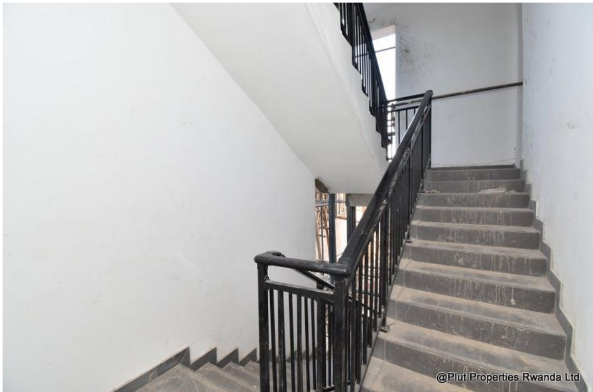
Phase 2 works showing: Railing fitting in one of the staircases