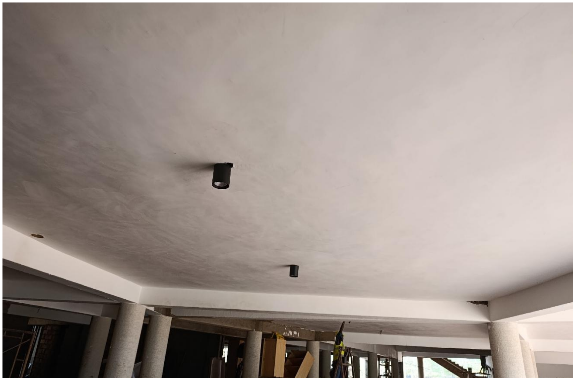
Phase 2 works showing: Light fittings on Level 1 parking