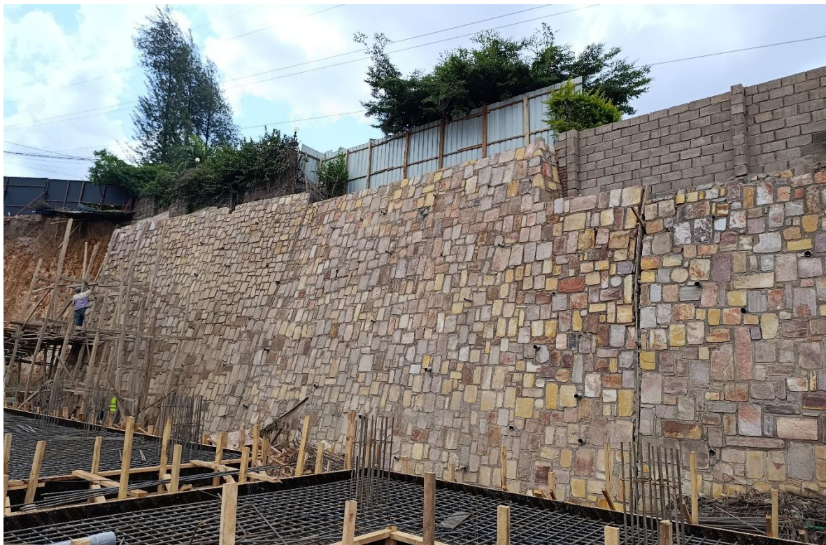
Phase 3 & 4 works showing: Stone masonry retaining wall