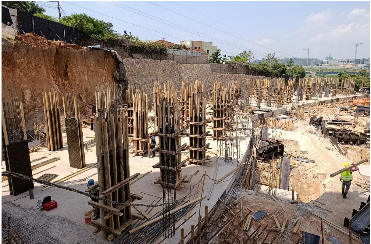
Phase 3 & 4 works showing: Steel reinforcement & Formwork for Level 1 columns