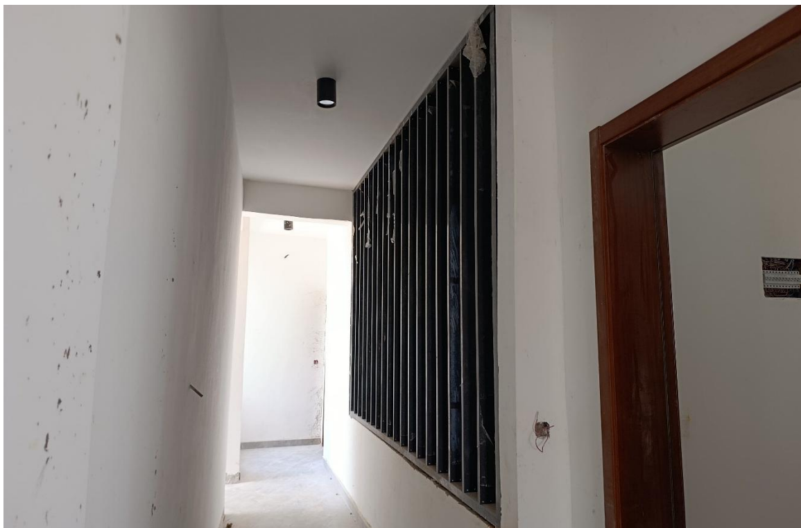
Phase 2 works showing: Grill fitting in one of the corridors