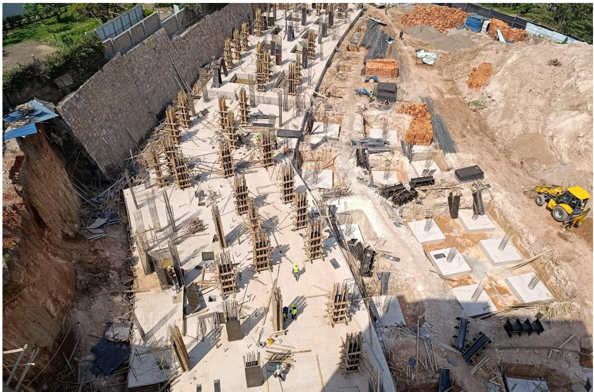
View of Phase 3/4