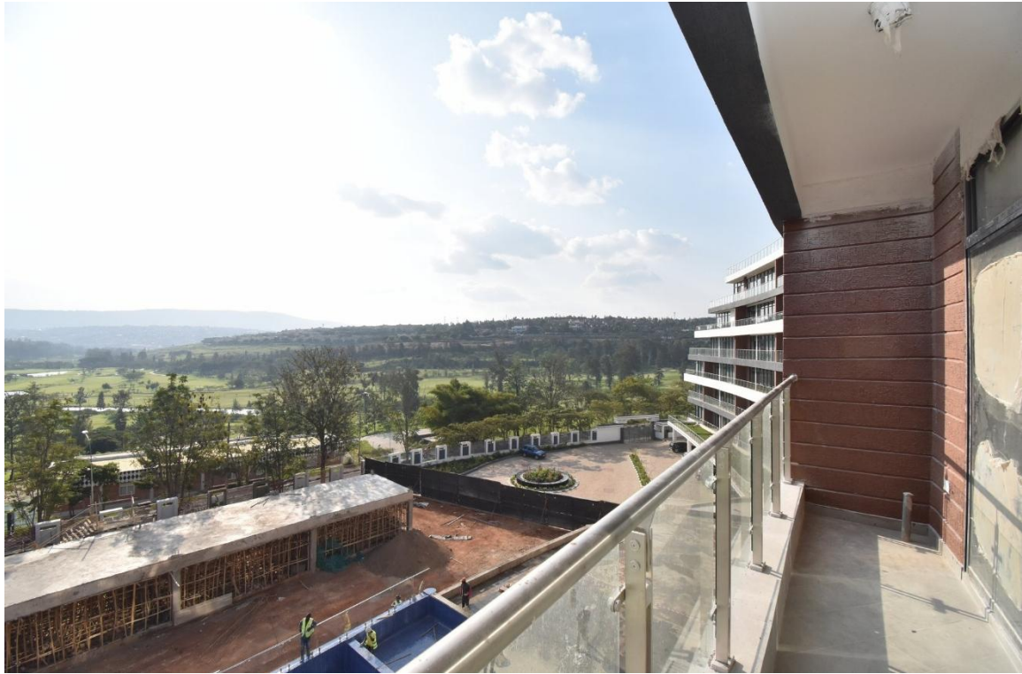
Phase 2 works showing: Railing done at the terrace of one of the units