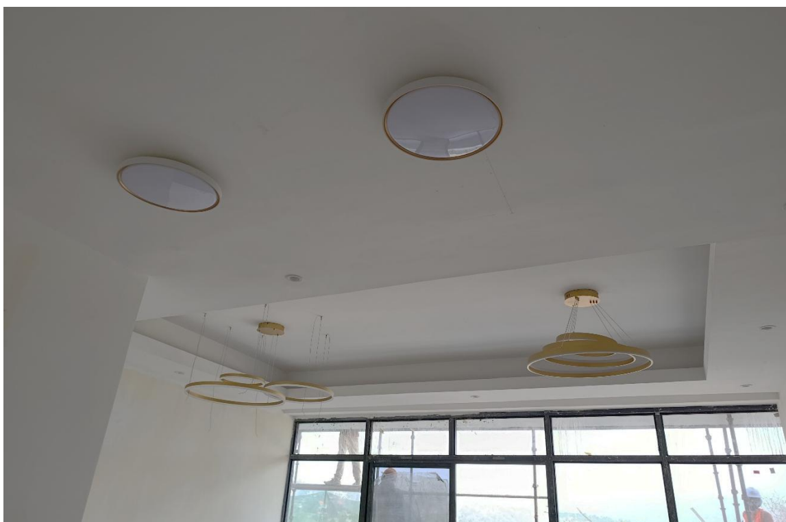
Phase 2 works showing: Light fittings in one of the units