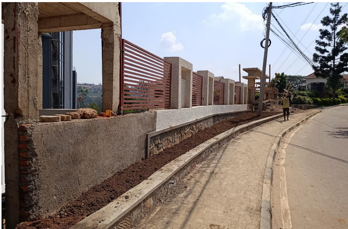
Phase 2 works showing: Formwork to columns for drop-off slab