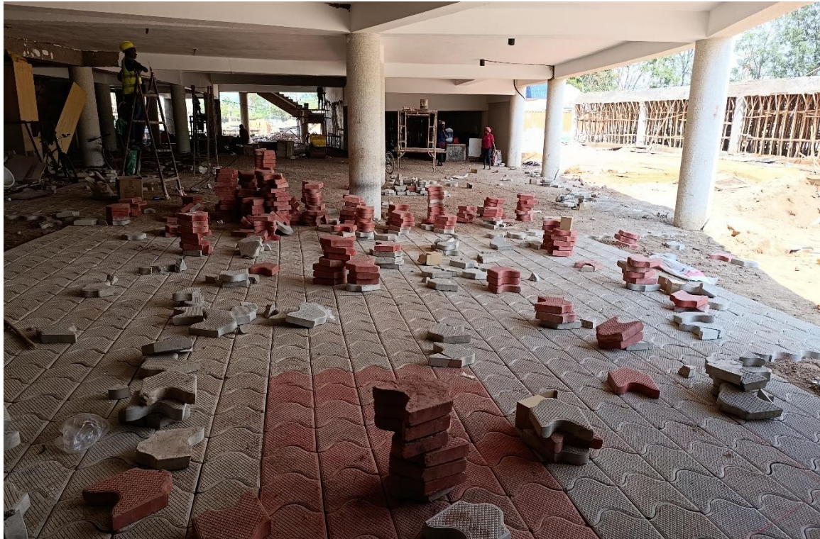
Phase 2 works showing: Laying of pavers at parking on Level 1