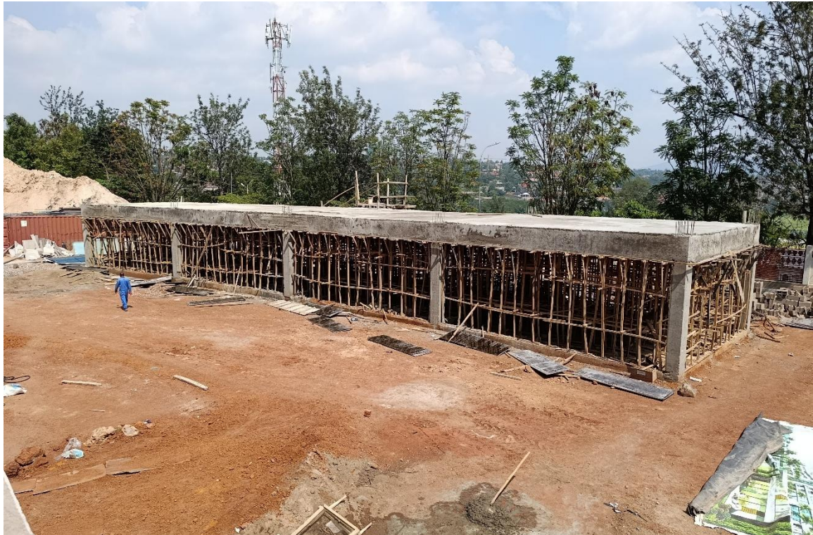
Phase 2 works showing: Cast cover slab of retail shops