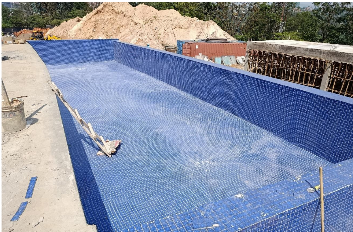
Phase 2 works showing: Tiling in swimming pool