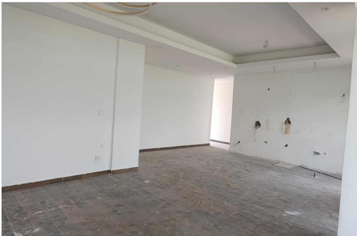
Phase 2 works showing: Paint skimming in one of the units