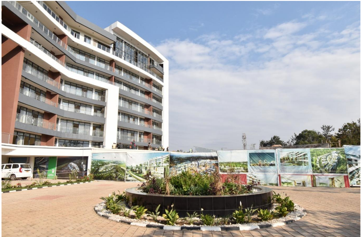
View of Phase 2