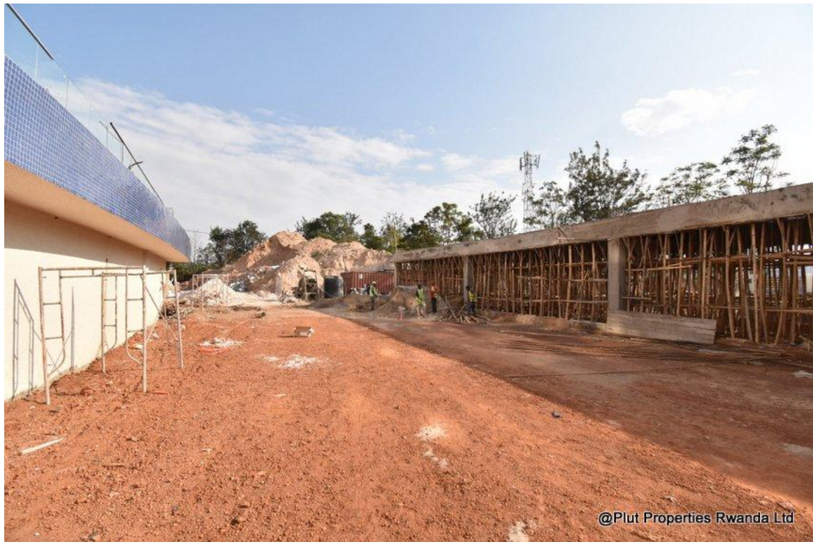
Phase 1 works showing: Compacted driveway at the retails