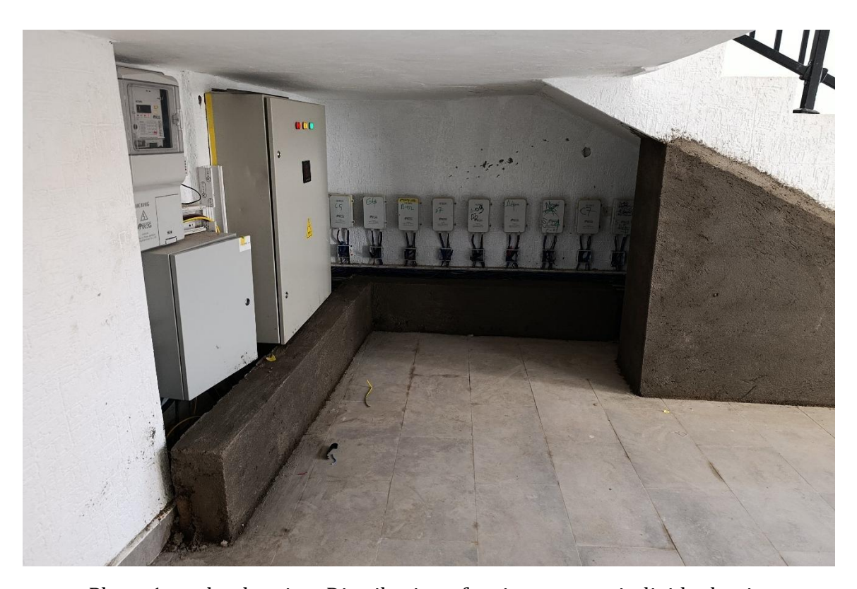
Phase 1 works showing: Distribution of main power to individual units