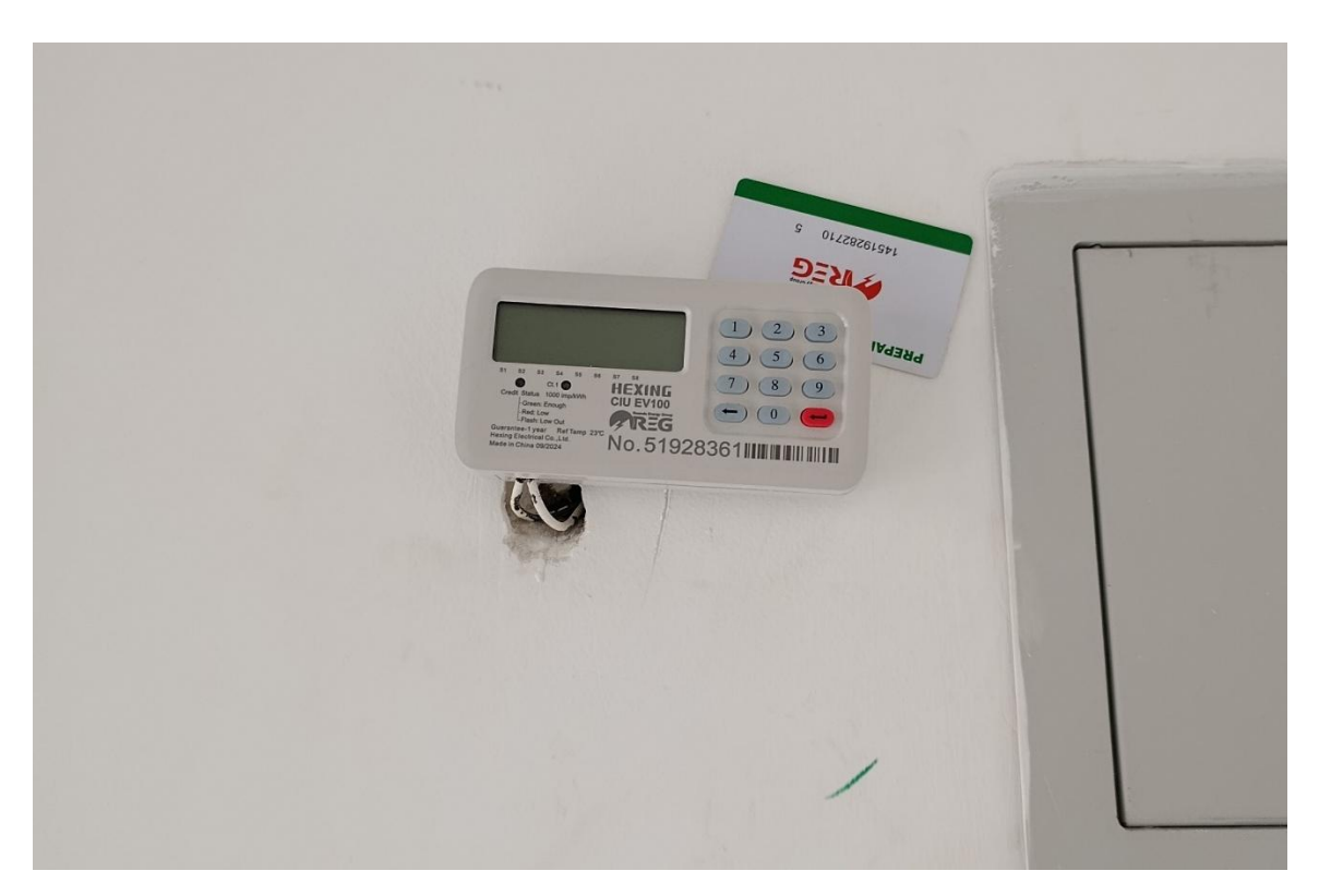
Phase 1 works showing: Cashpower meter installed in one of the units