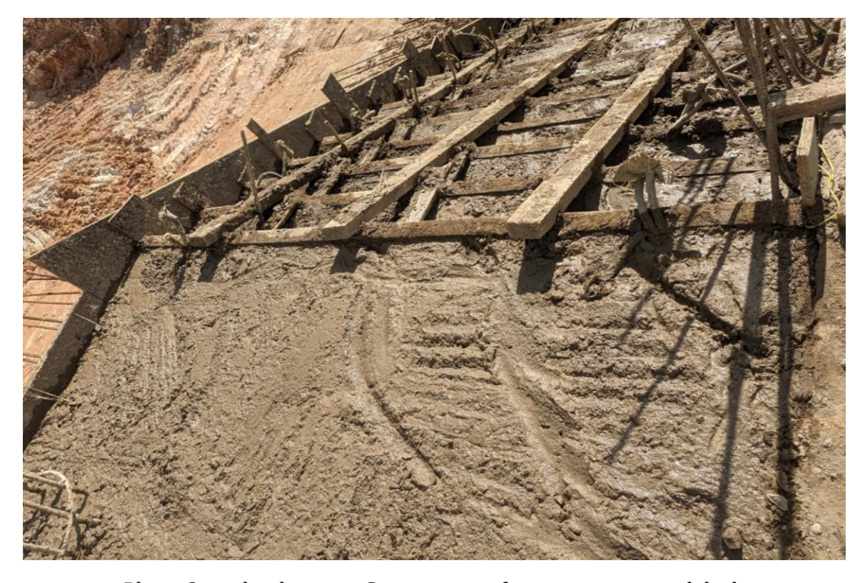
Phase 2 works showing: Cast concrete for staircase to pool deck