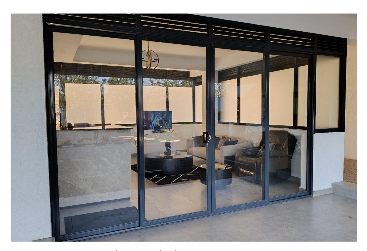
Phase 1 works showing: Reception