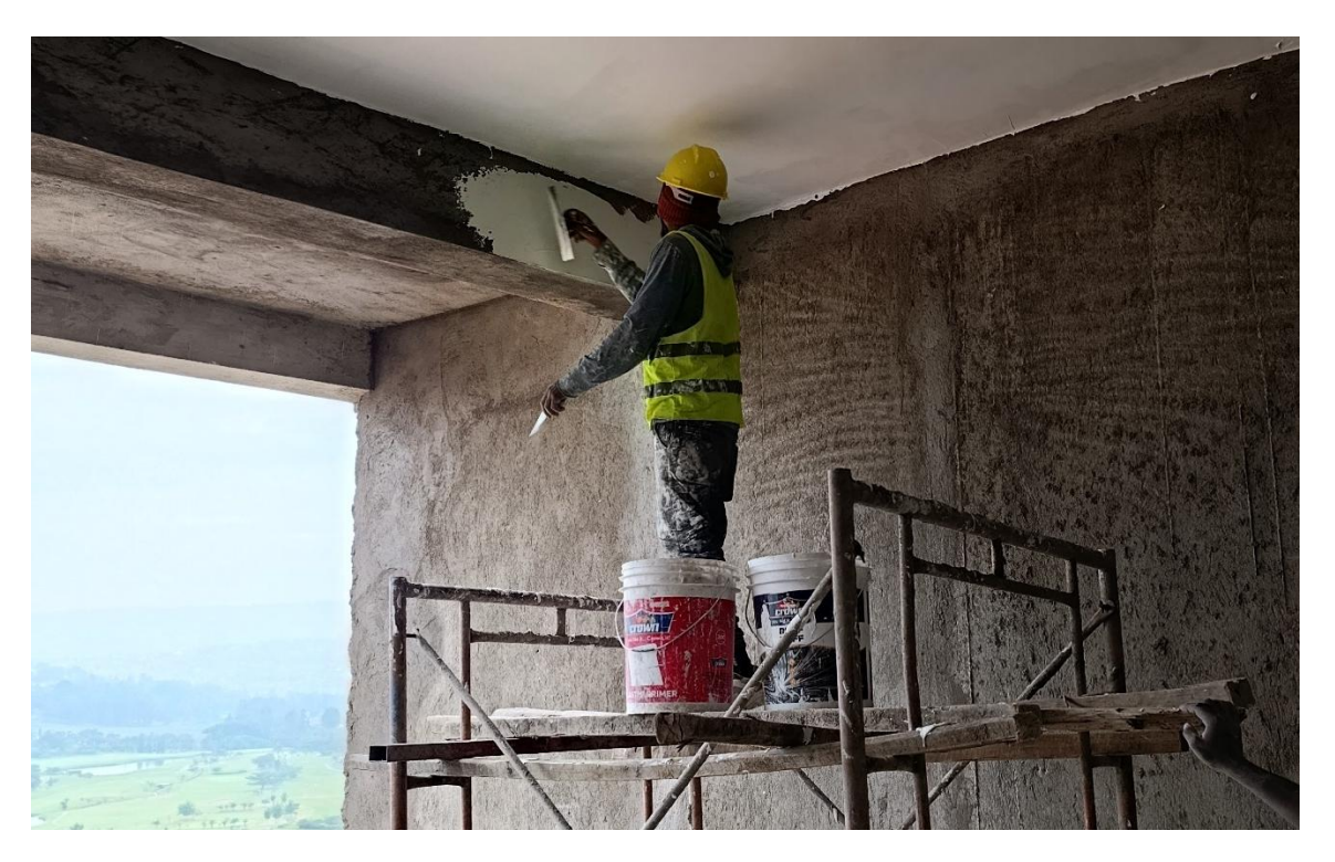
Phase 2 works showing: Internal wall skimming in one of the units