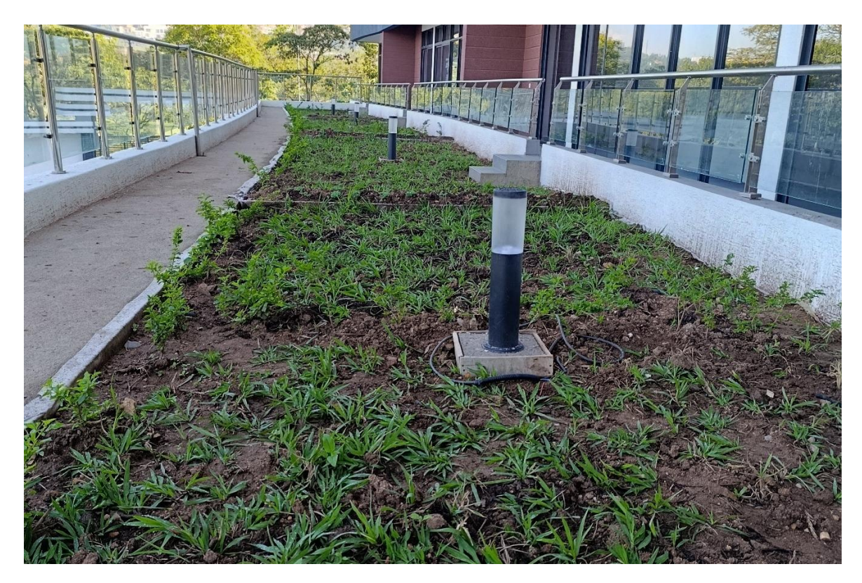
Phase 1 works showing: Garden lights installed on deck at level 2 \,