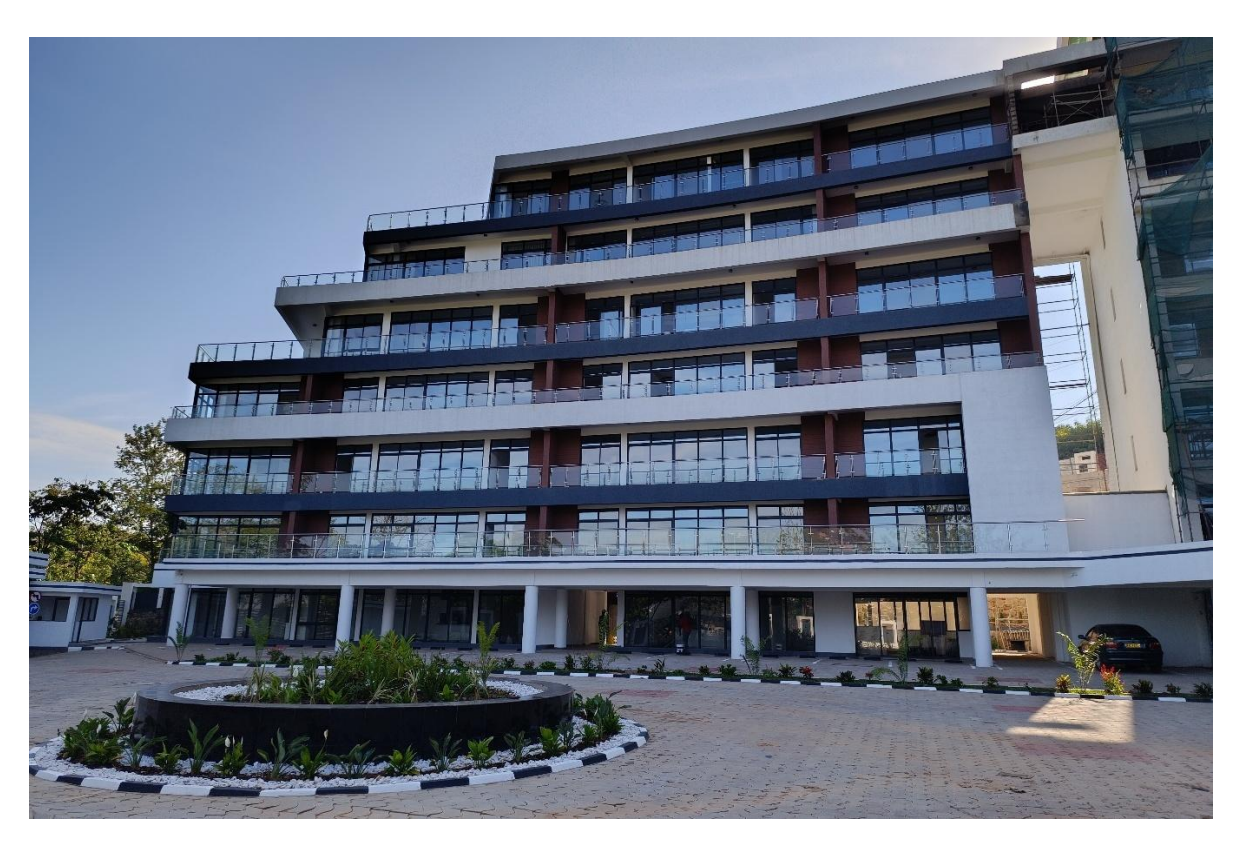
View of Phase 1