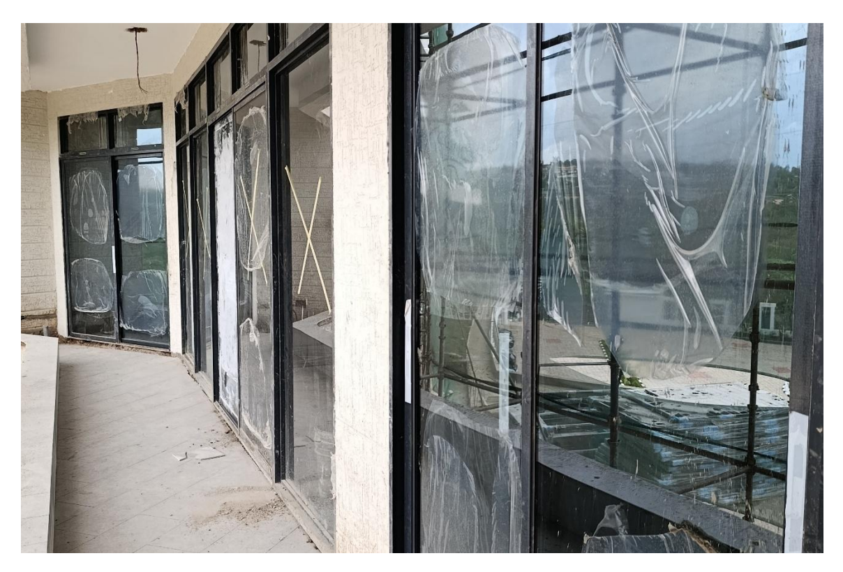
Phase 2 works showing: Curtain wall glazing installed in one of the units