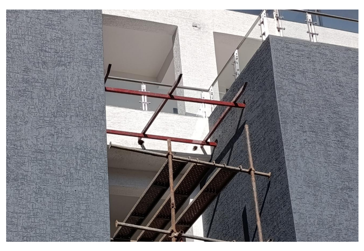
Phase 1 works showing: Framing for canopy to shield balconies from rain