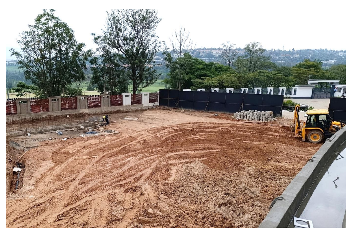
Phase 1/2 works showing: Backfill and compaction in preparation for paving