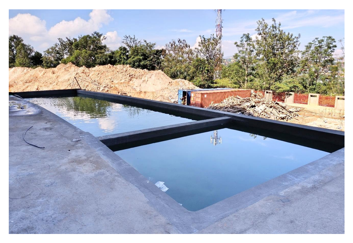
Phase 2 works showing: Testing of swimming pool for leakages before tilework