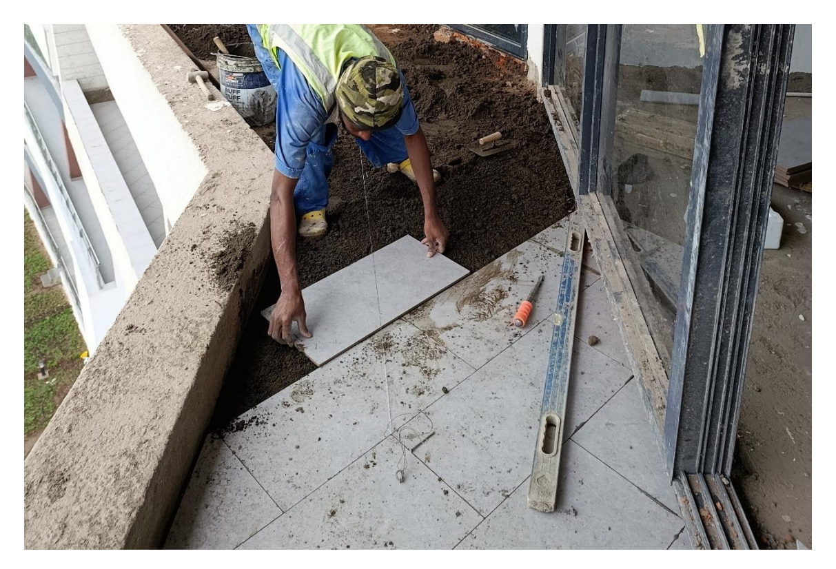
Phase 2 works showing: Floor tiling in the terrace one of the units