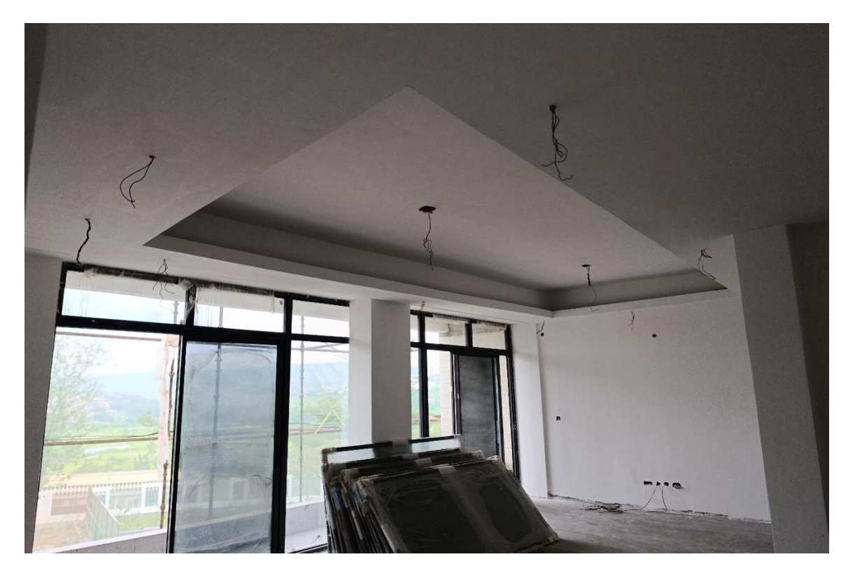
Phase 2 works showing: Skimmed gypsum ceiling with lighting wiring