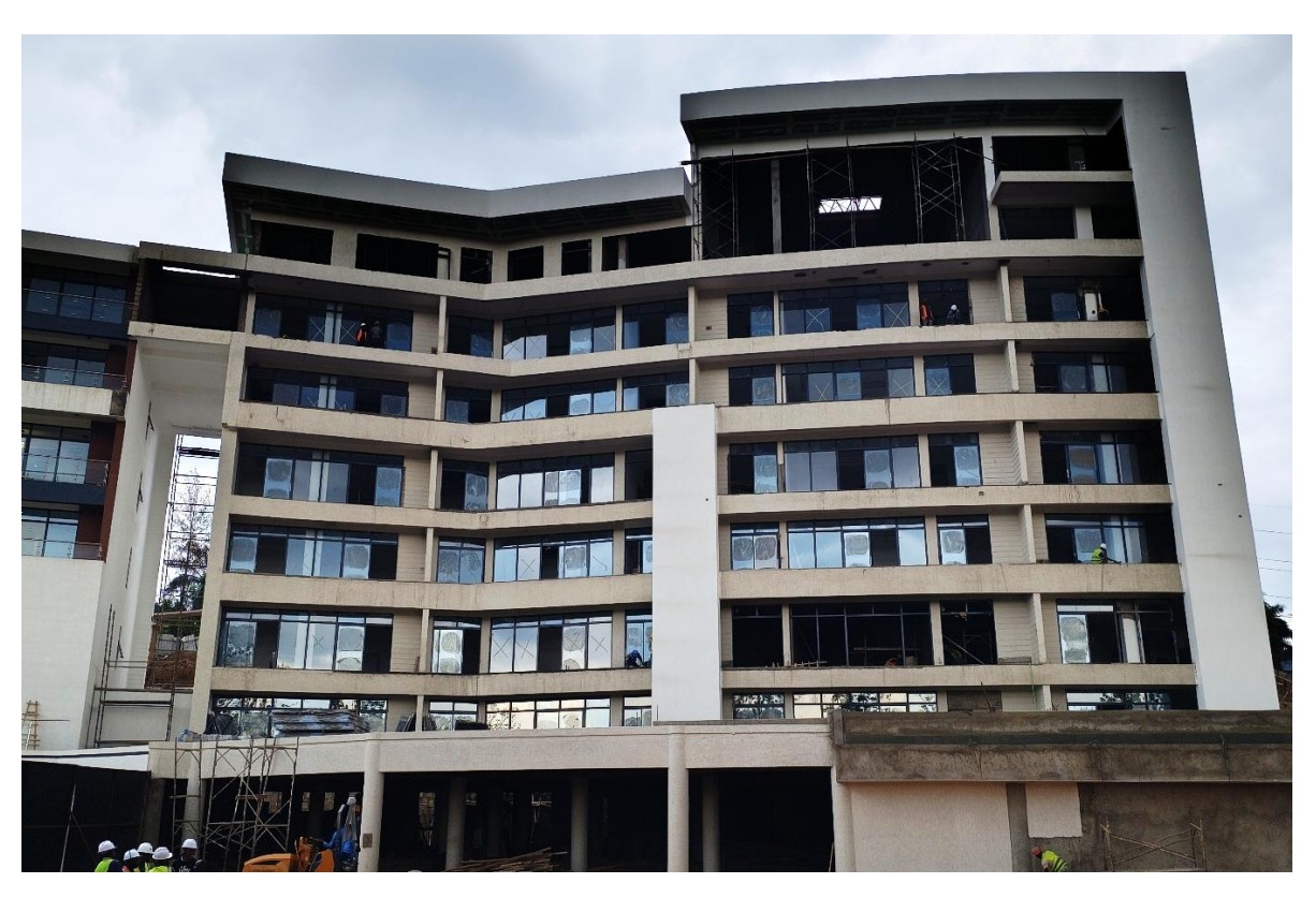
View of Phase 2