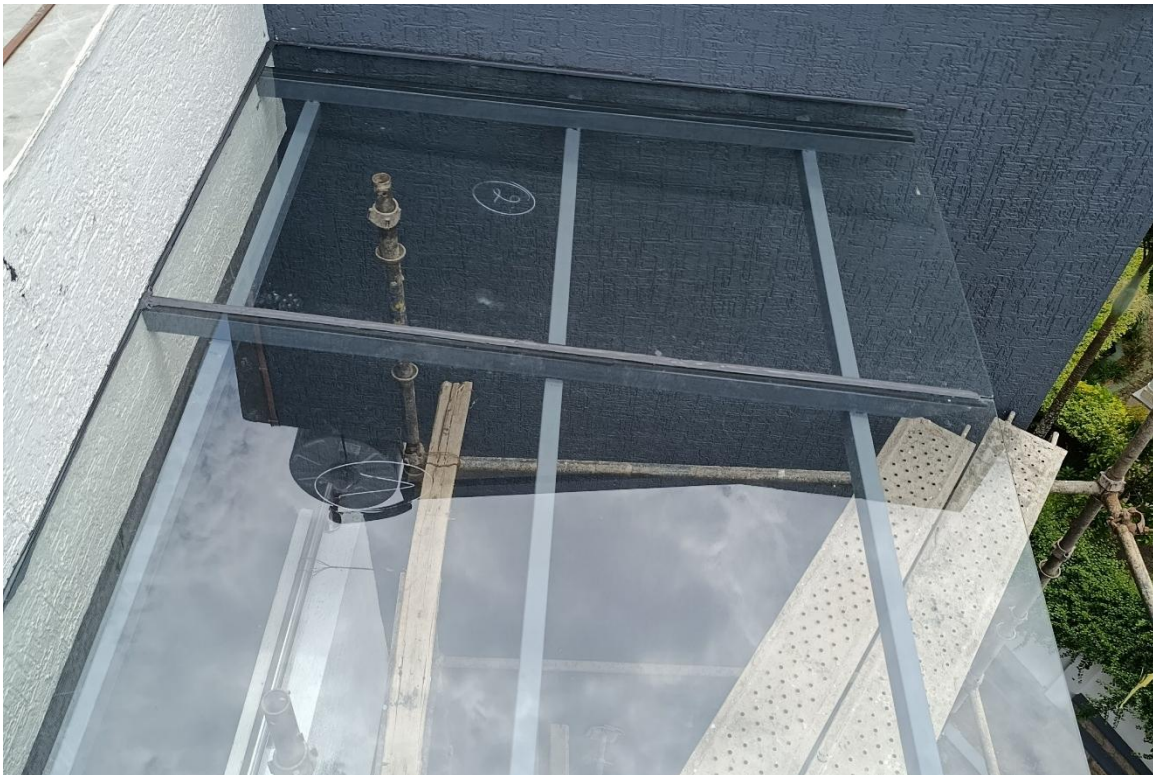
Phase 1 works showing: Framing for canopy to shield balconies from rain