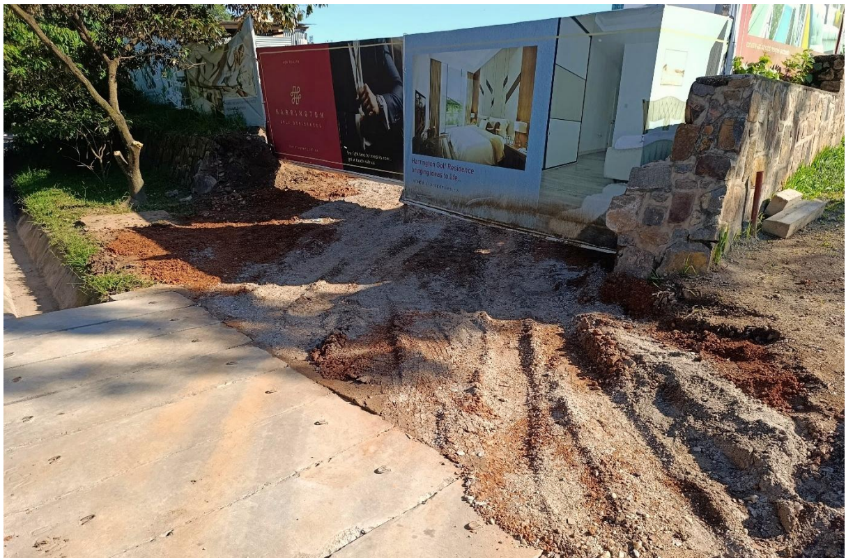
Phase 3 & 4 works showing: Vehicular access for circulation