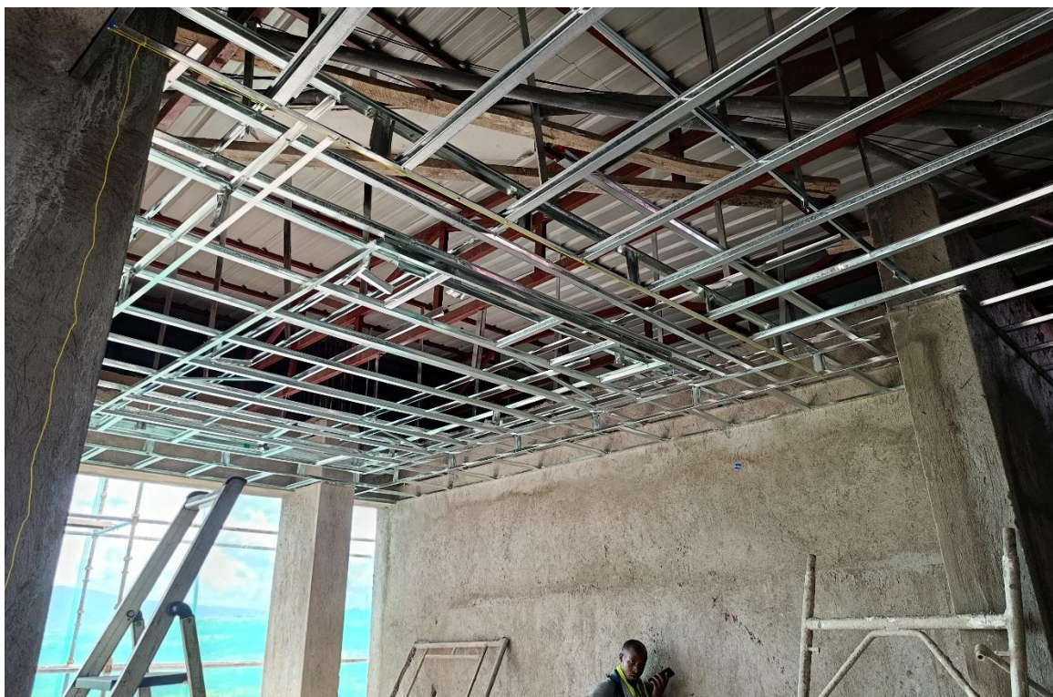
Phase 2 works showing: Brandering for gypsum ceiling at penthouse