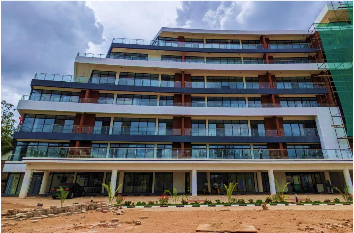
View of Phase 1