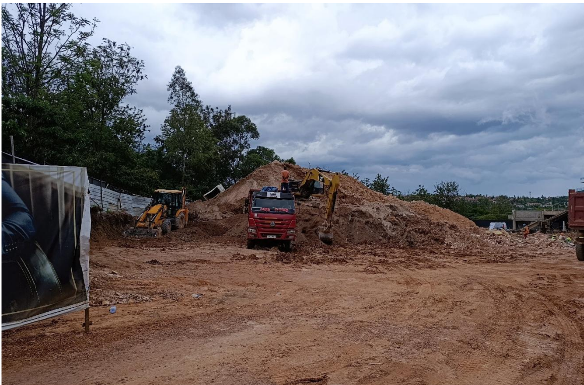
Phase 3 & 4 works showing: Evacuation of excavated soil