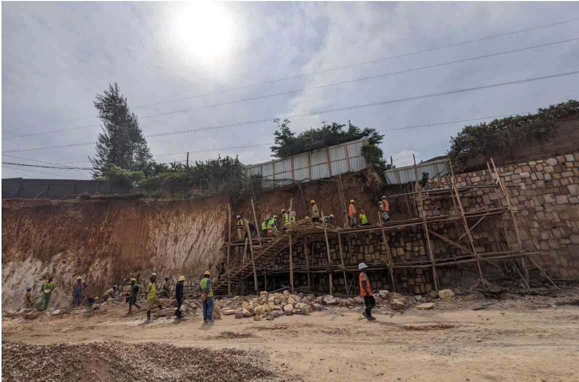
Phase 3 & 4 works showing: Stone masonry walling of retaining wall