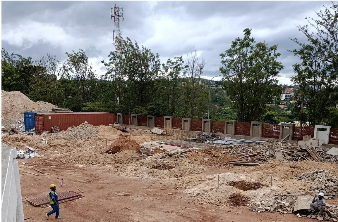
Phase 2 works showing: Excavation for column footings for retail shops