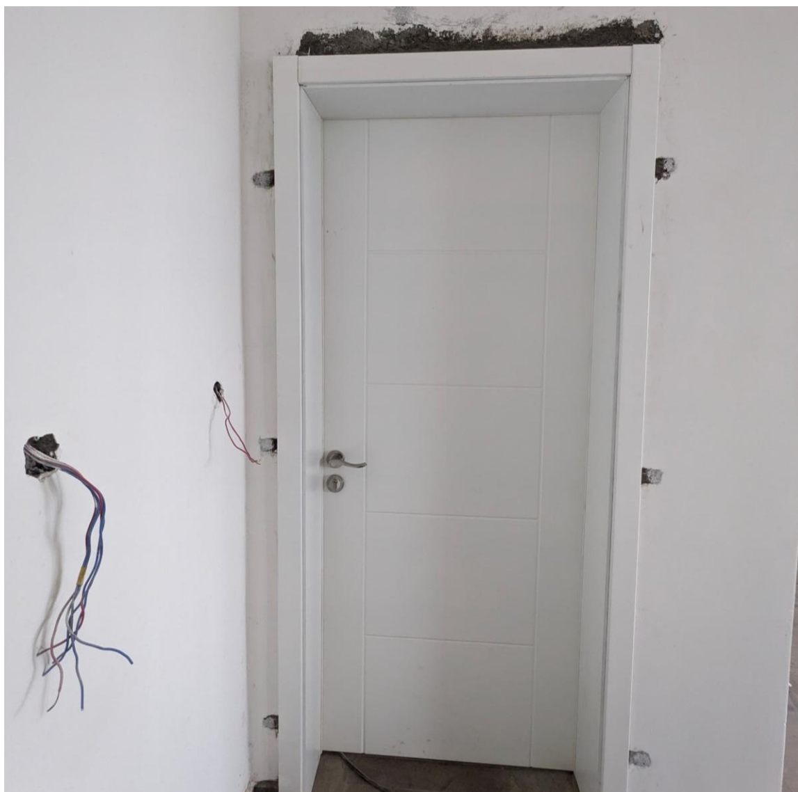
Phase 2 works showing: Internal door installation in one of the units