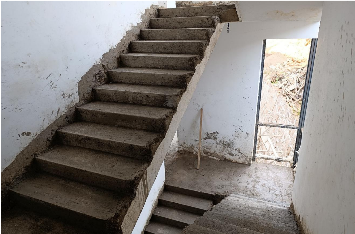
Phase 2 works showing: Screeding on staircase