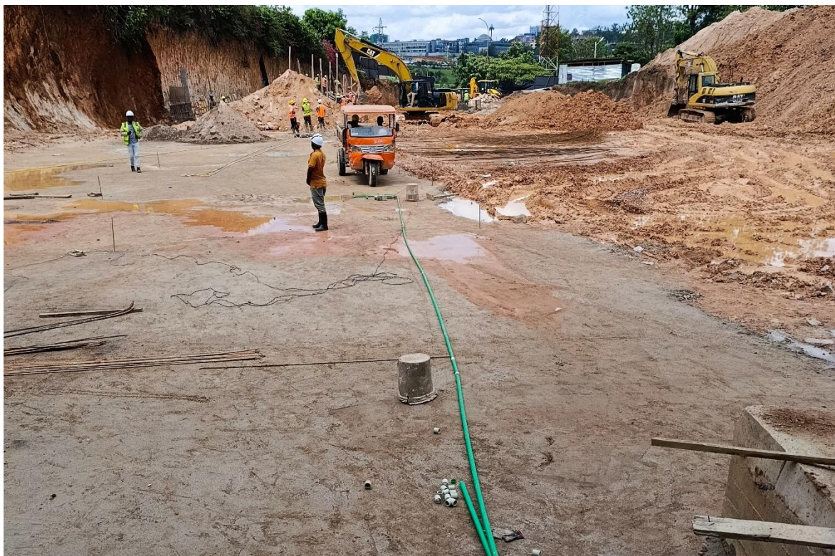
Phase 3 & 4 works showing: Setting out and blinding for footing