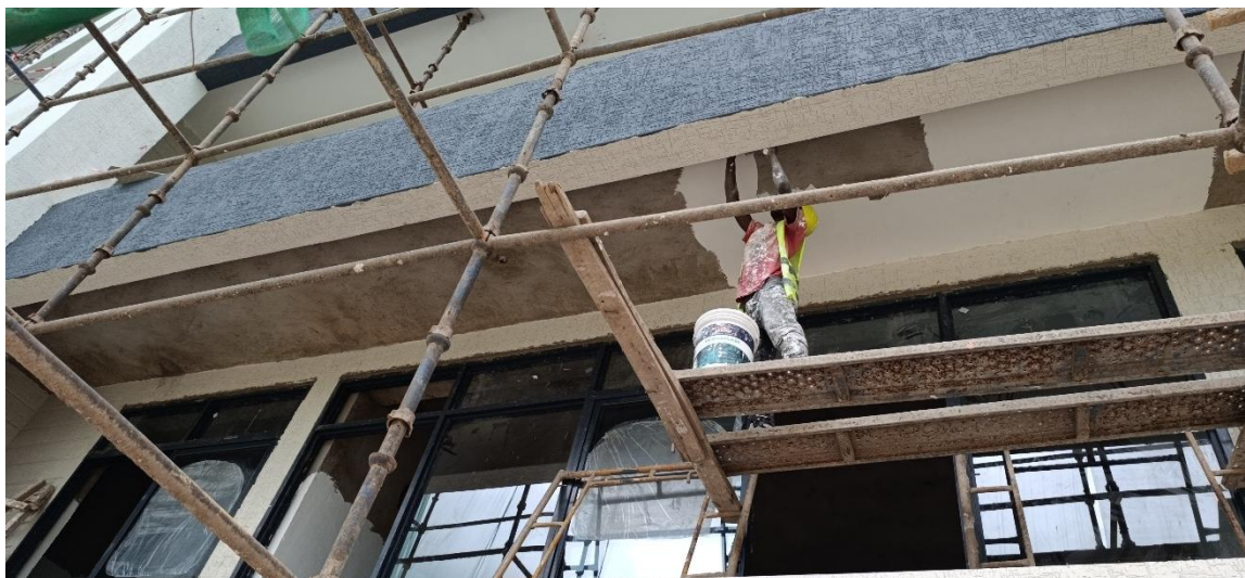
Phase 2 works showing: Skimming on the terrace for one of the units