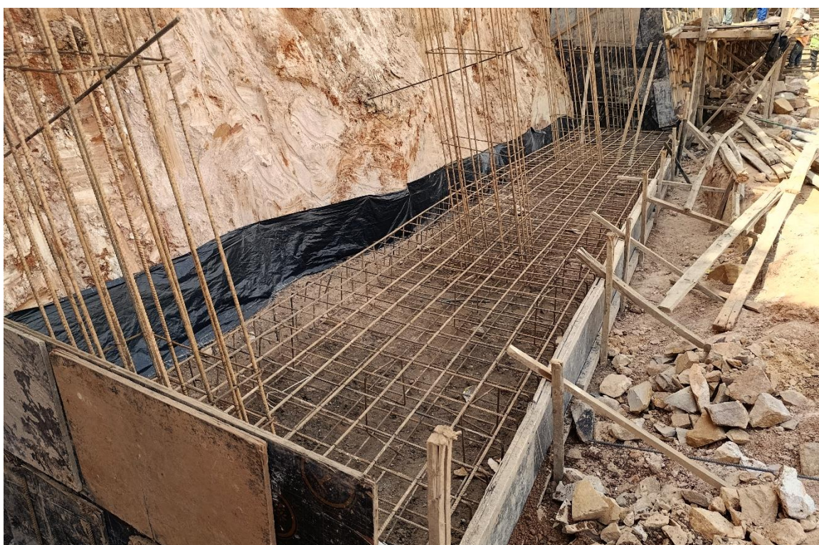
Phase 3 & 4 works showing: Steel reinforcement for retaining wall footing