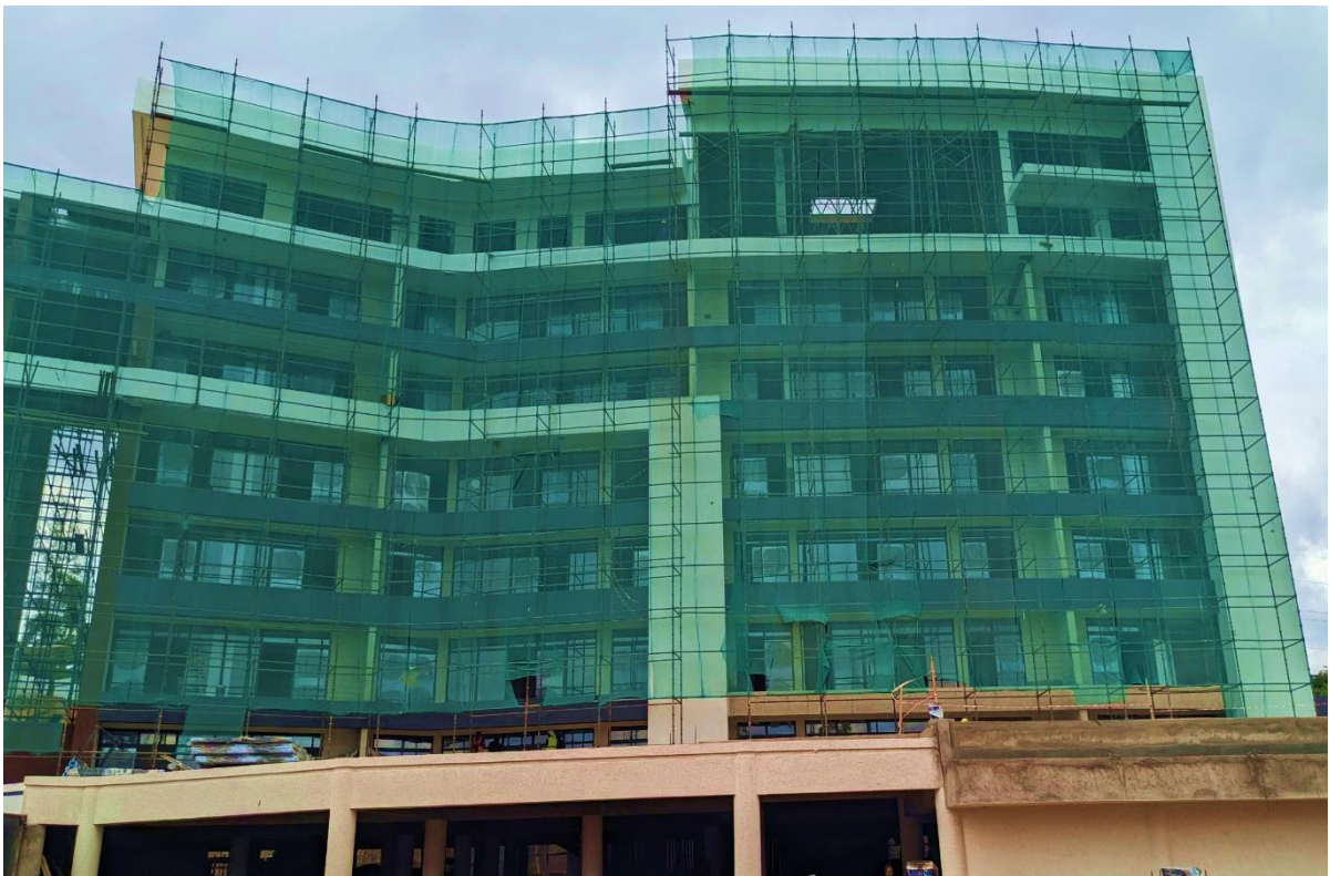
View of Phase 2