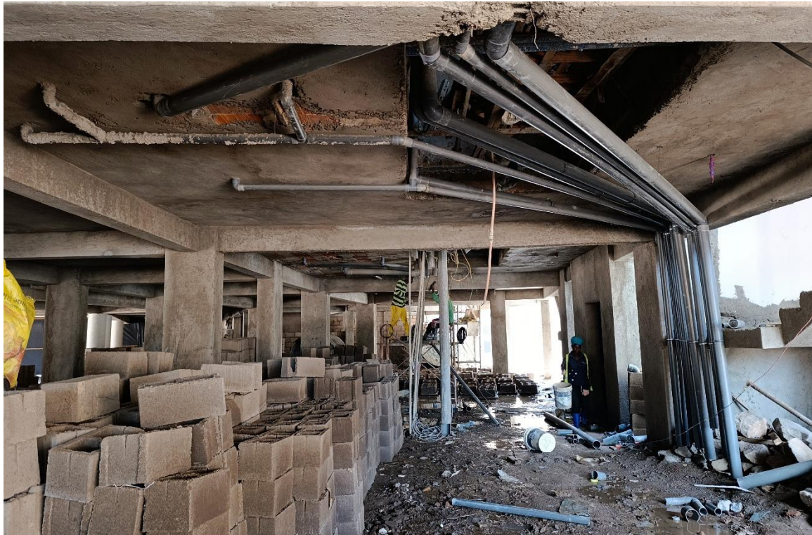
Phase 2 works showing: Storm and foul drainage piping