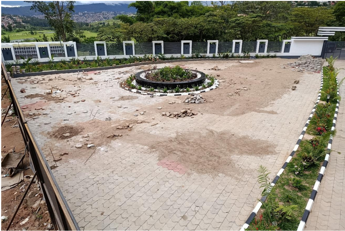
Phase 1 works showing: Repaired pavers that were damaged at the parking