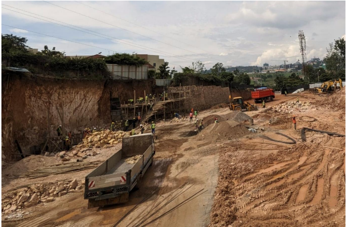
View of Phase 3/4