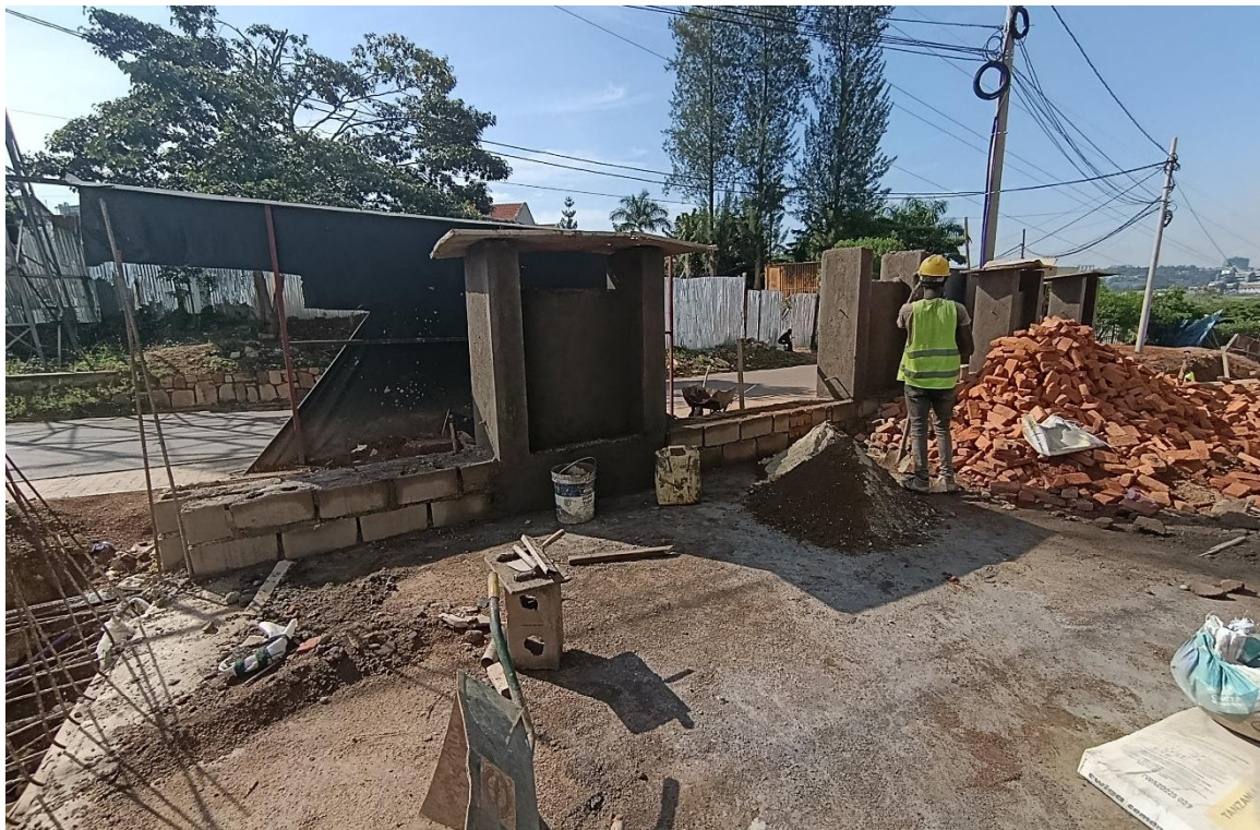
Phase 2 works showing: Masonry walling at the drop-off slab