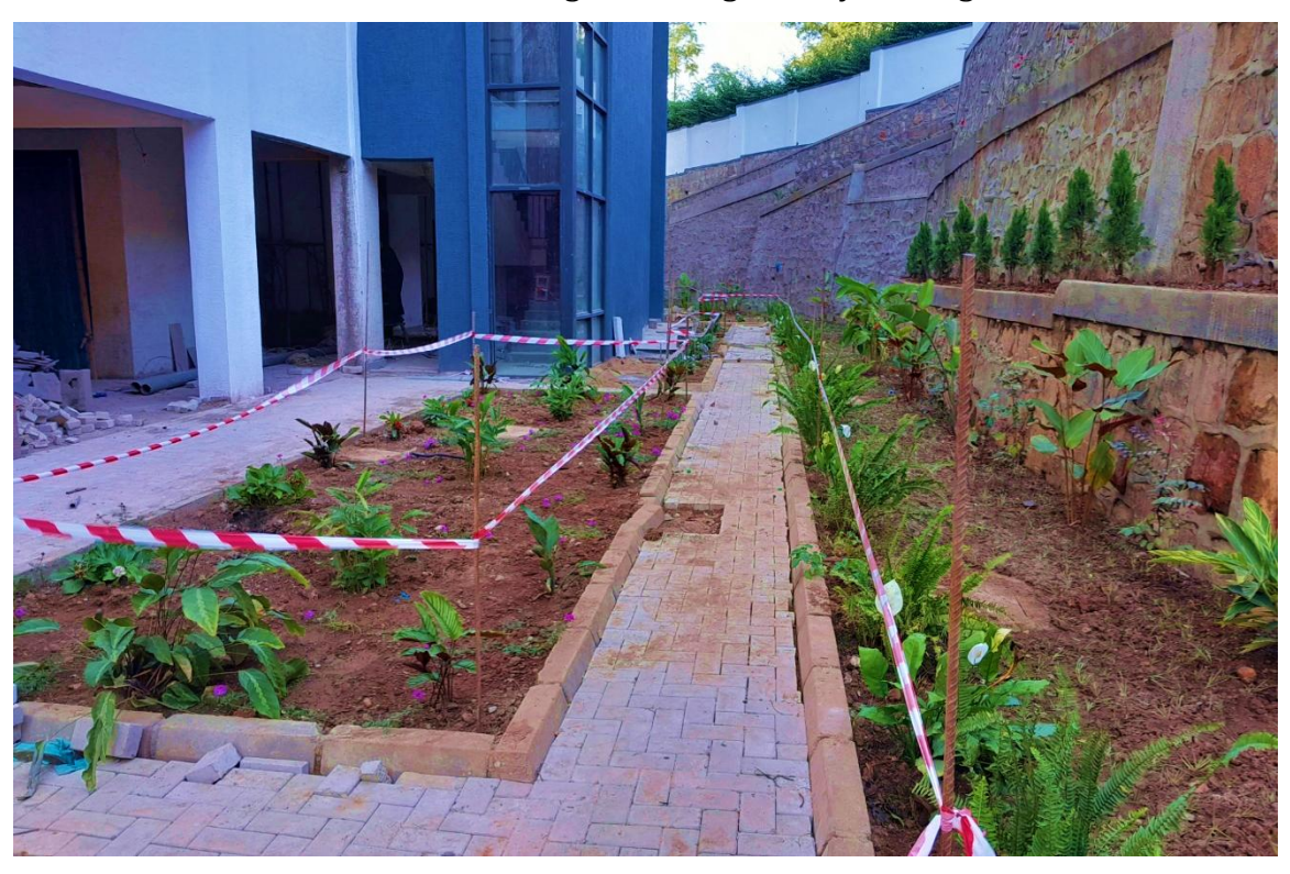
Phase 1 works showing: Landscaped backyard