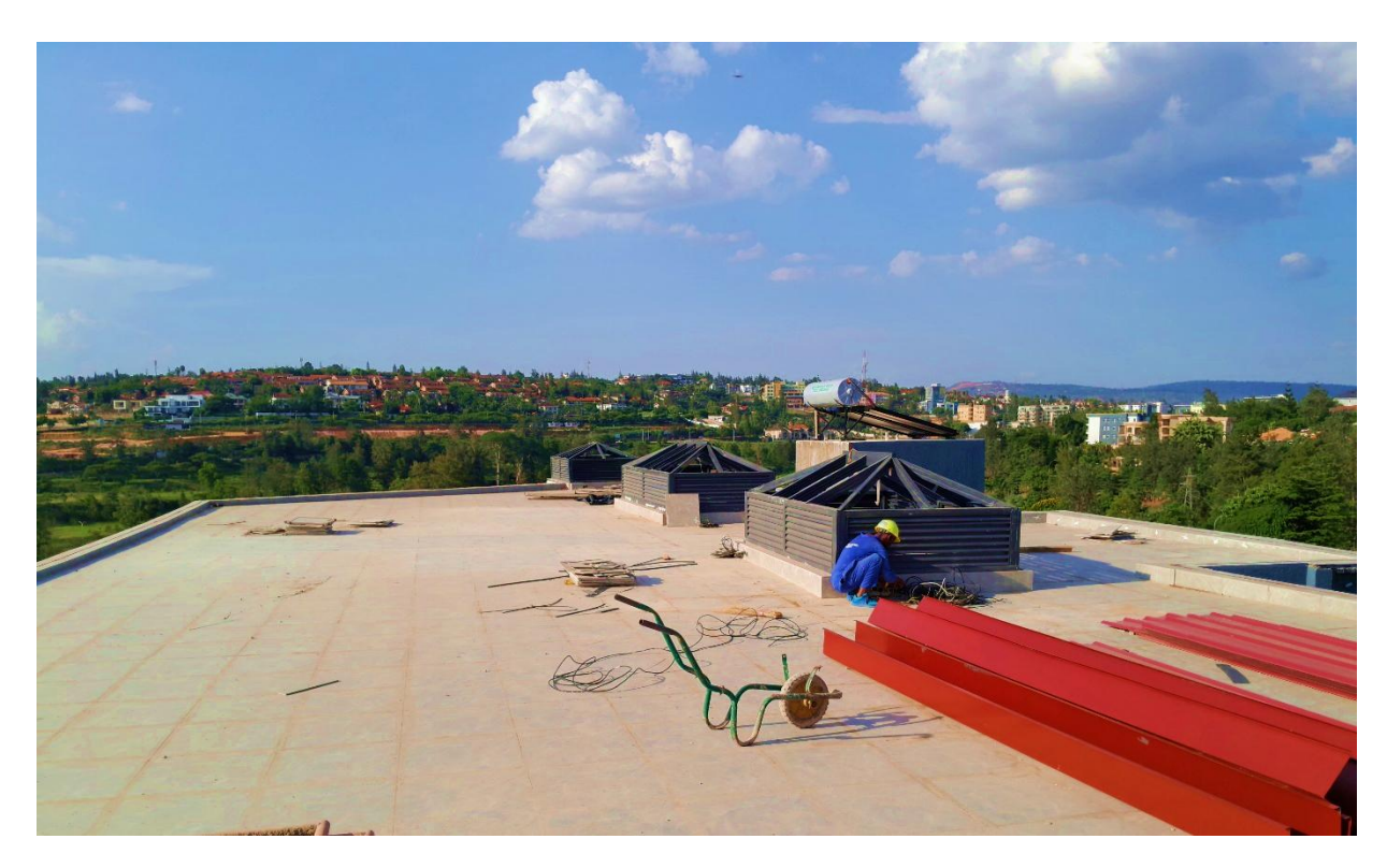
Phase 1 works showing: Vents installed at the roof terrace