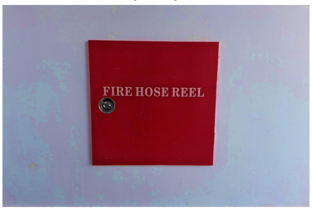
Phase 1 works showing: Fire hose installations in place