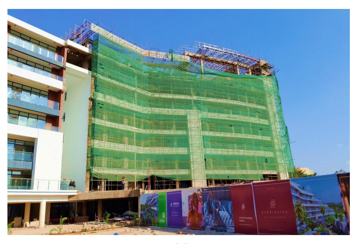
View of Phase 2