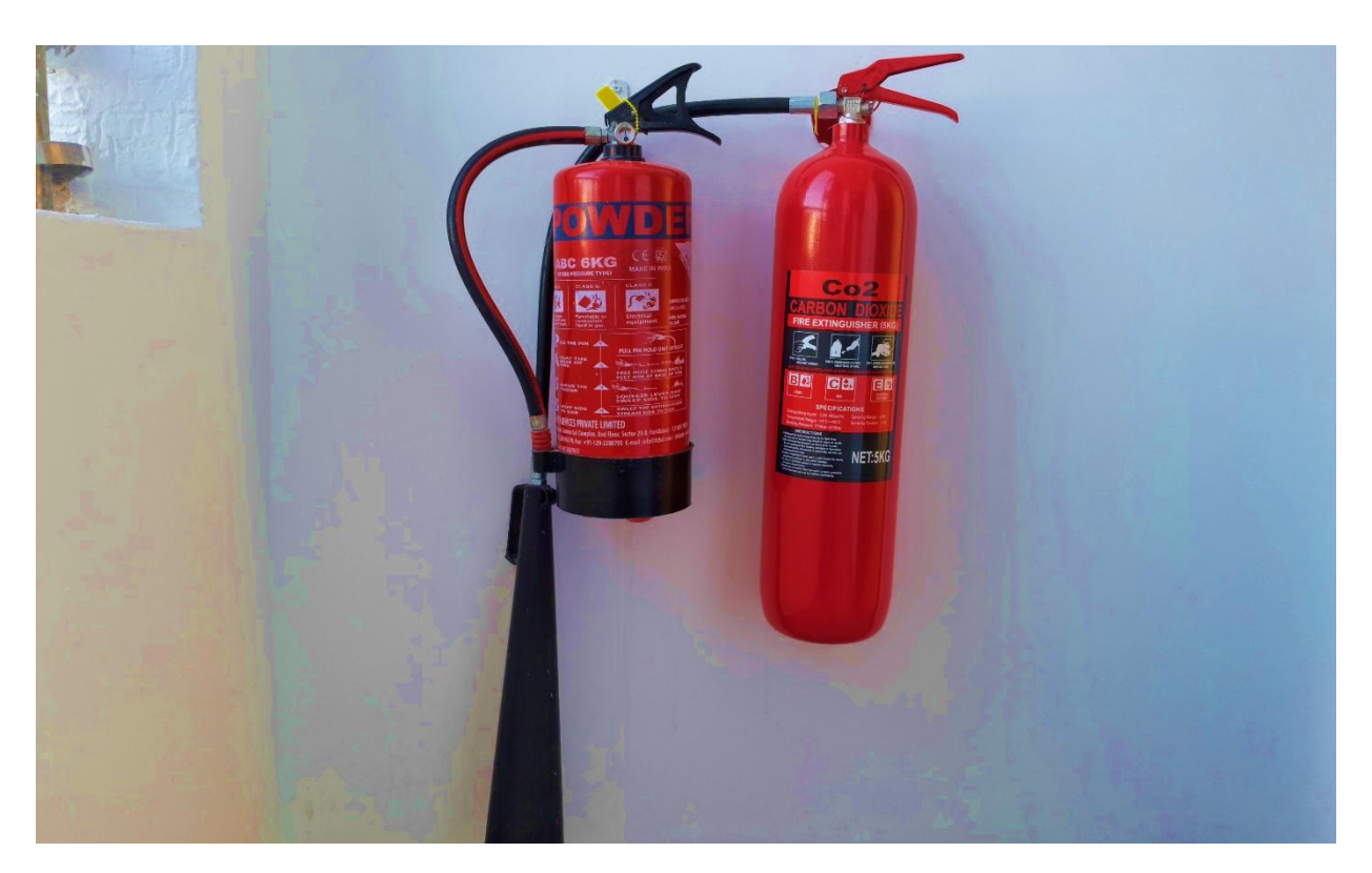
Phase 1 works showing: Fire extinguishers installed