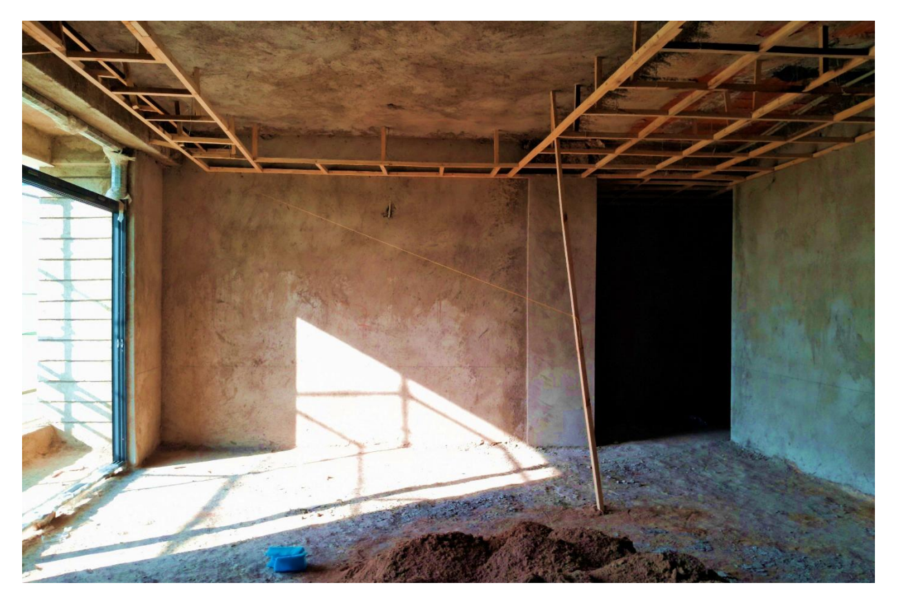
Phase 2 works showing: Internal plaster and ceiling work in one of the units