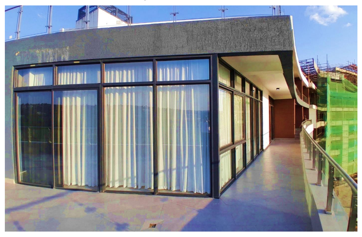
Phase 1 works showing: Finished balcony in one of the units