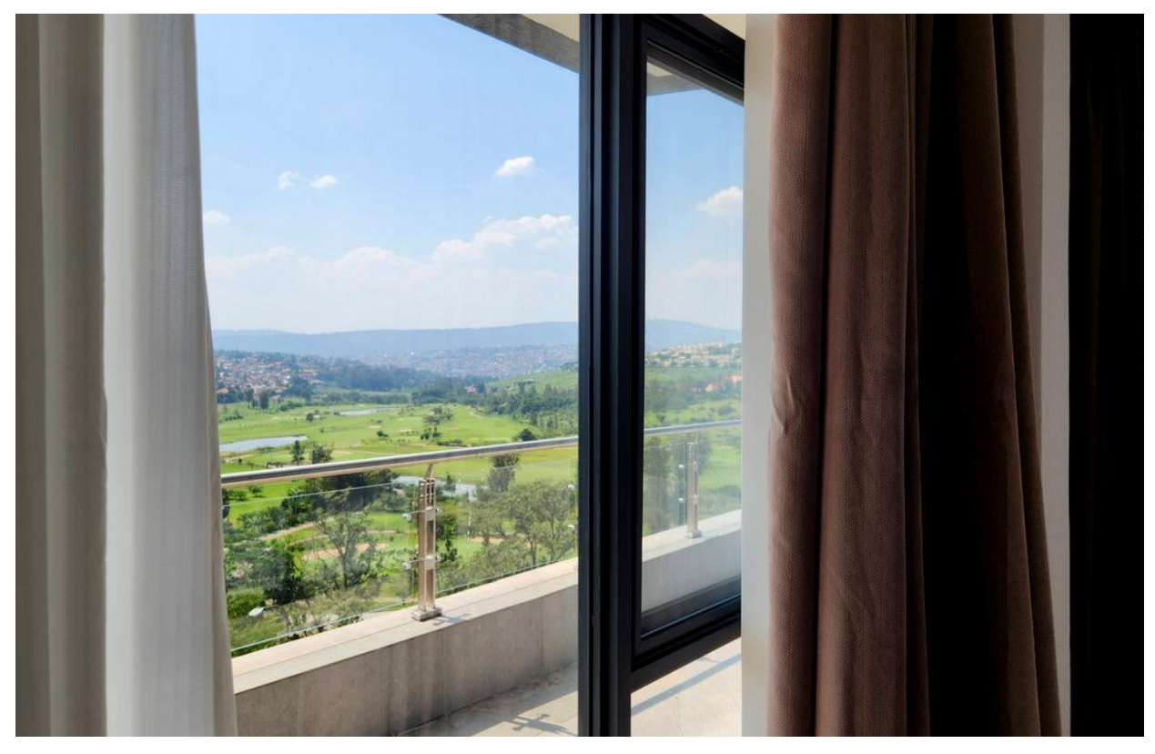
Phase 1 works showing: Views from one of the units being furnished