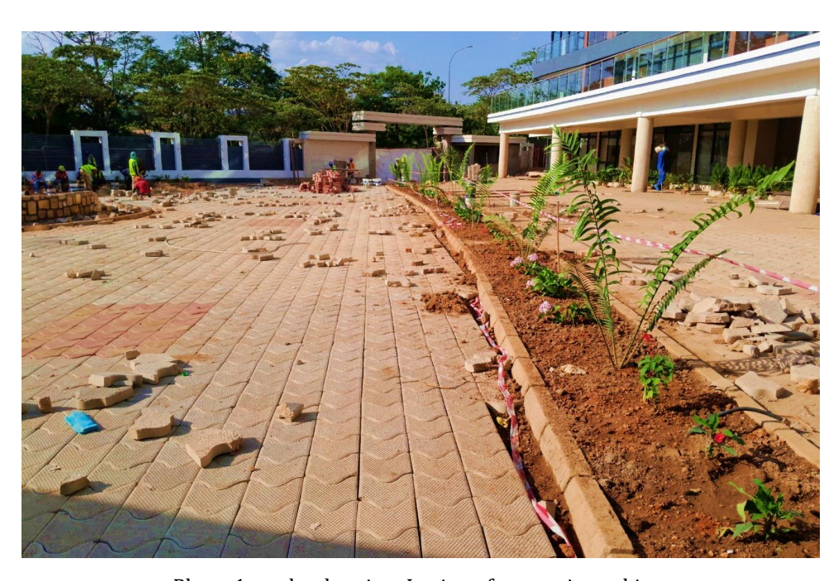
Phase 1 works showing: Laying of pavers in parking.