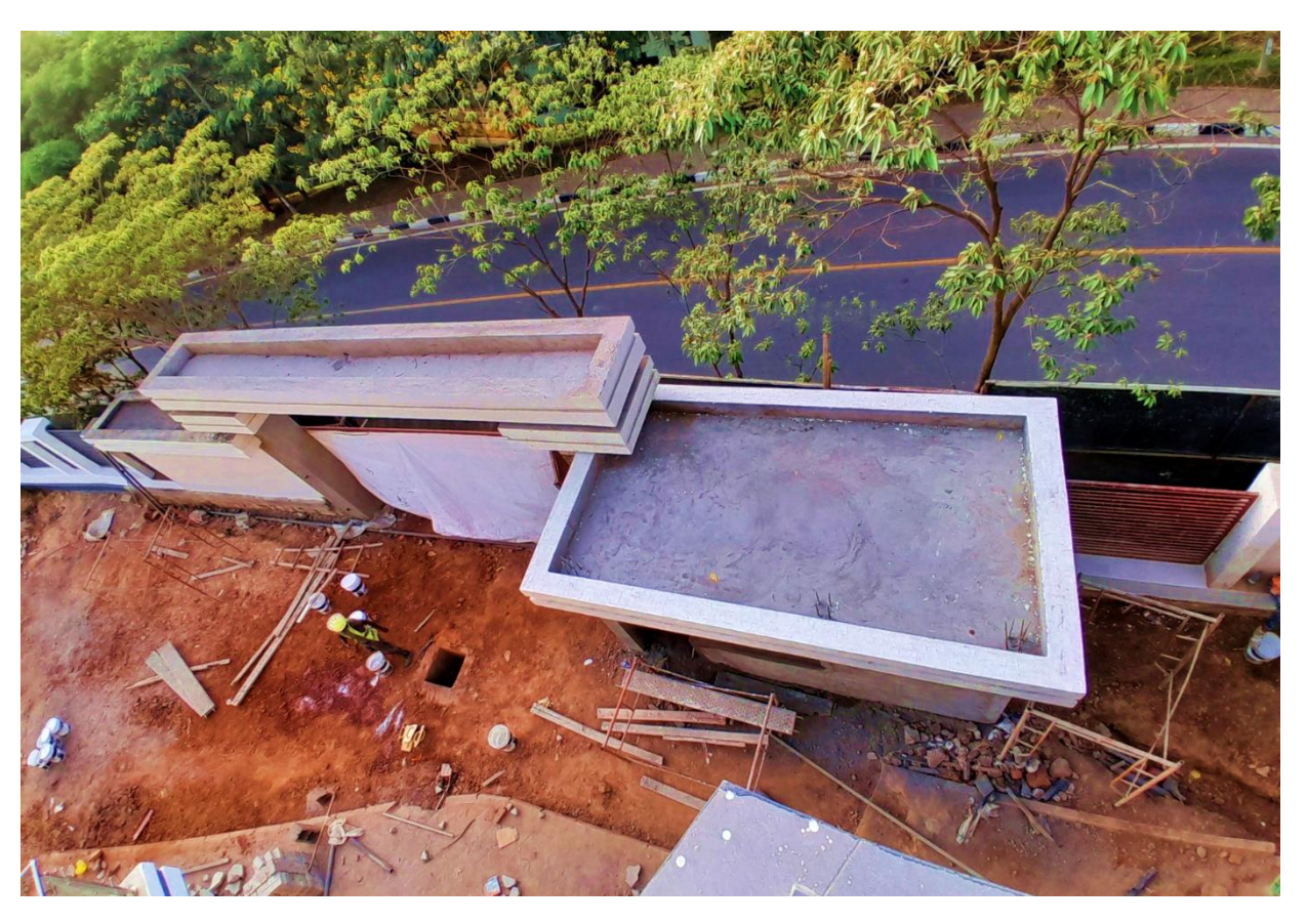
Phase 1 works showing: Gate & guard house