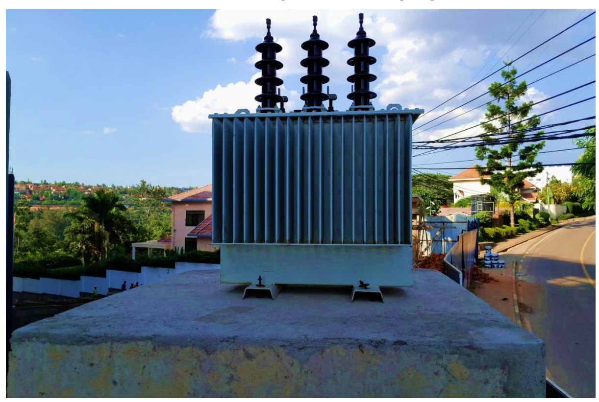
Phase 1 works showing: Installed transformer