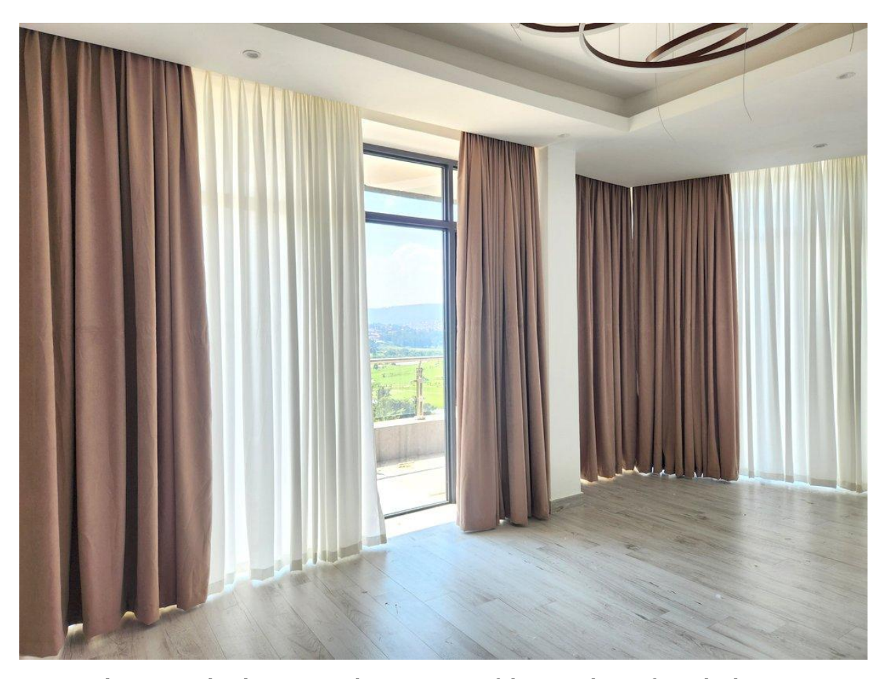
Phase 1 works showing: Bedroom in one of the units being furnished