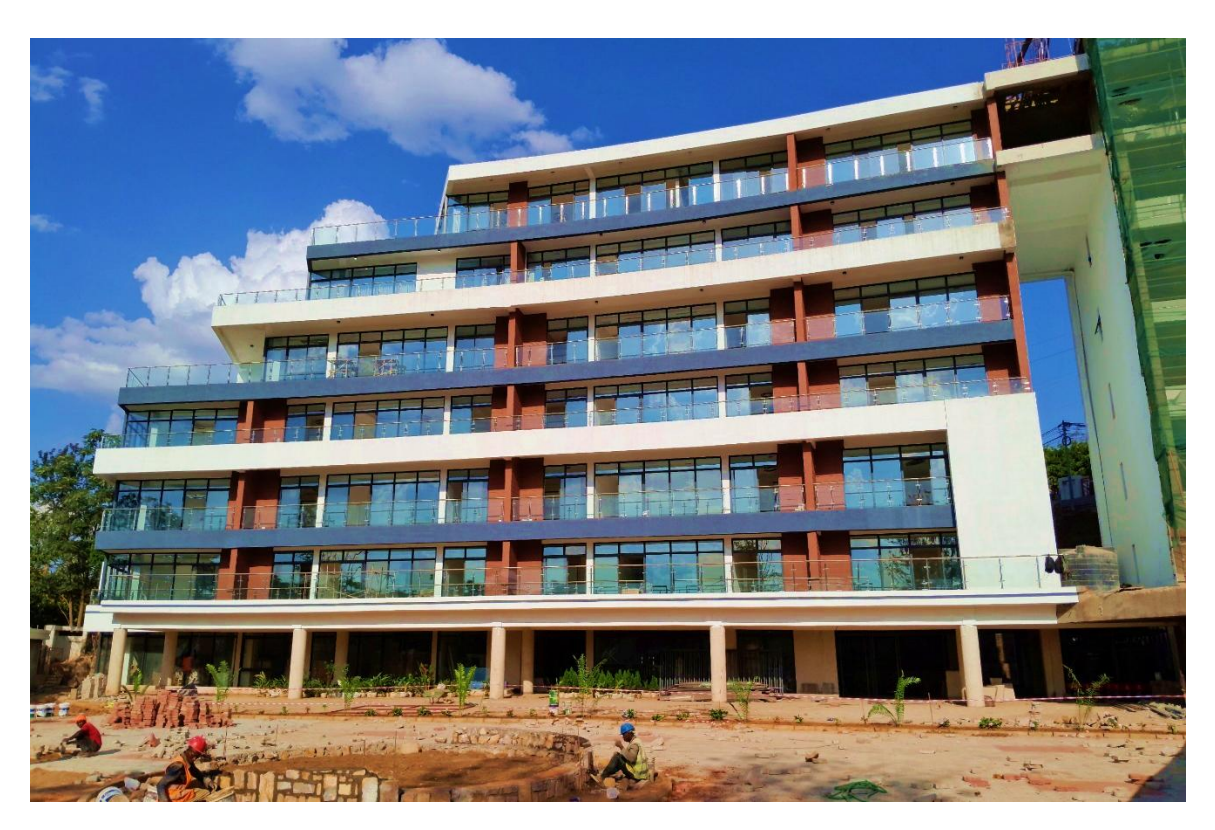
View of Phase 1