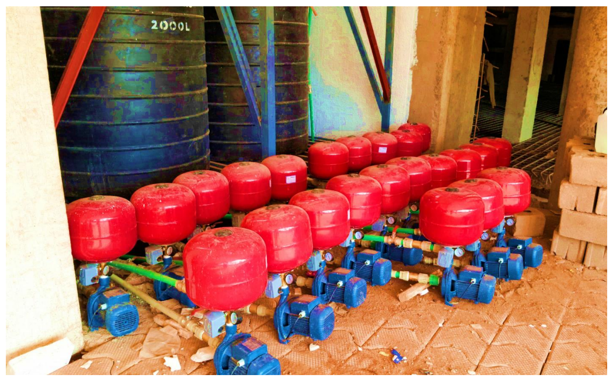
Phase 1 works showing: Installed water pumps