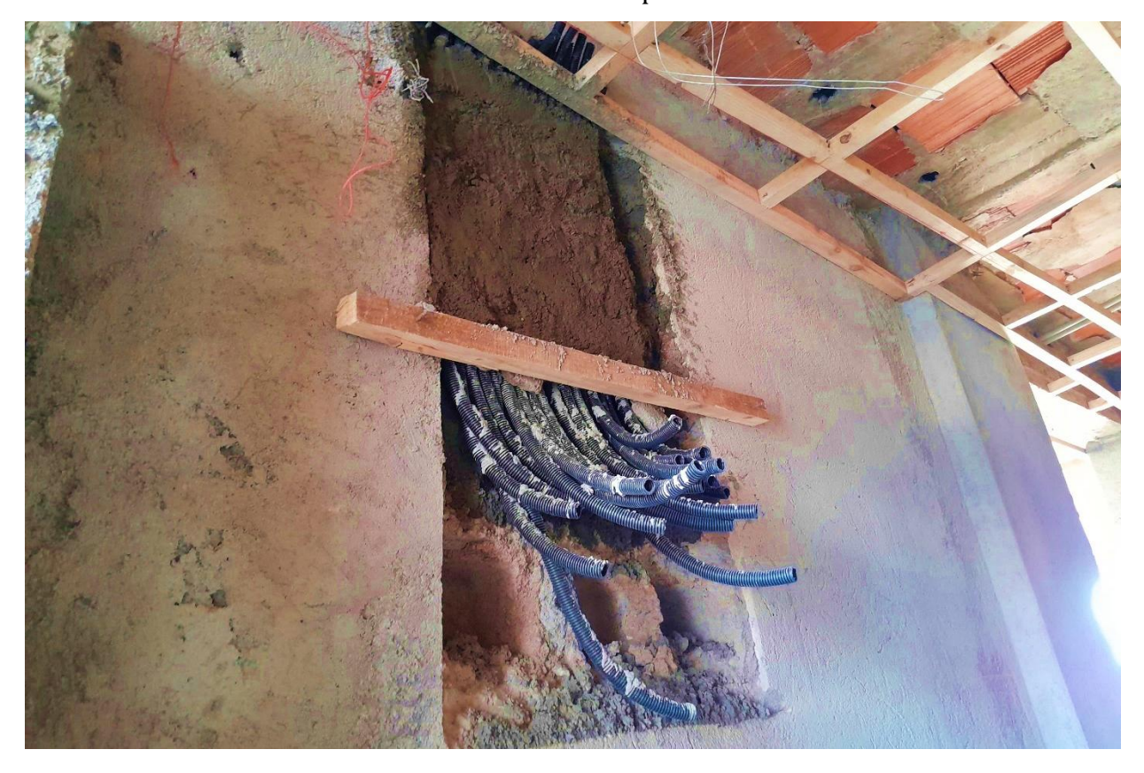
Phase 2 works showing: Internal electrical conduiting in one of the units