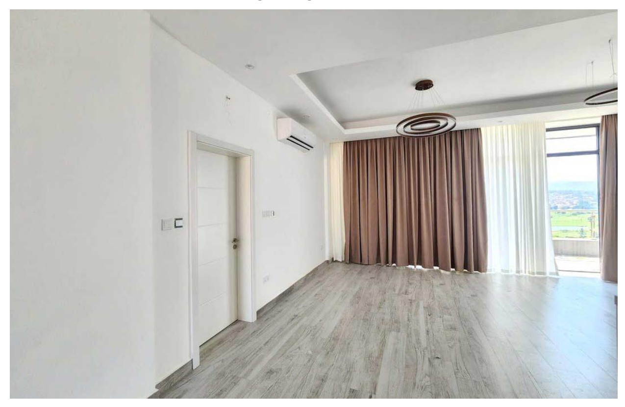
Phase 1 works showing: Living area in one of the units