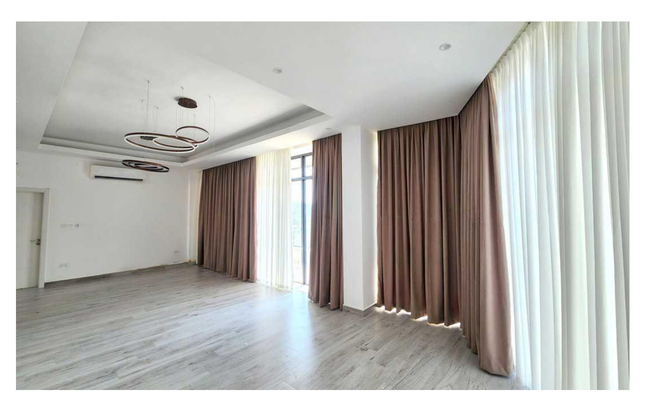
Phase 1 works showing: Living room in one of the units