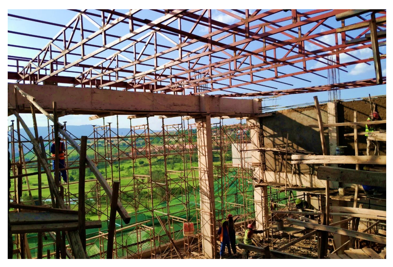
Phase 2 works showing: Roof truss installed in Lv. 2 of penthouse