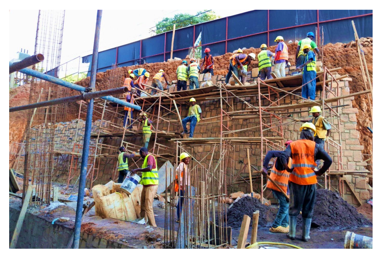
Phase 2 works showing: Masonry walling in Lv. 2 of retaining wall