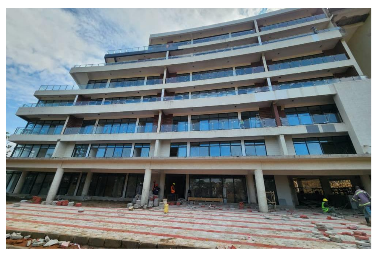
View of Phase 1, with paving and painting ongoing