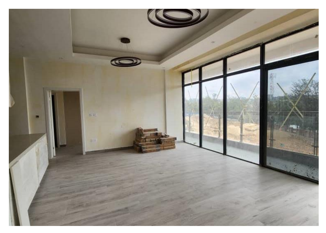
Phase 1 showing one of the units, ready for painting, power installed and working