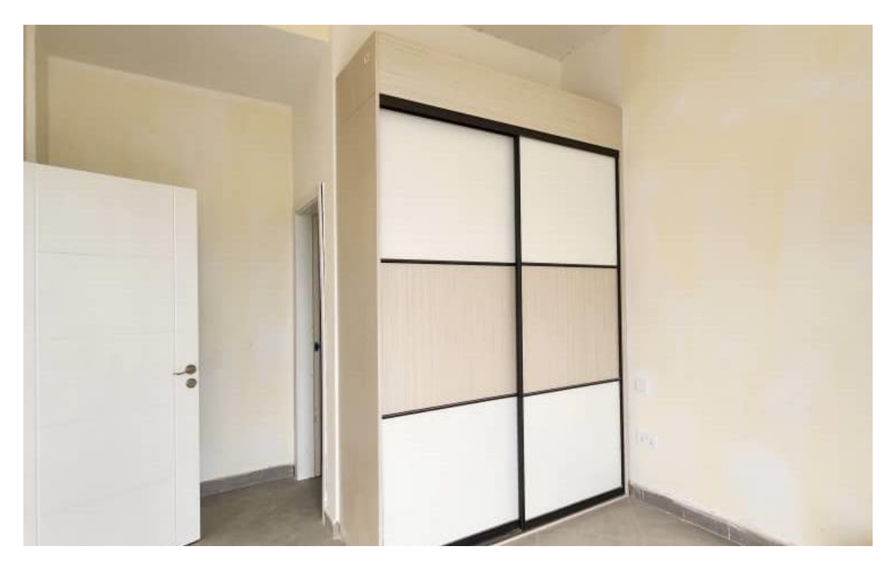
Phase 1 works showing: One of the bedrooms, with closets and doors