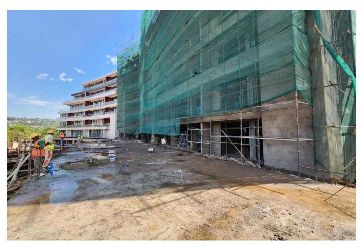
View of Phase 2 pool deck