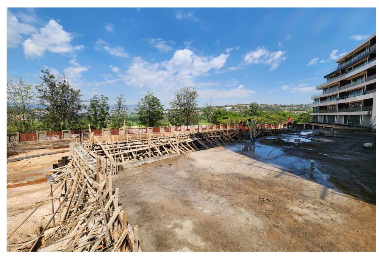
Phase 2 showing the pool deck and pool in the background