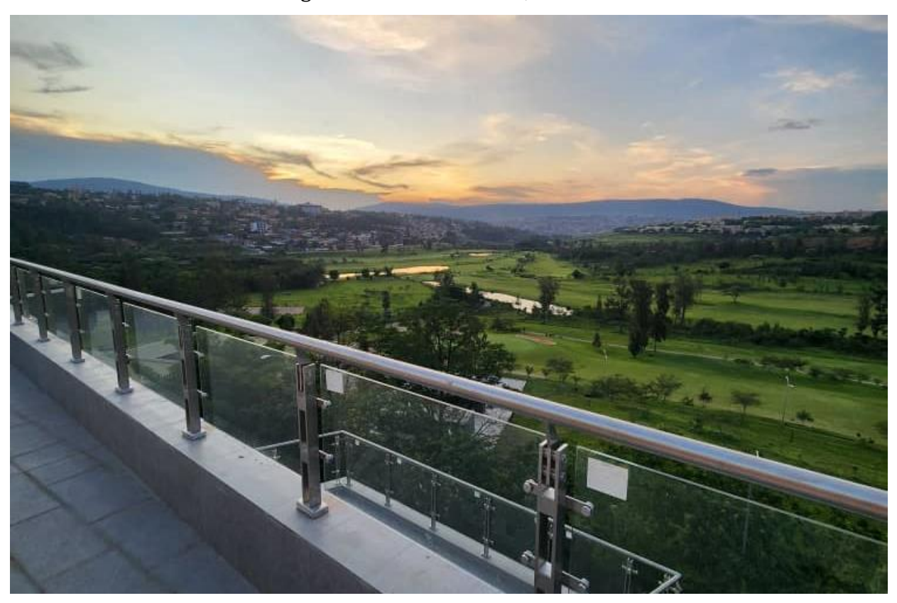
Views from one of the phase 1 balconies