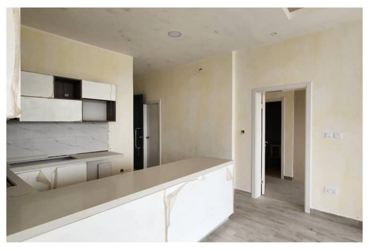
Phase 1, showing final painting works undercoat ongoing