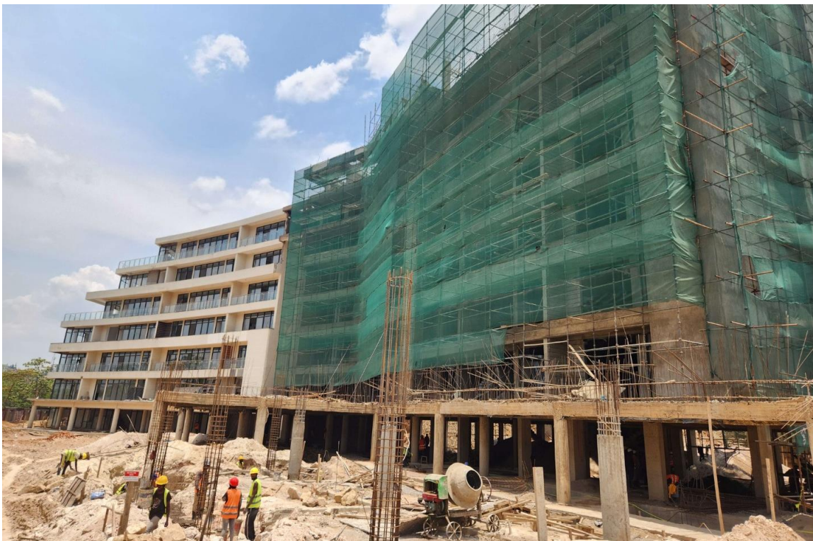
View of Phase 2