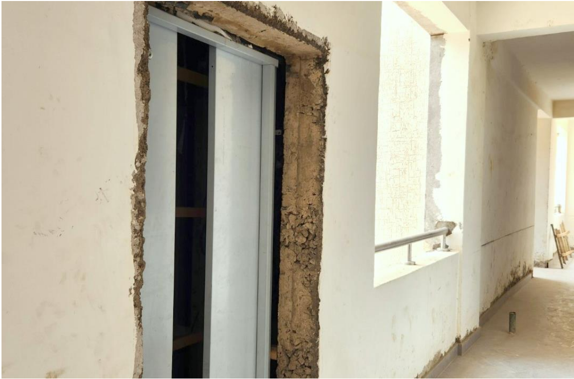
Elevator Installed, pending exterior finish for Phase 1