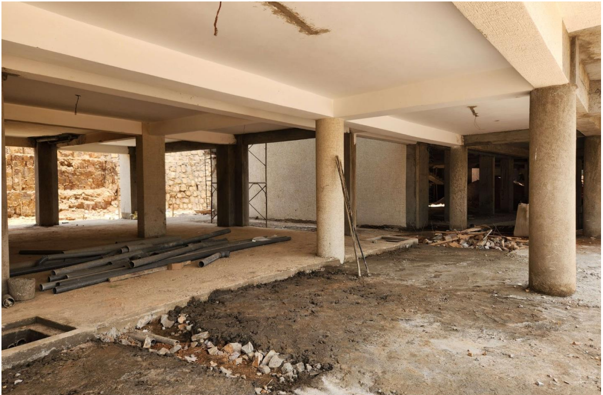
Basement Parking screeding and covering of water pipes