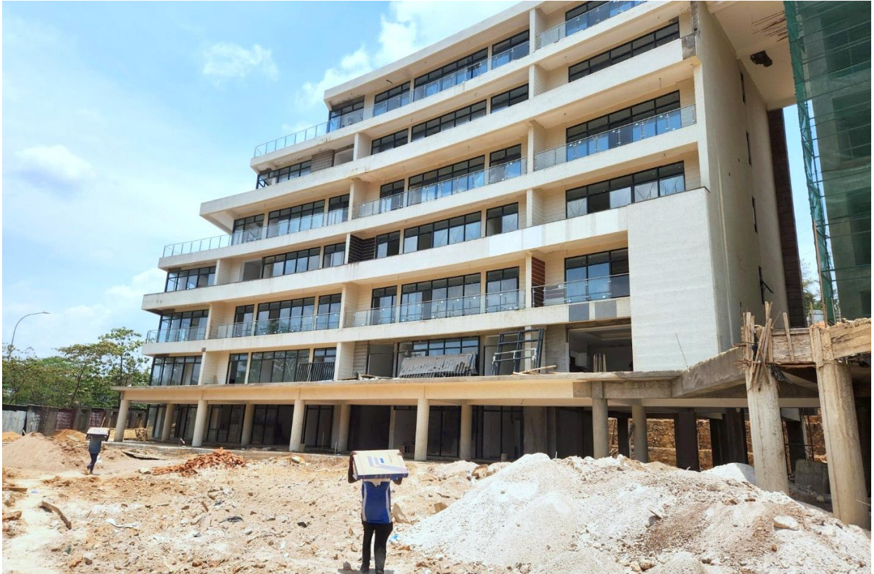
View of Phase 1