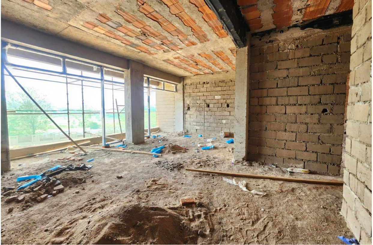
Phase 2 works, showing the curtain wall installation works ongoing