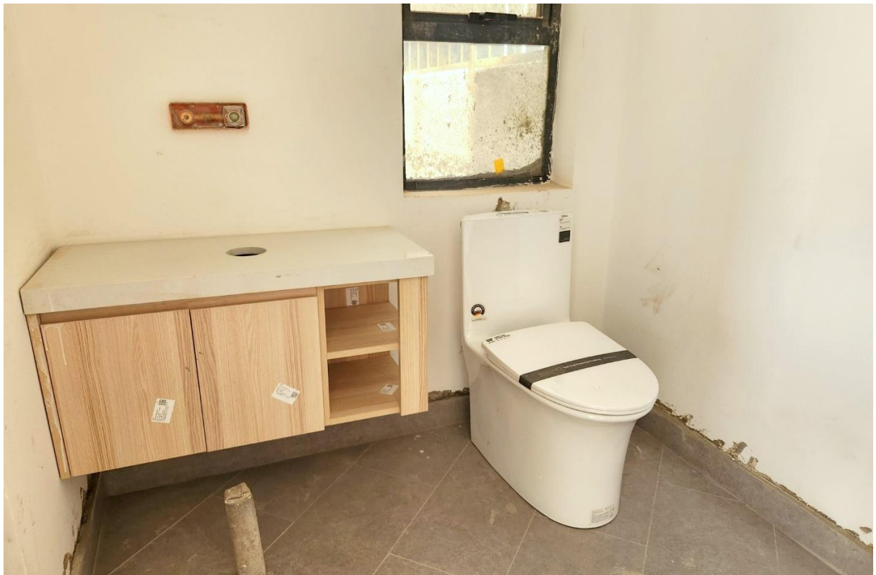
Phase 1 showing the guest toilet.