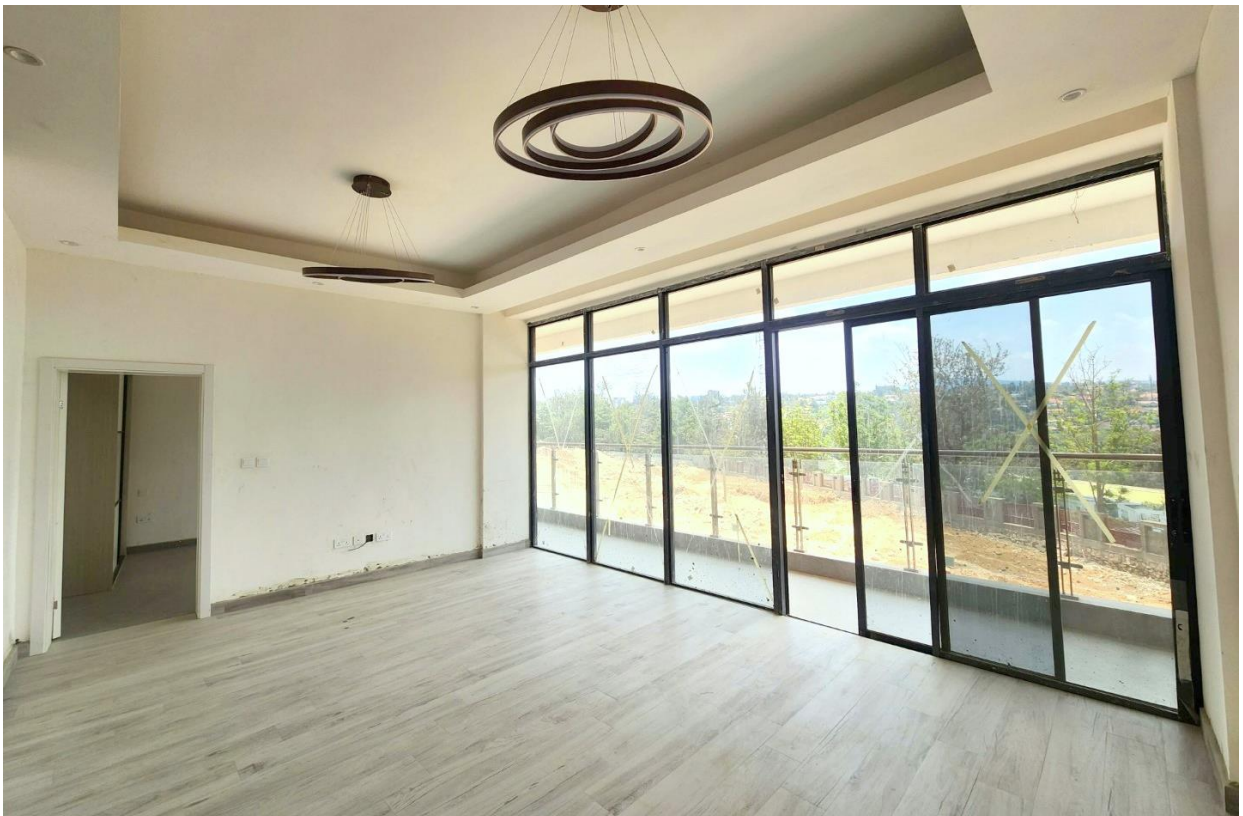
Living room with Lights installation ongoing.