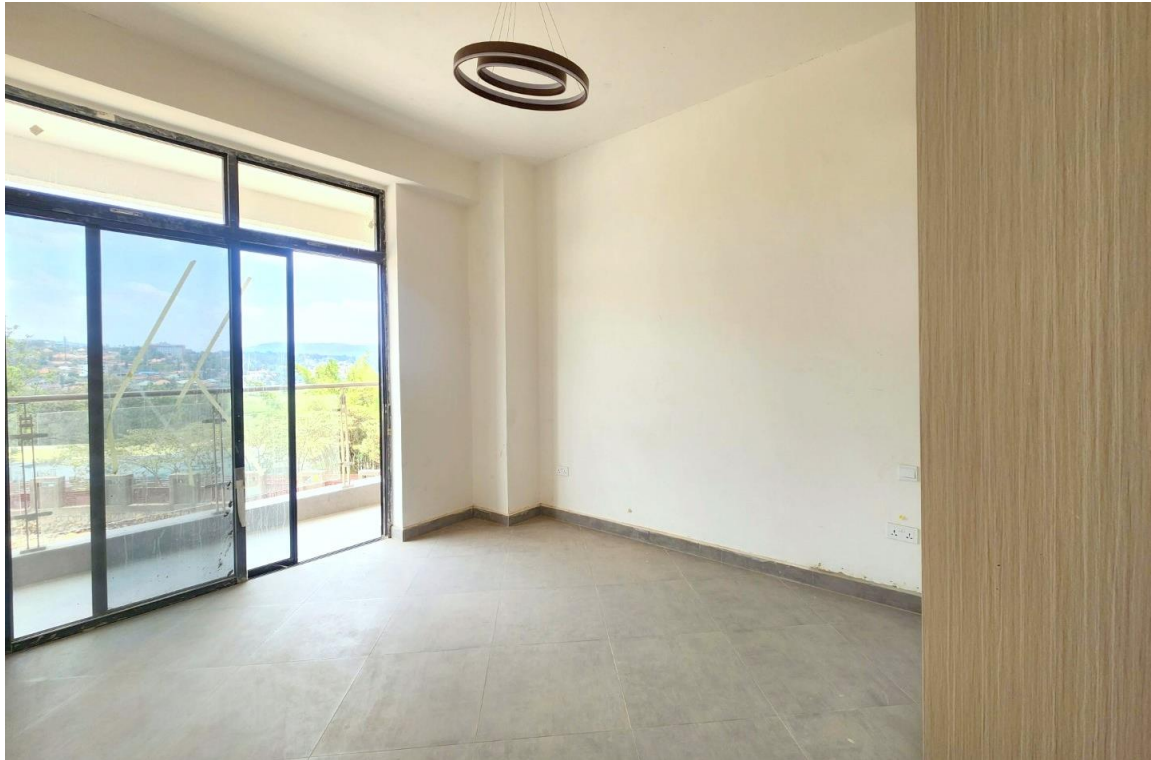
One of the bedrooms, with lights installed