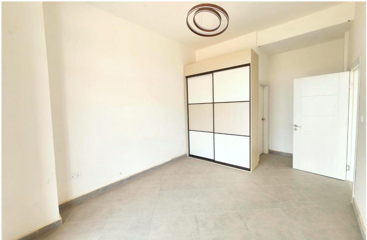
Phase 1 bedroom showing lights and wardrobes installed