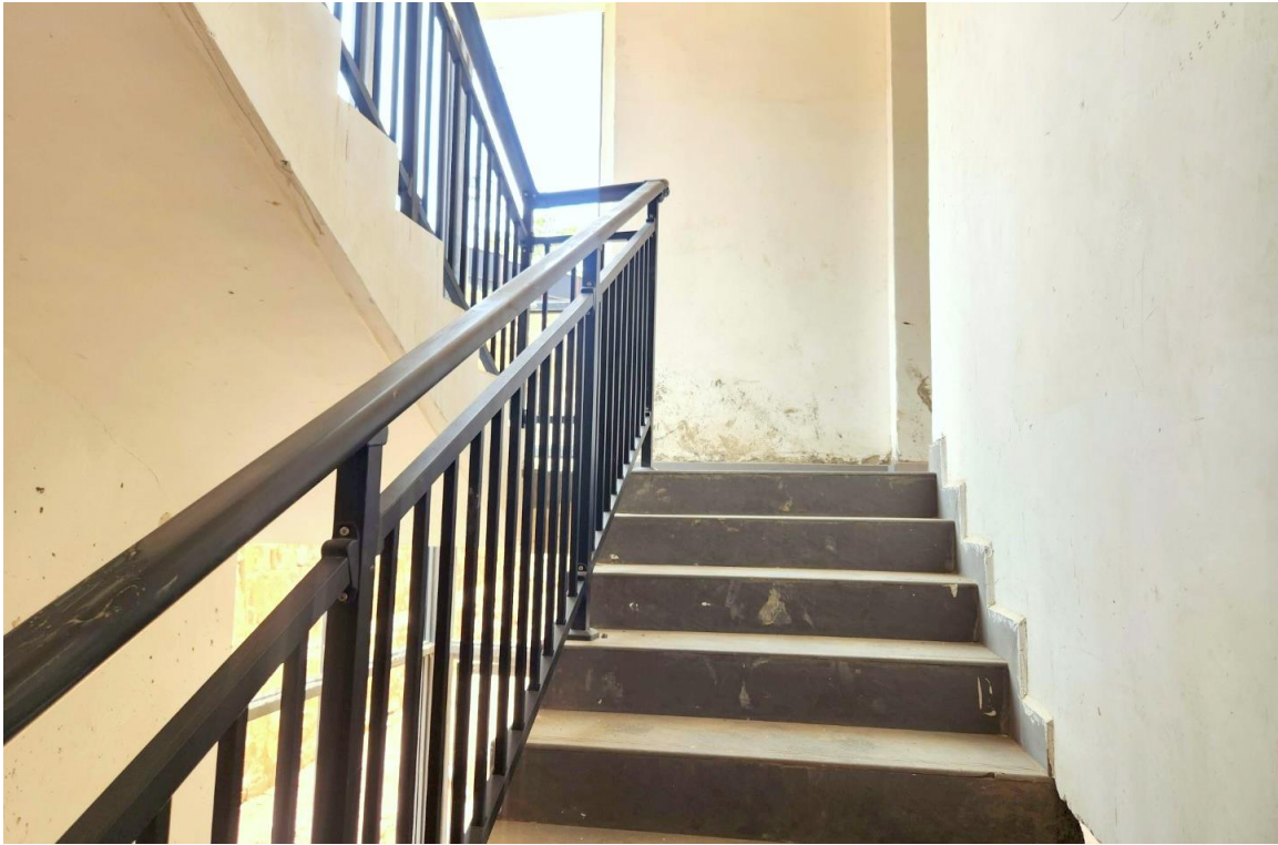
Staircase railing in Phase 1 in place