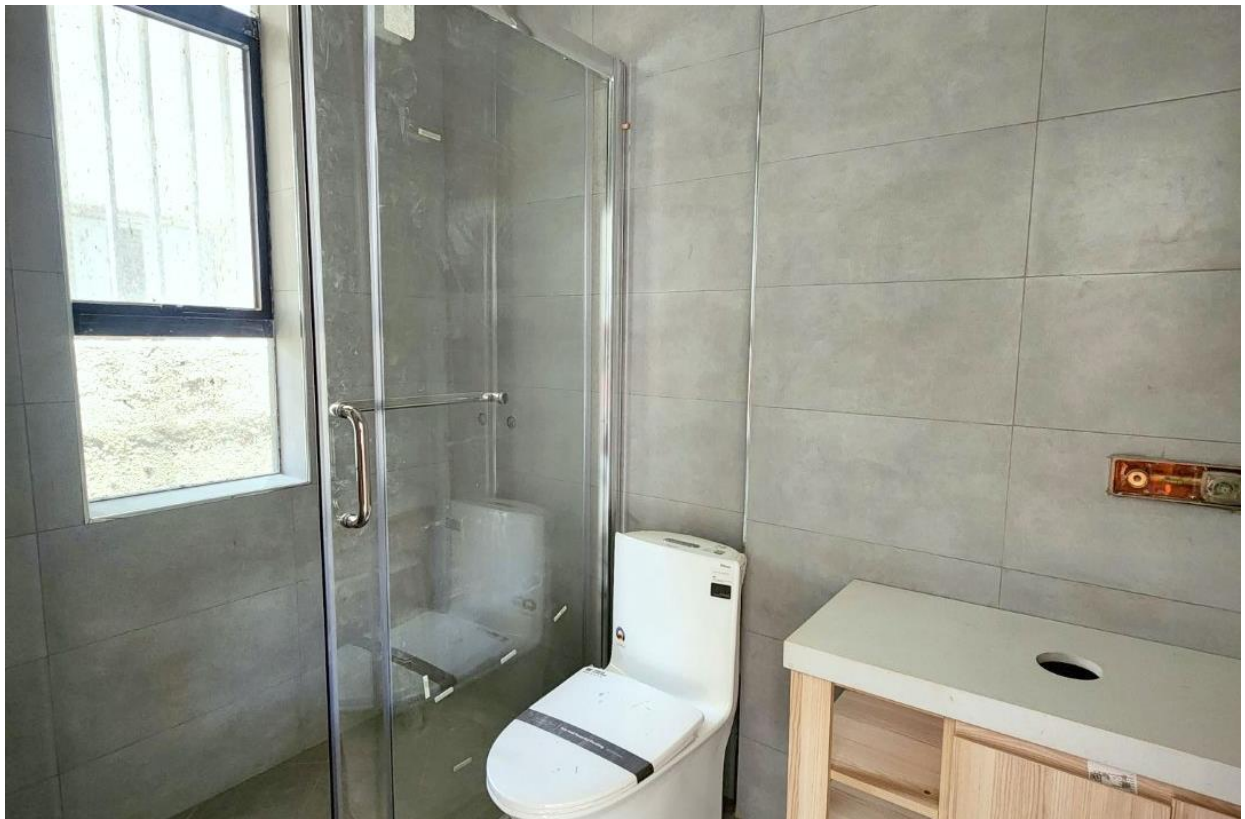
Shower glass and toilet in one of the bathrooms, Phase 1