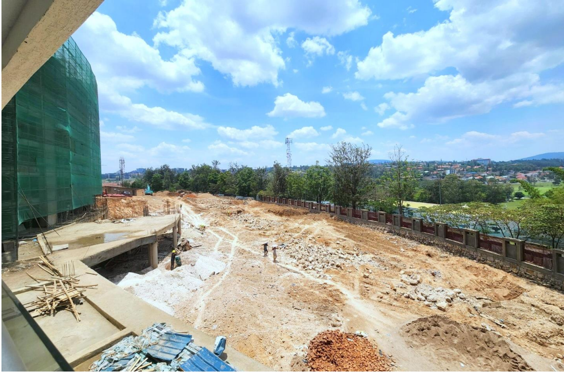
Townhouse villas demolished to increase the aesthetic appeal of the residences.