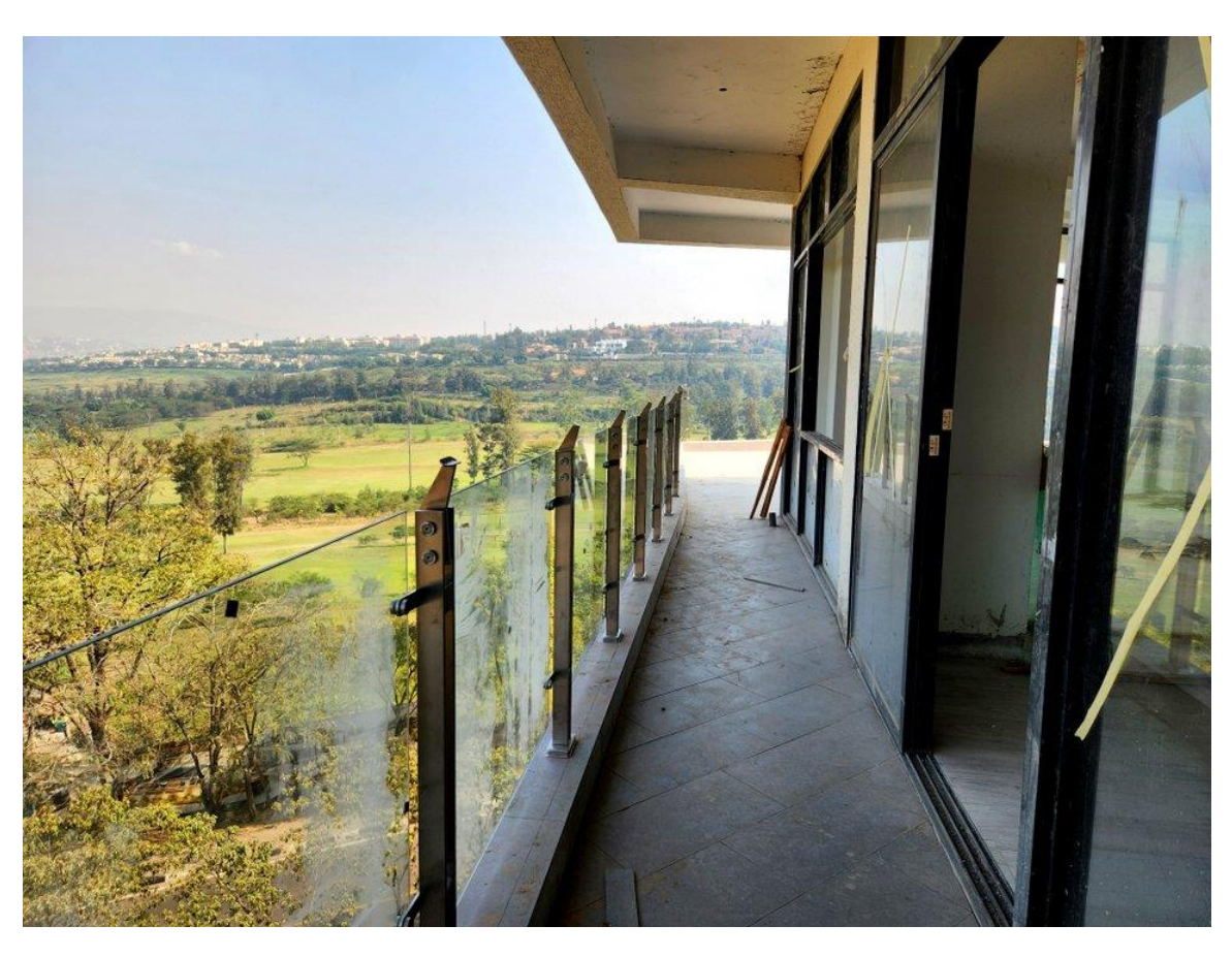
Glass balustrade installations ongoing