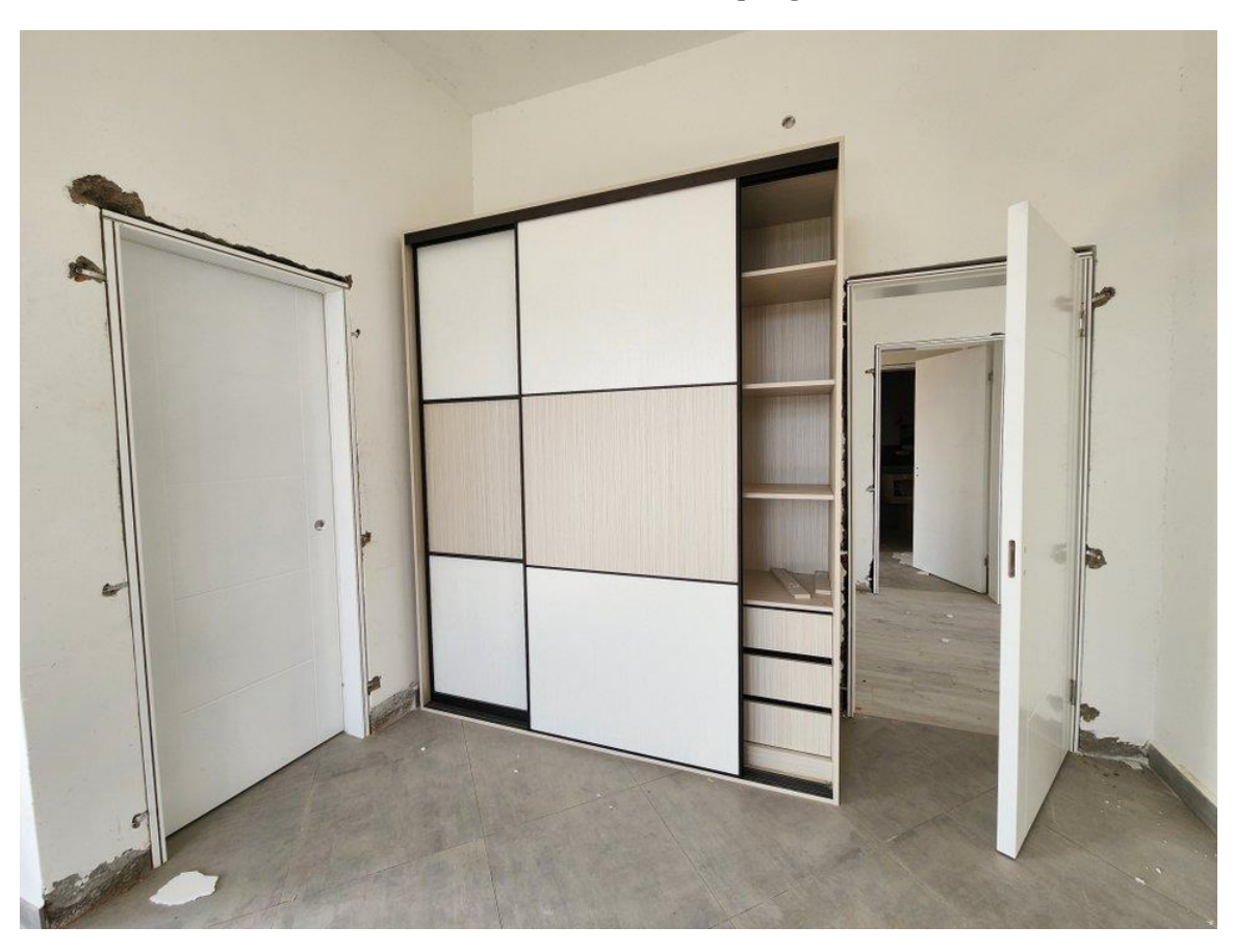
Bedrooms showing doors and wardrobes