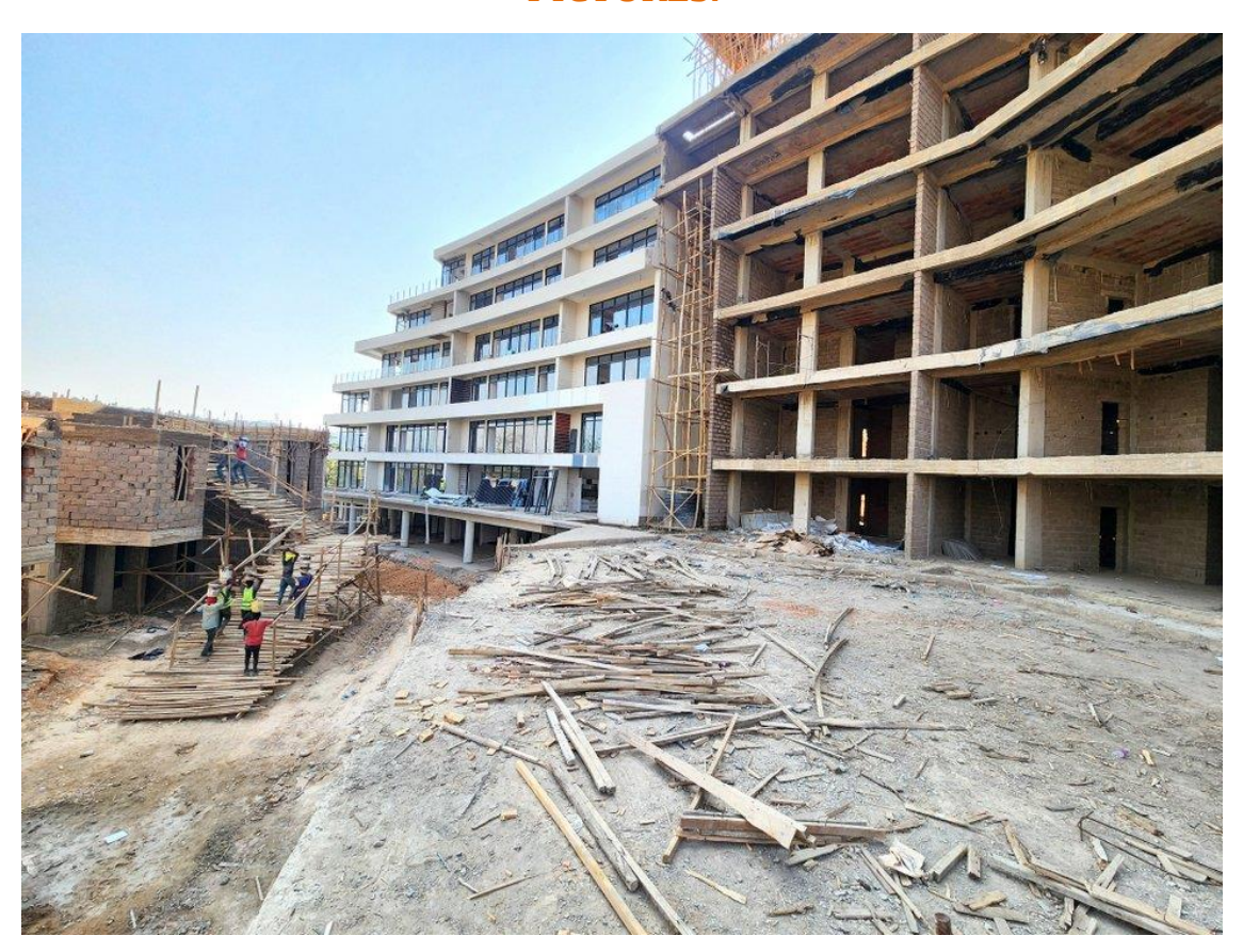
View of Phase 1 from the front terrace