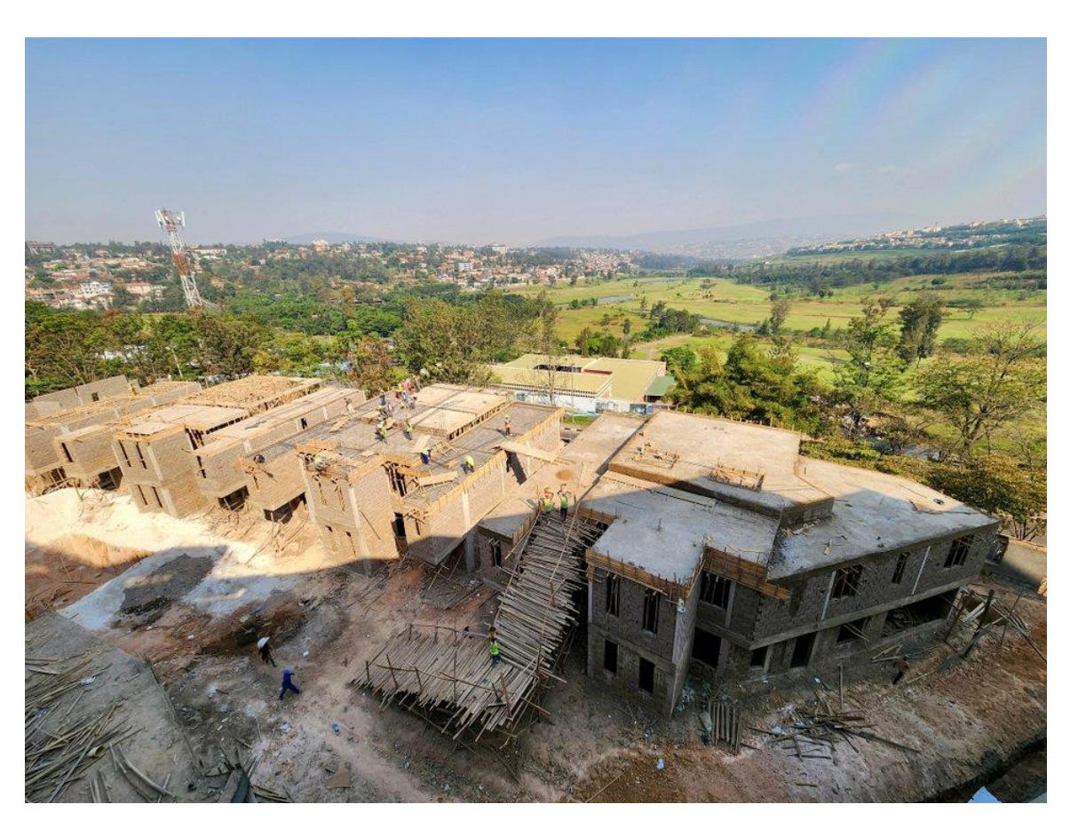
Townhouse construction progress