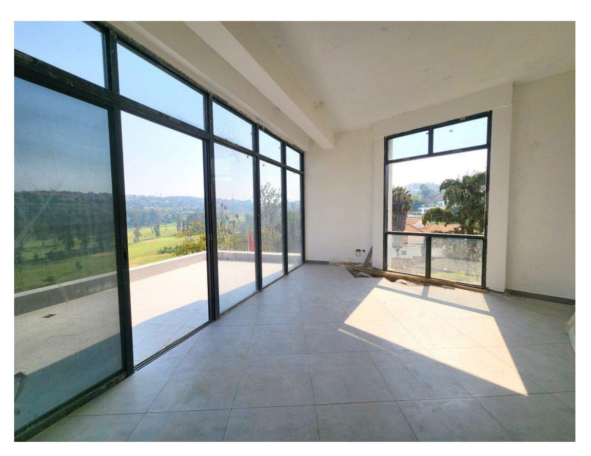
One of the living rooms