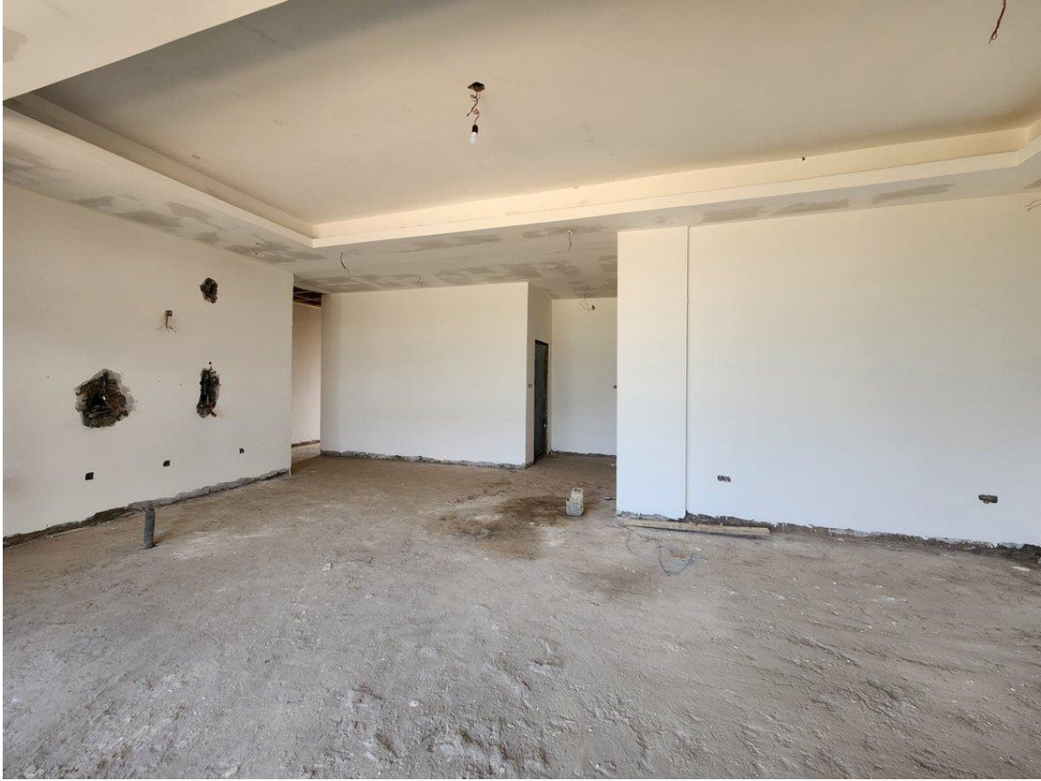
Above: Living room and kitchen in one of the apartments, Below: Open Kitchen