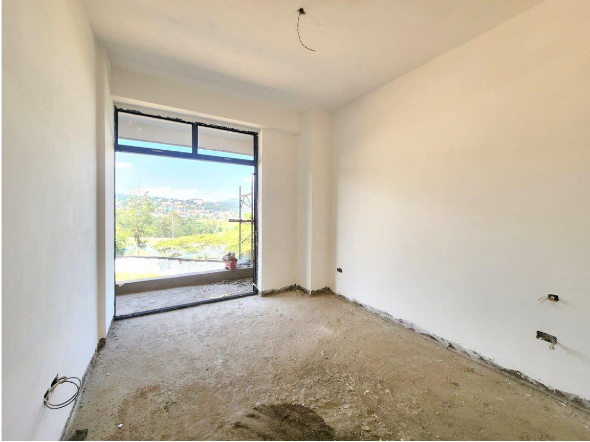
Above: Bedroom with golf views, Below: Living area