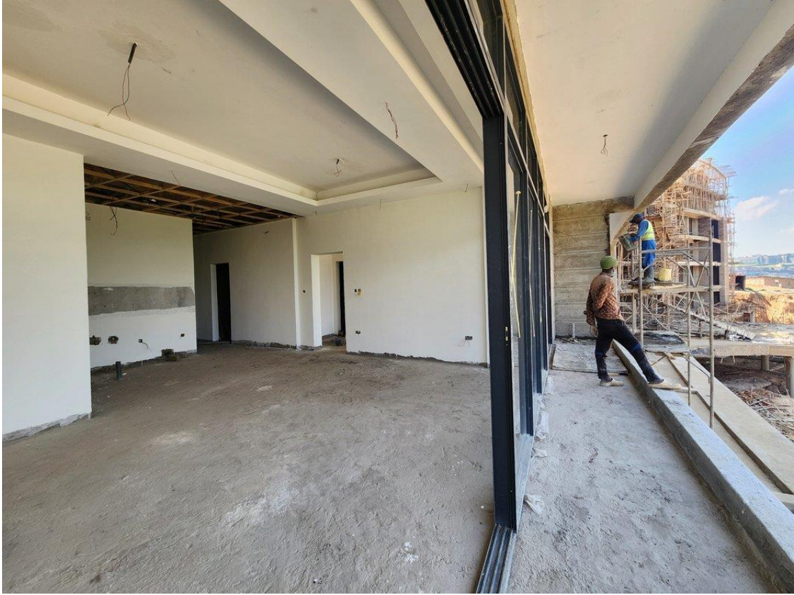
Above: Open plan showing balcony, Below: Phase 2 progress