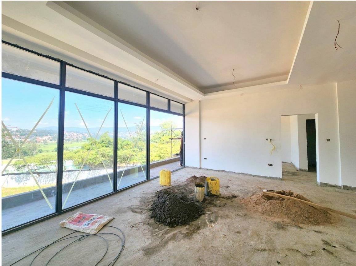
Above: Living room in one of the apartments, Below: Bedroom