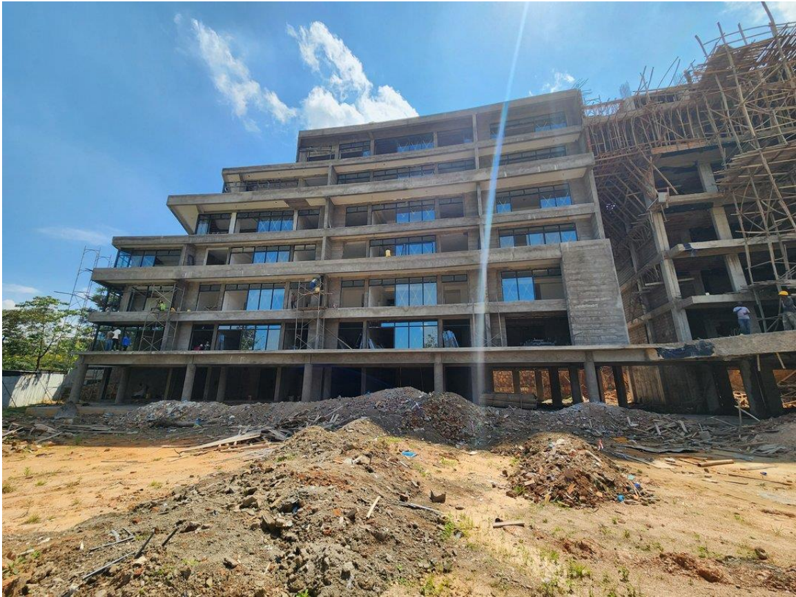
View of Phase 1 from the front