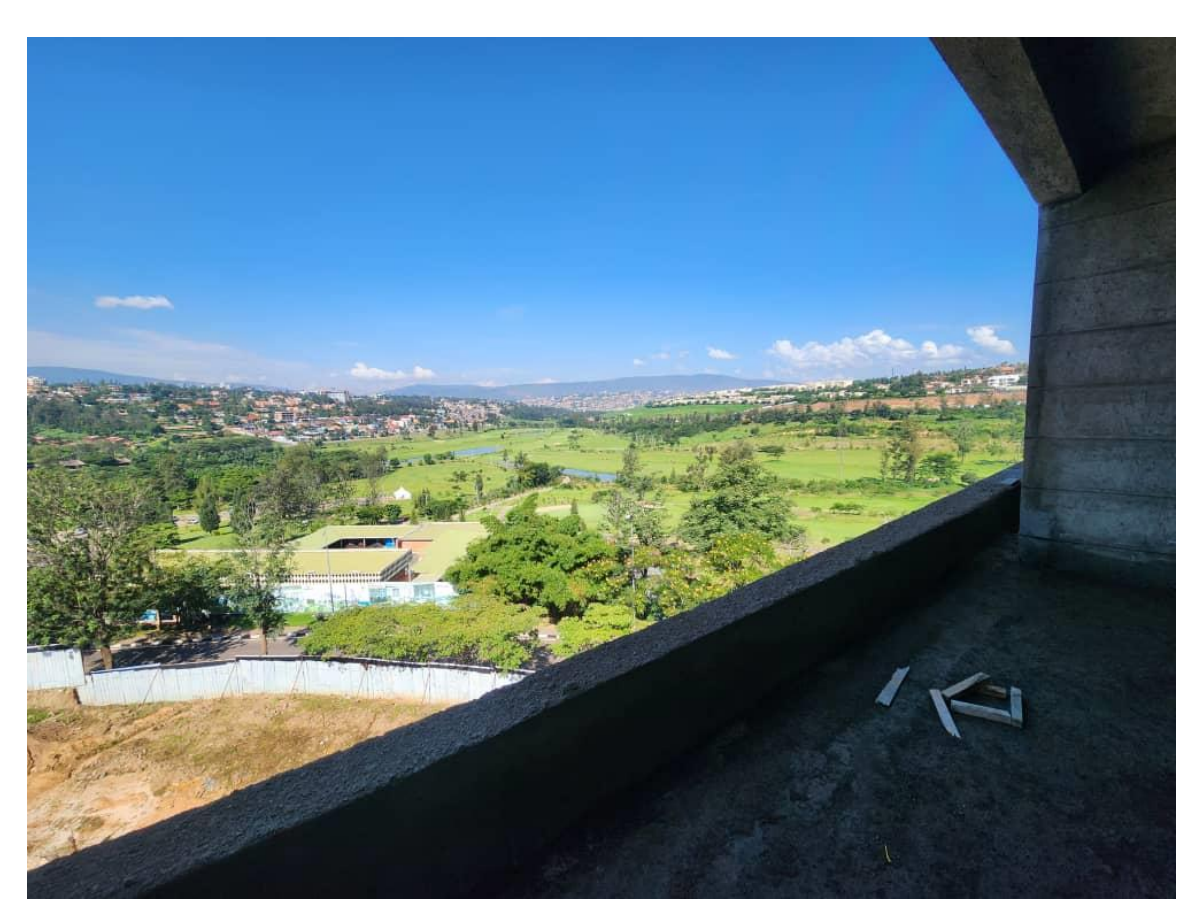
View from one of the apartments on the 3^{\text{rd}} floor, Phase 1\,