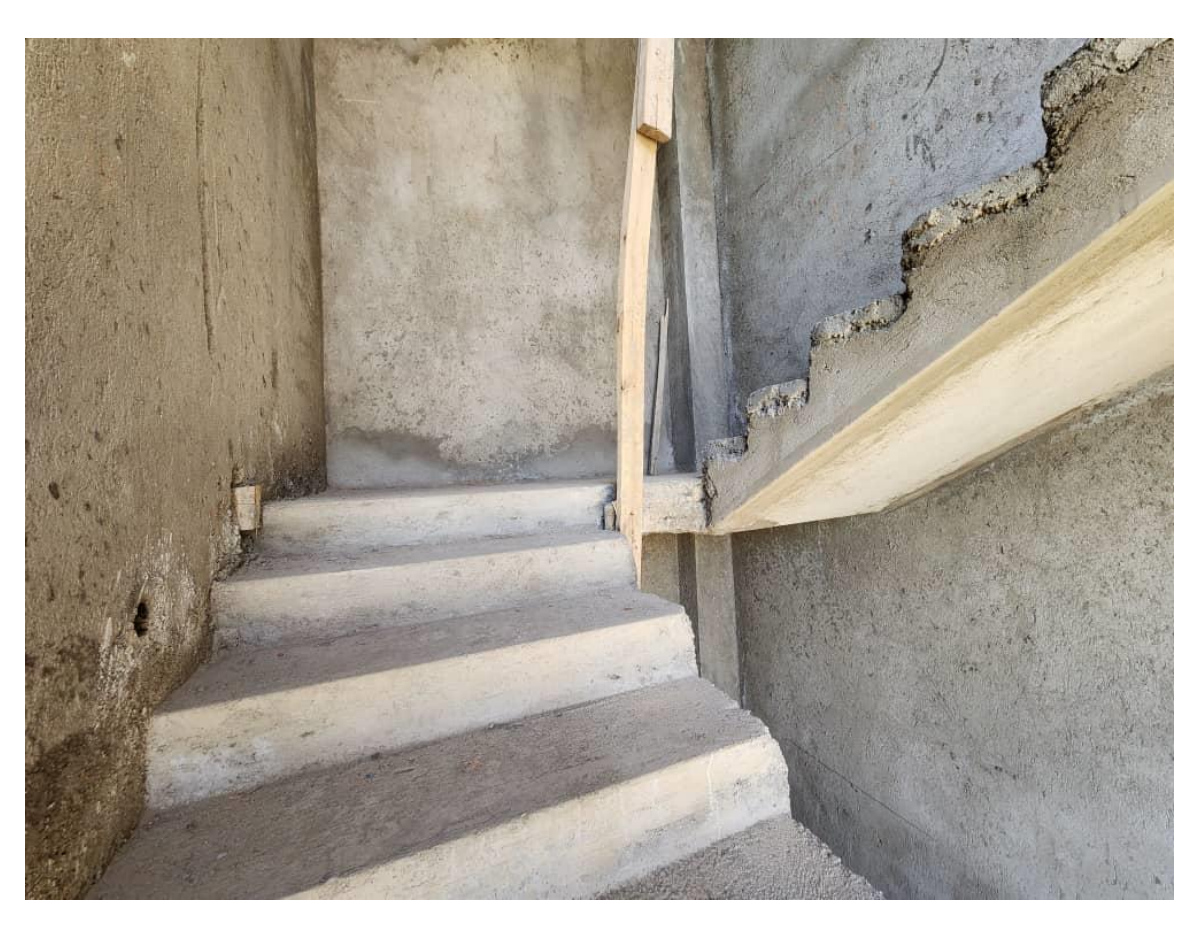
Staircase Phase 1