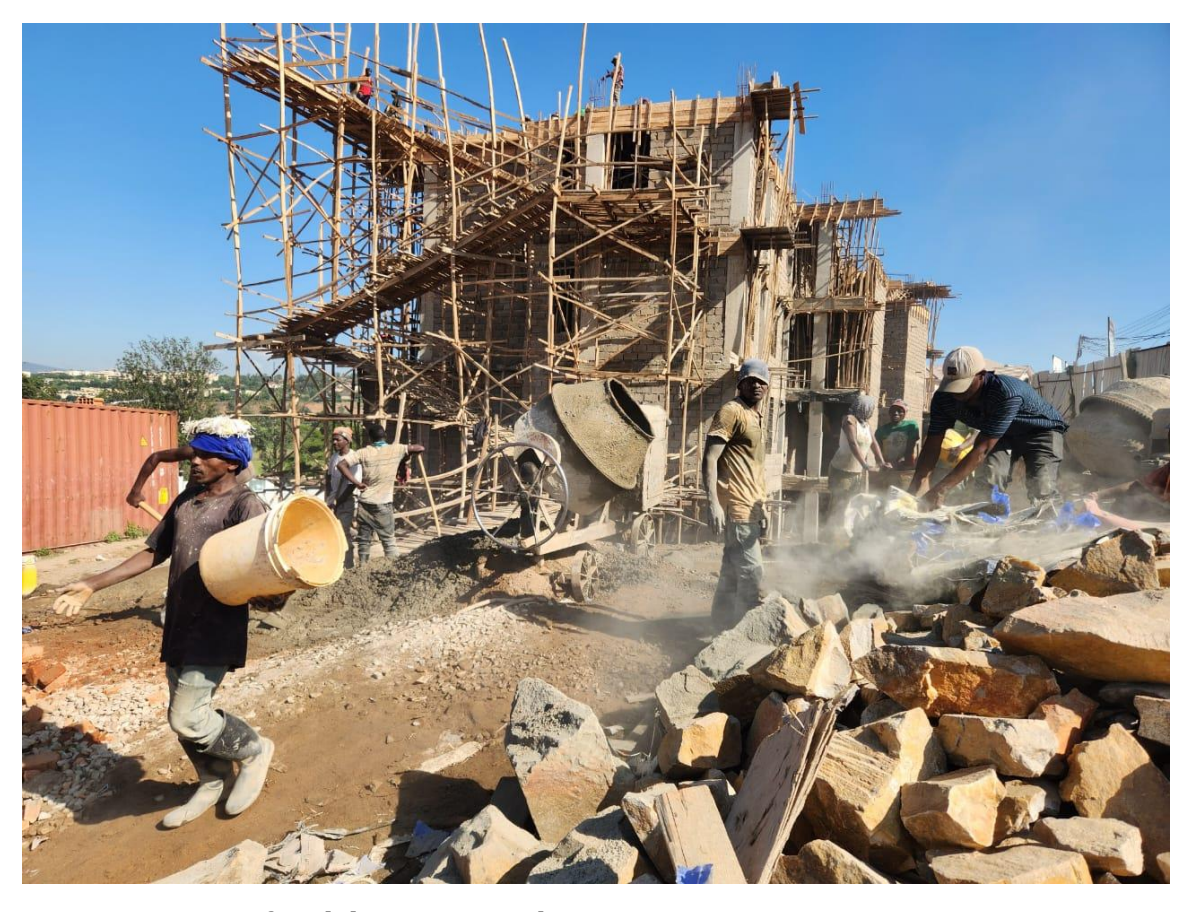
Mixing Concrete for slab casting at Phase 2