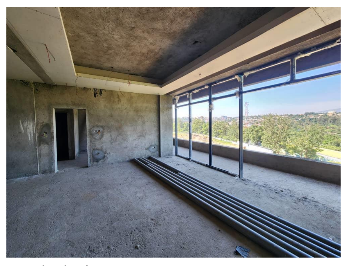
Gypsum board works on going