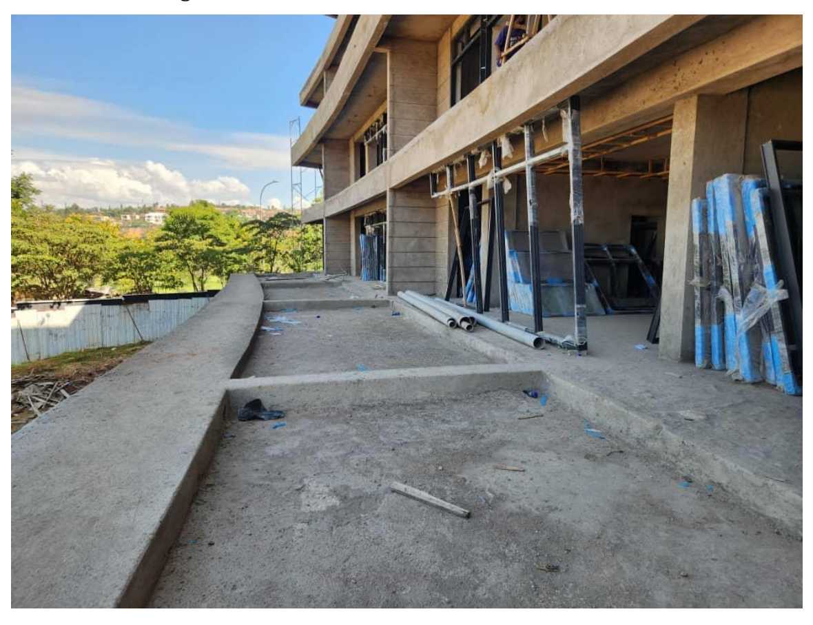
Private spaces for the terraced apartments above the parking lot.