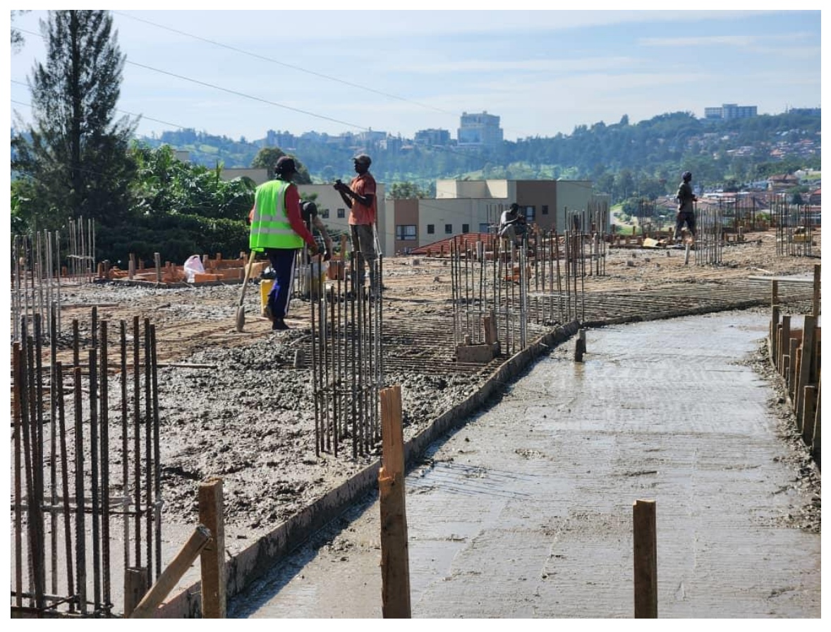
4th Floor, Phase 2 slab casting