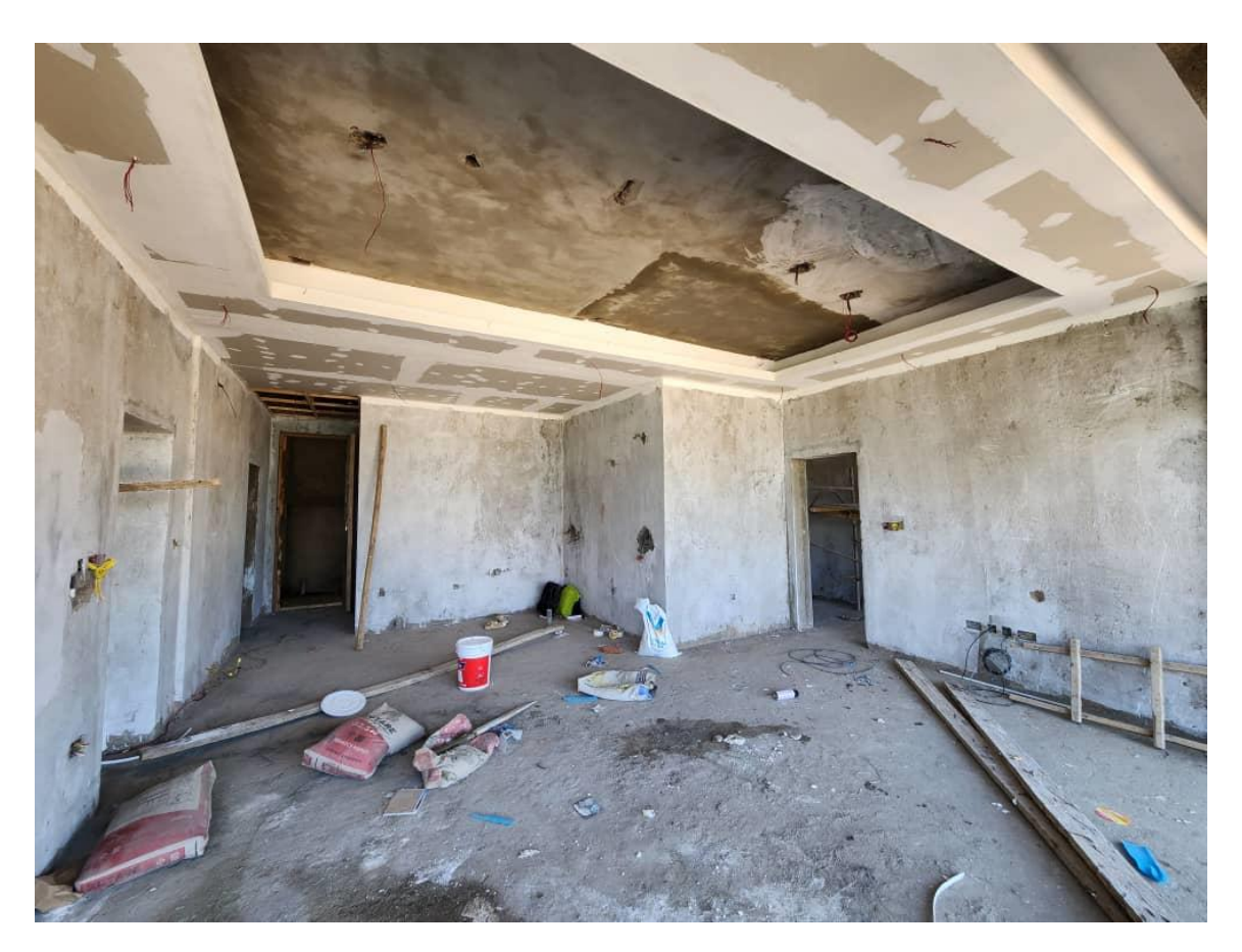
Phase 1 gypsum works and initial painting