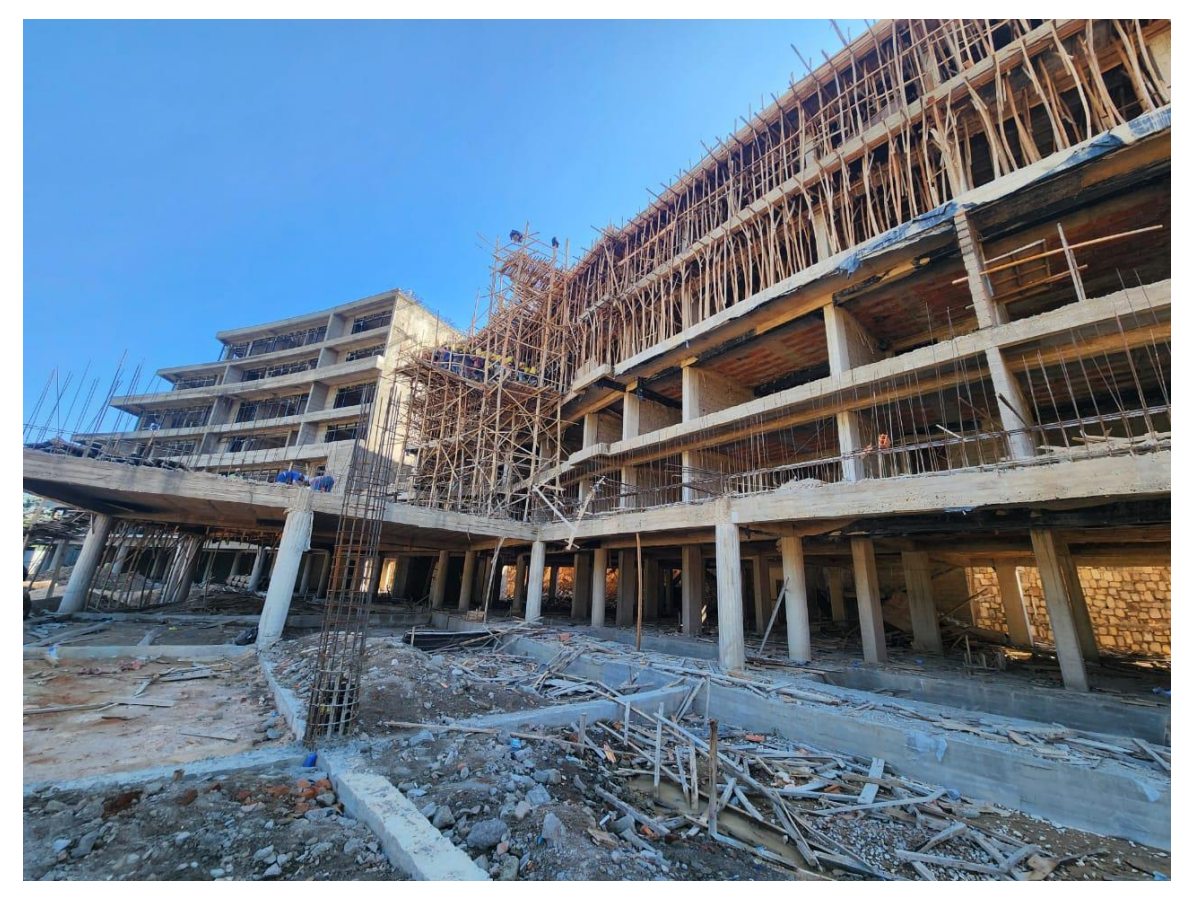
View of Phase 2 and Phase 1 from the front