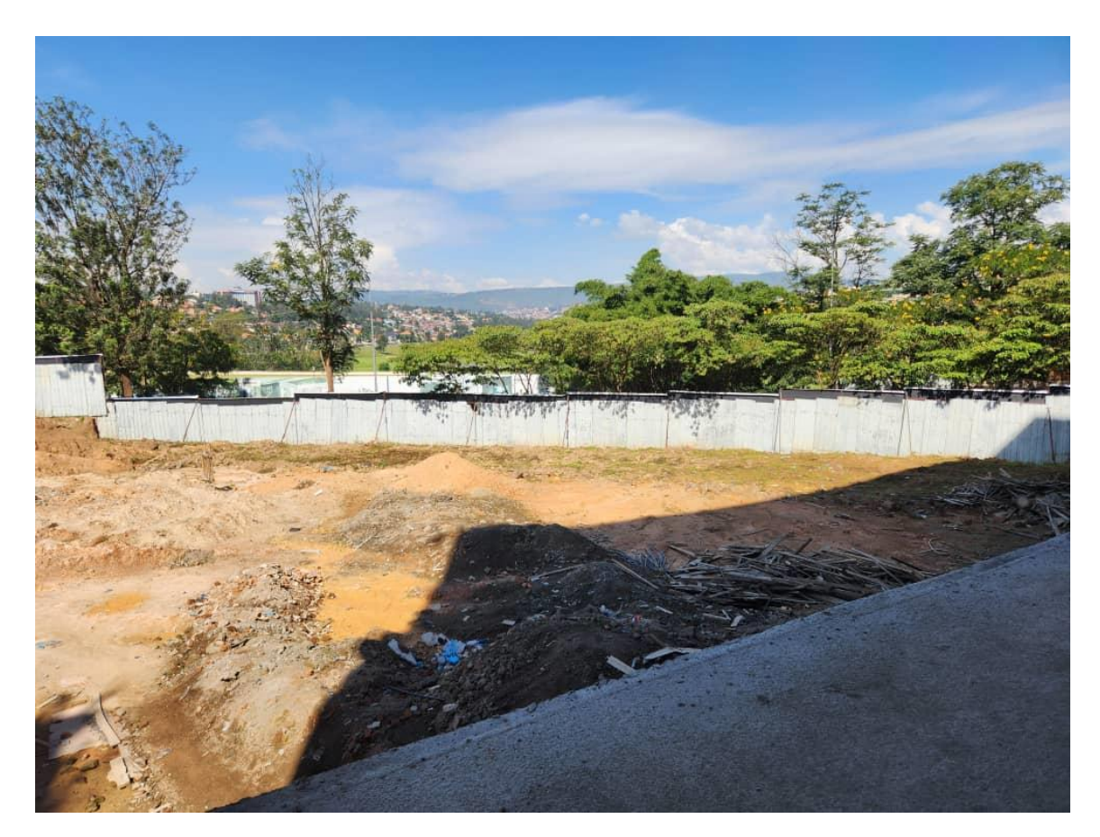
View from the terraces, Phase \boldsymbol{1}