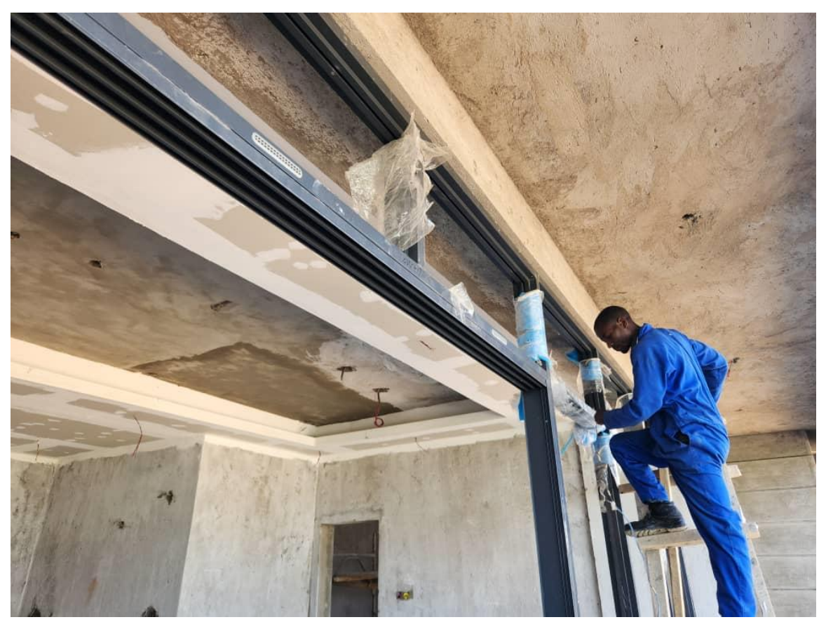
Curtain wall installation progressing well at Phase {\bf 1}