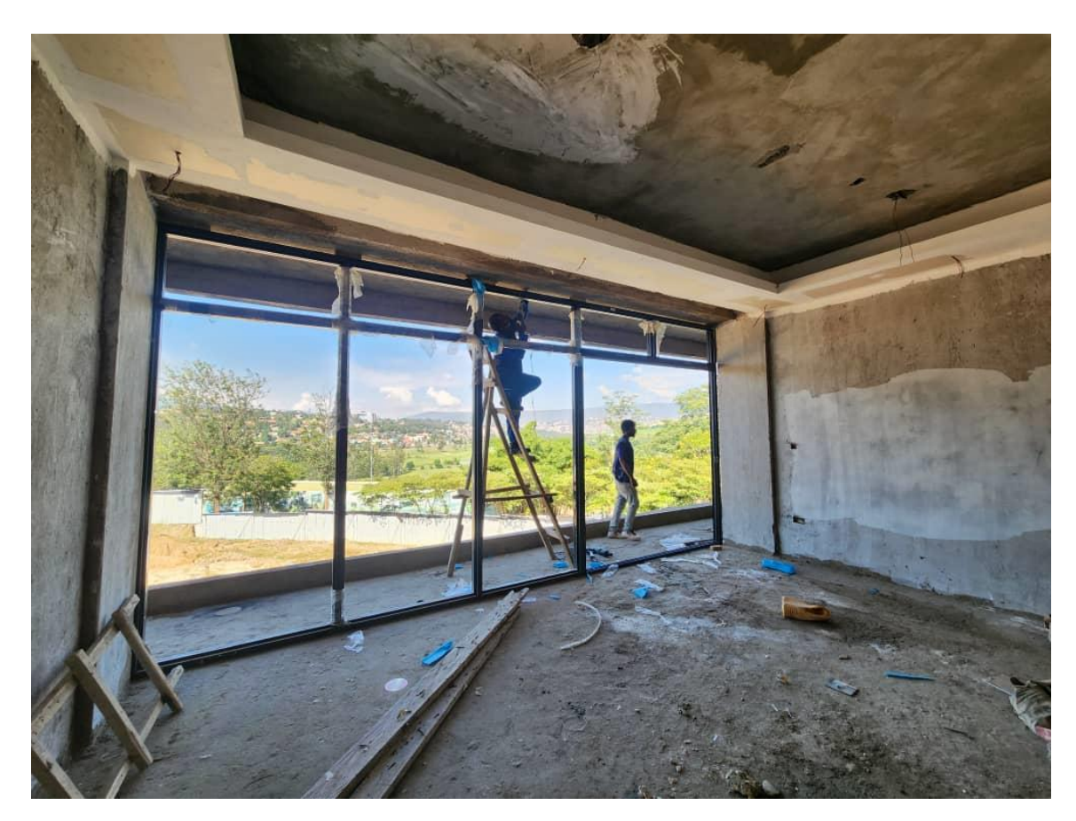
Curtain wall fixing and installation.