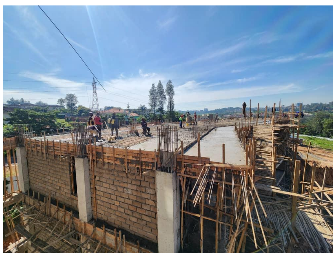
Phase 2 progress as seen from Phase 1 \,