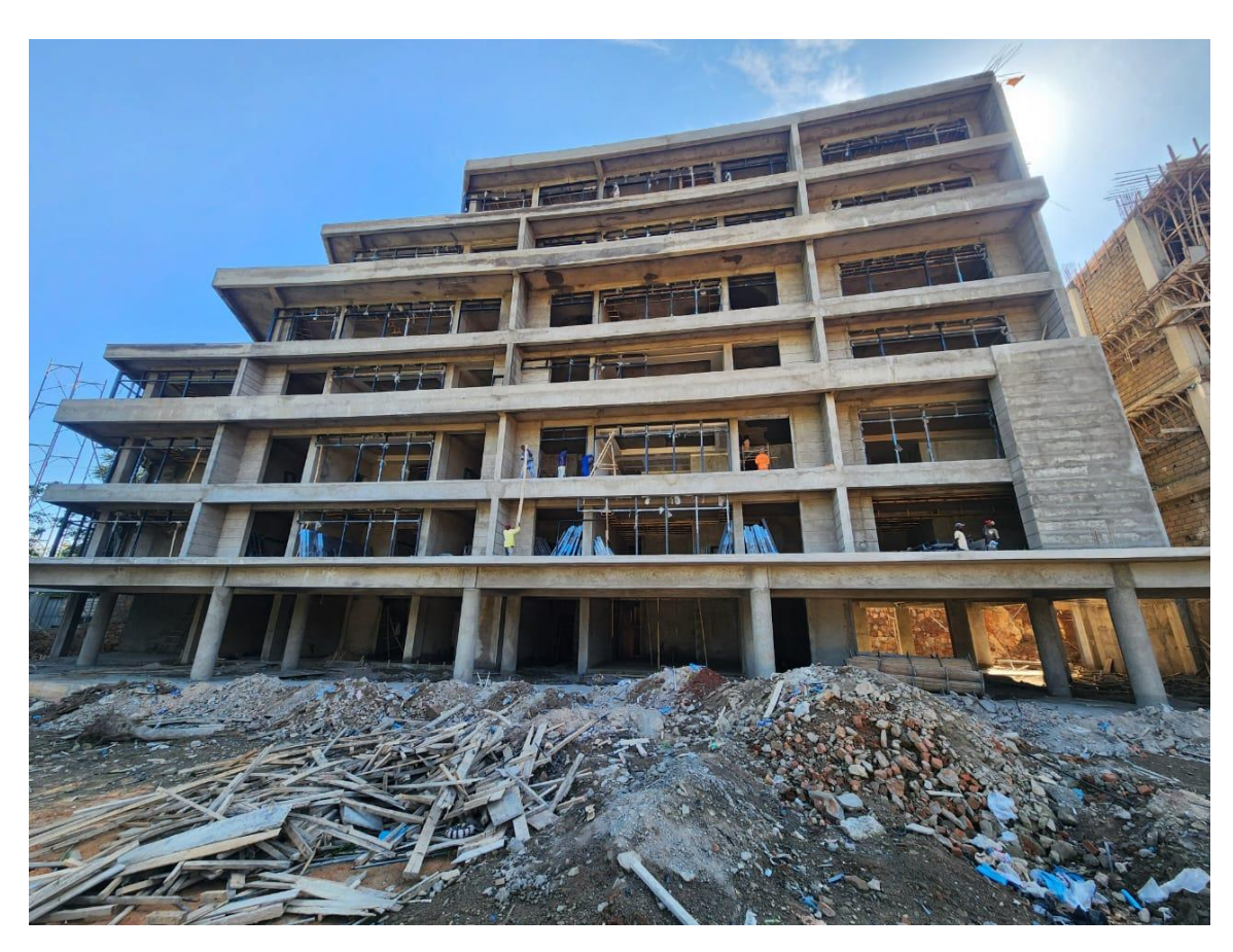
Front View of Phase 1