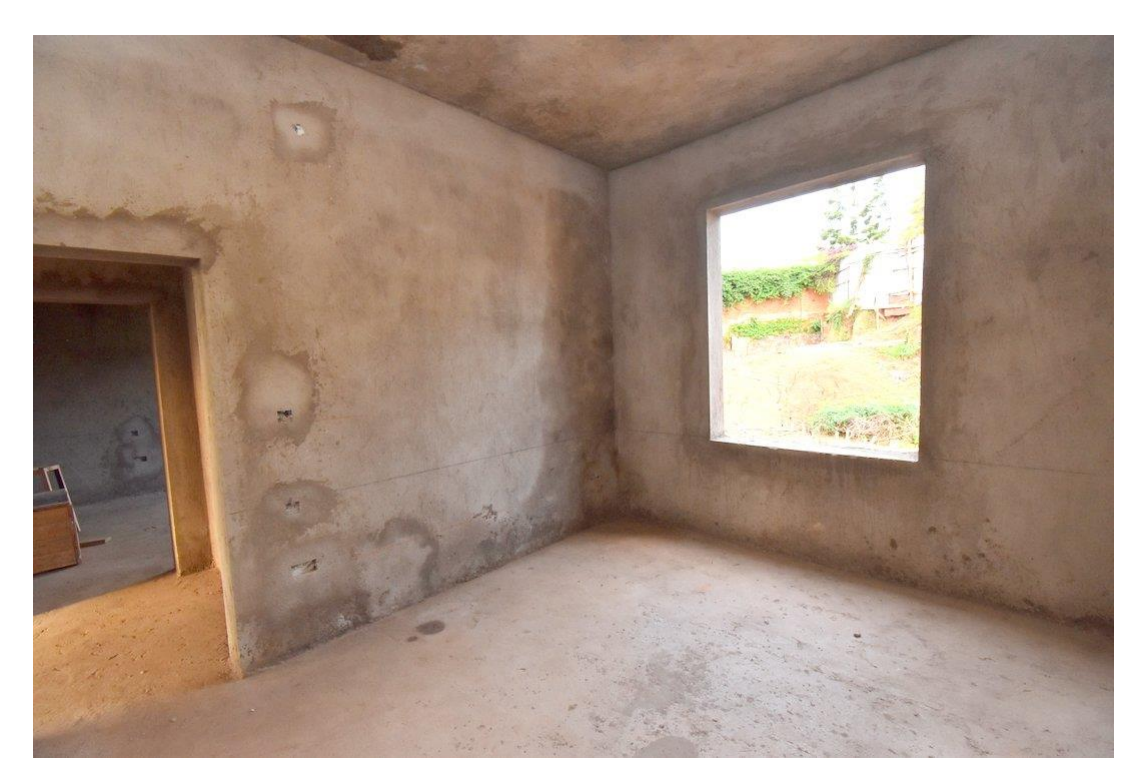
One of the bedrooms