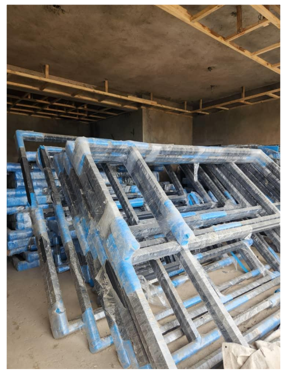
Aluminium doors windows at site