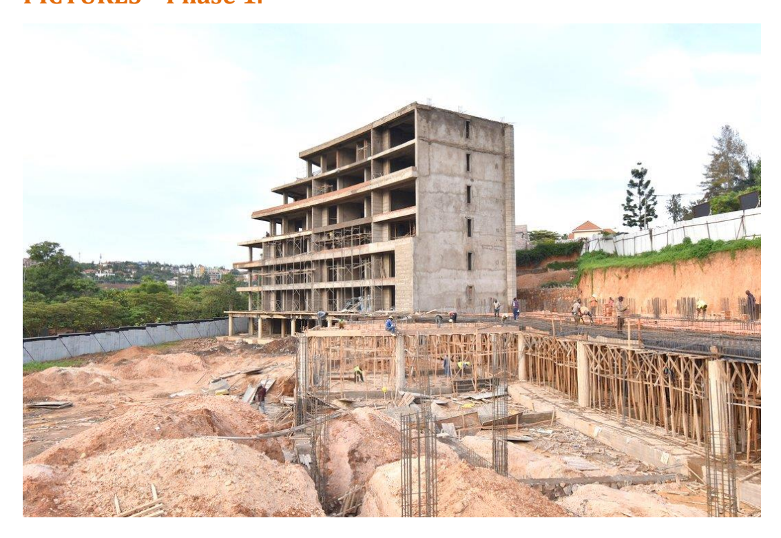
View from the phase 2