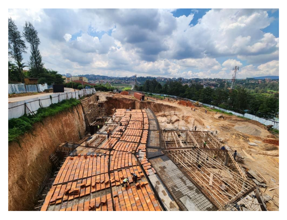
View from of the Phase 2 block from Phase 1