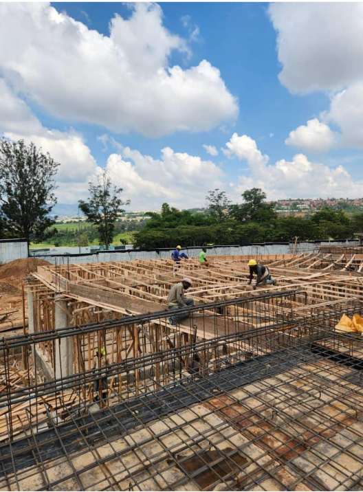
Phase 2 terraces works