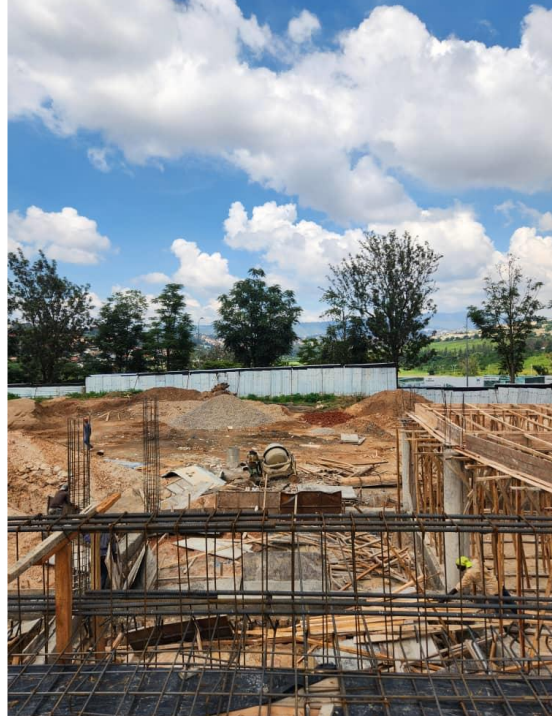
The max pans set out