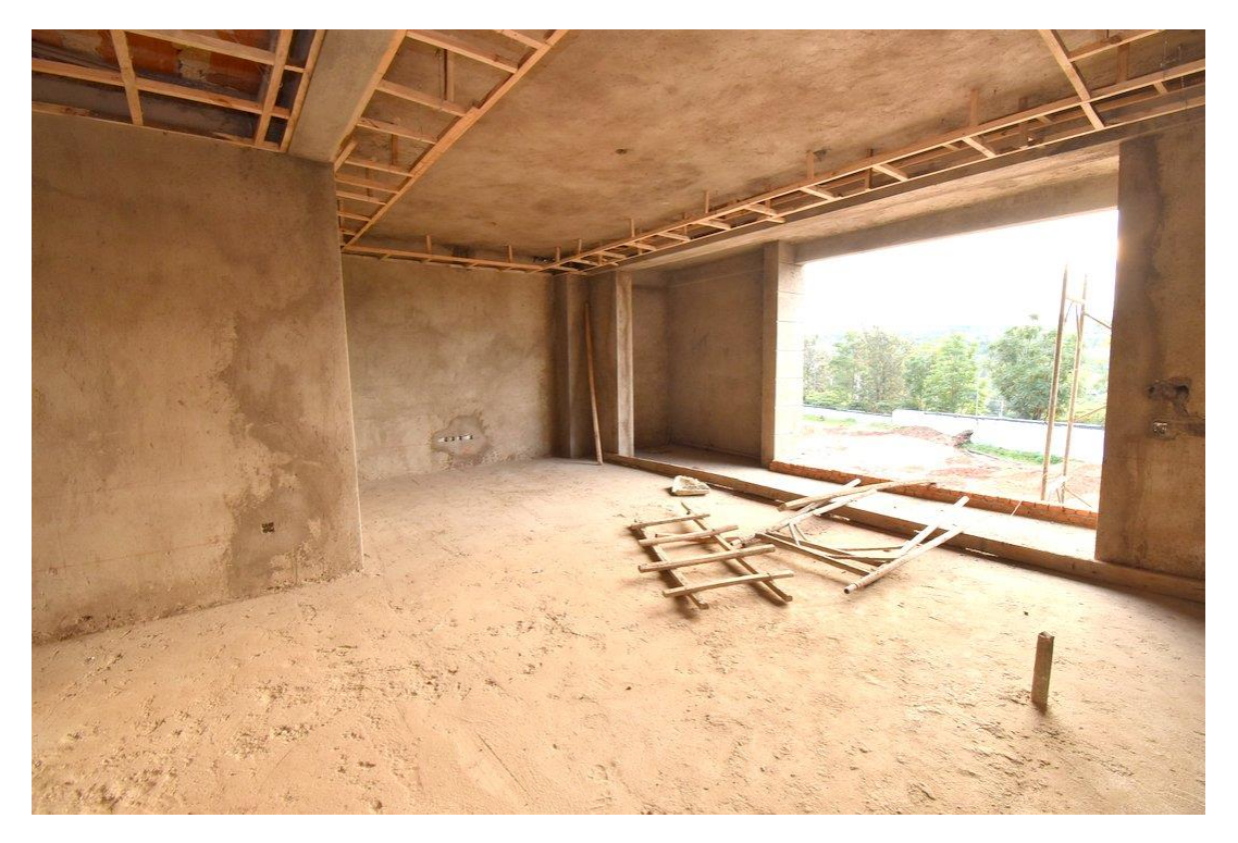
One of the apartements, showing the living area