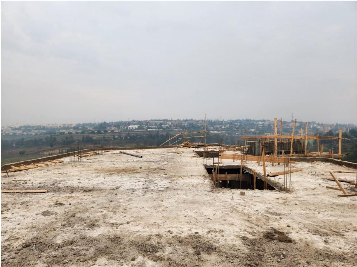
The roof slab, cast