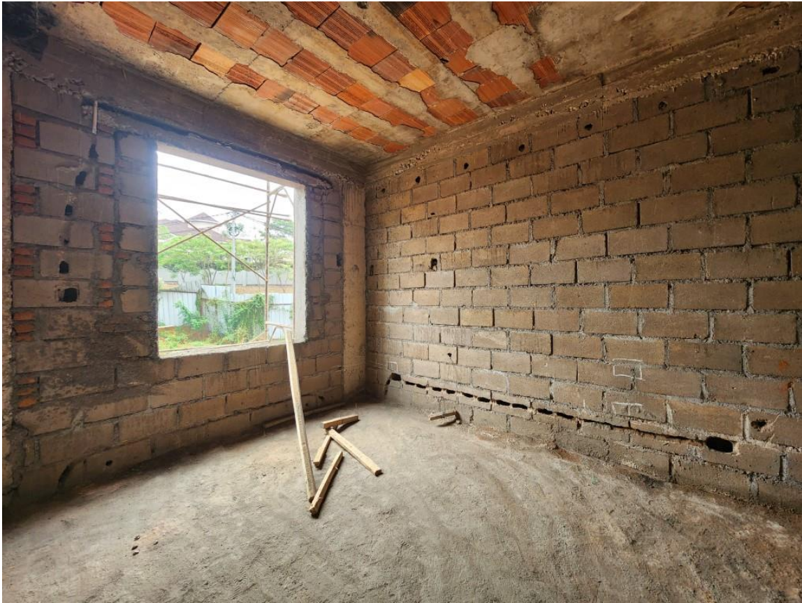
One of the bedrooms