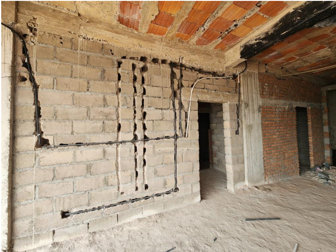
Electrical wiring in one of the living areas