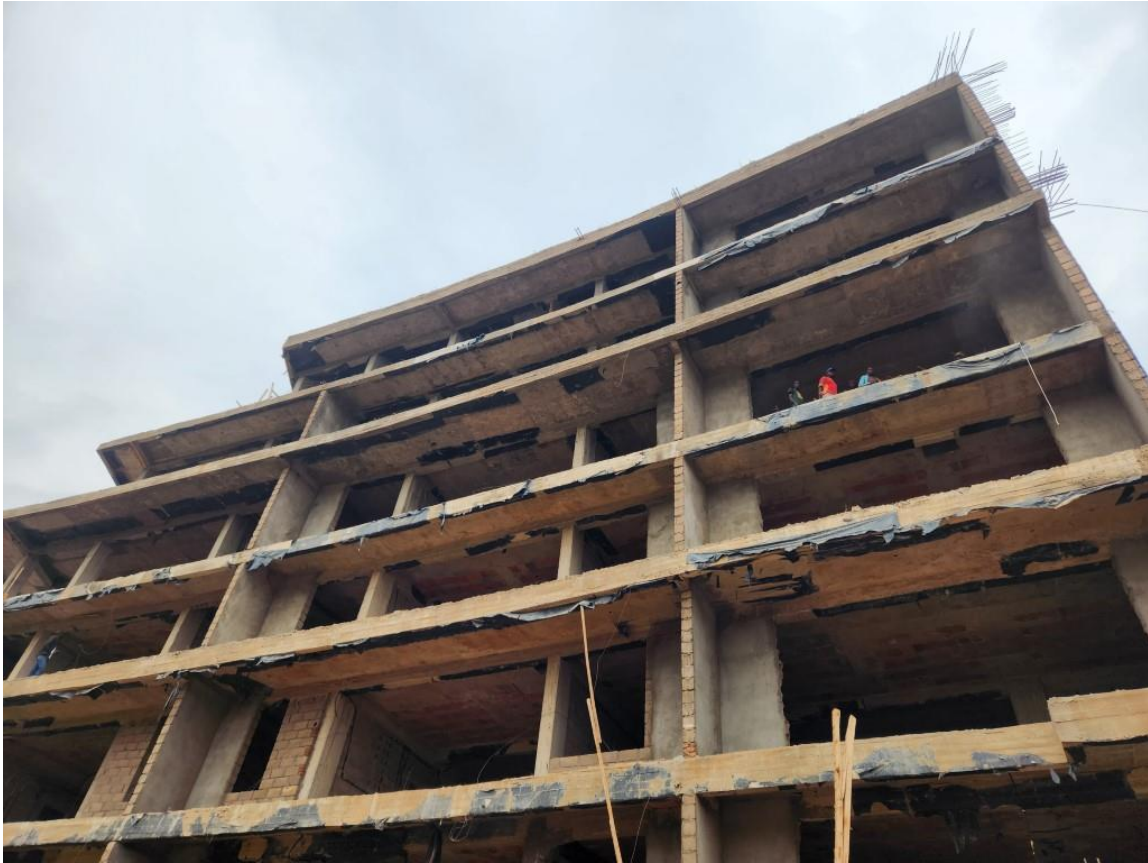
View from the ground floor