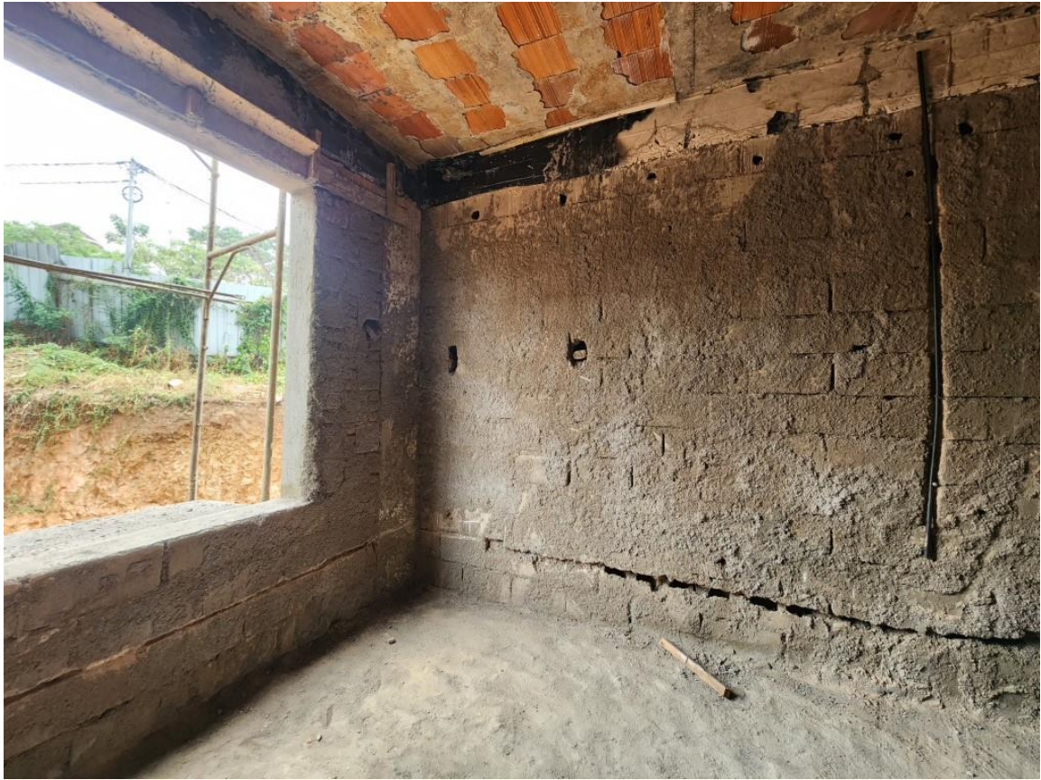
Electrical wiring in one of the bedrooms