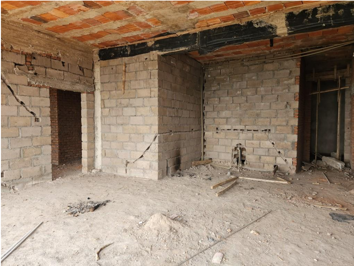
Open plan living, dining and kitchen area, showing the plumbing and electric ducts