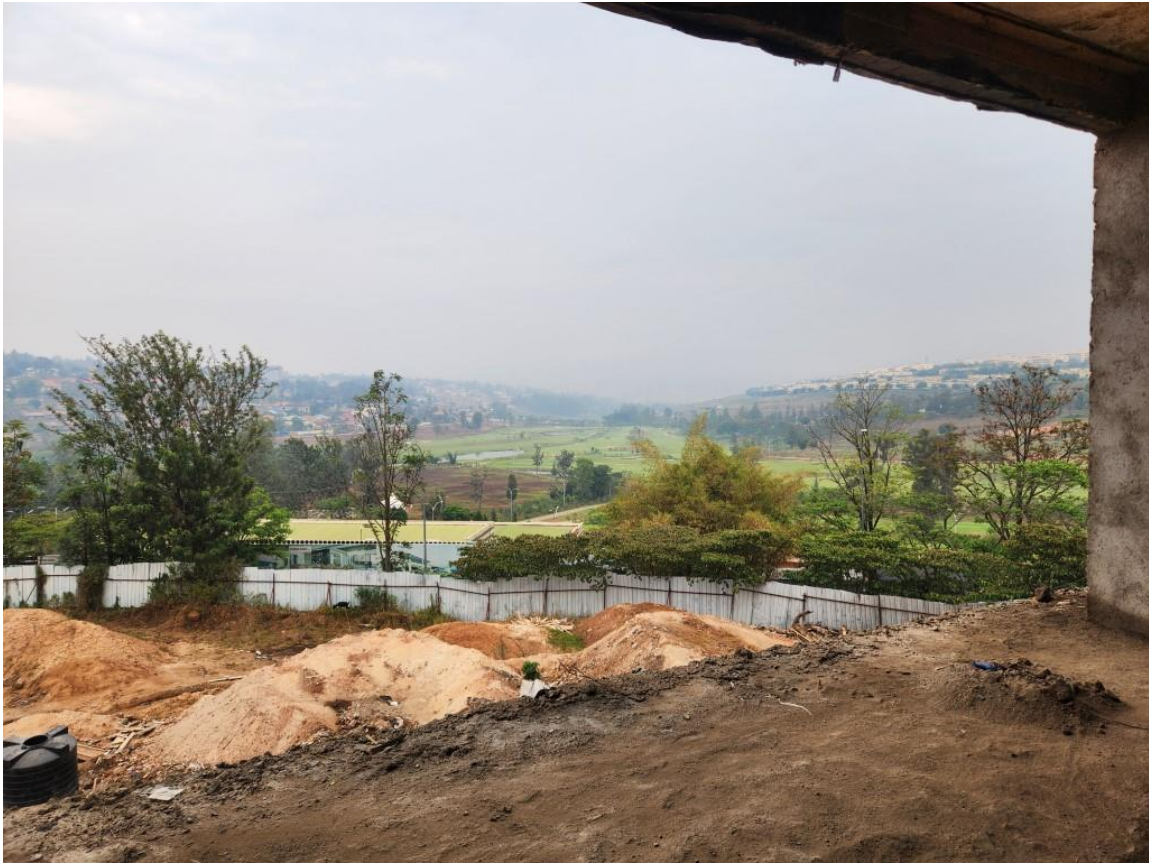
Views from inside one of the apartments on the first floor