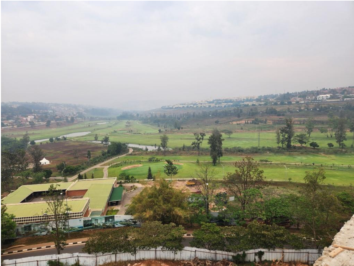
Views from the roof slab