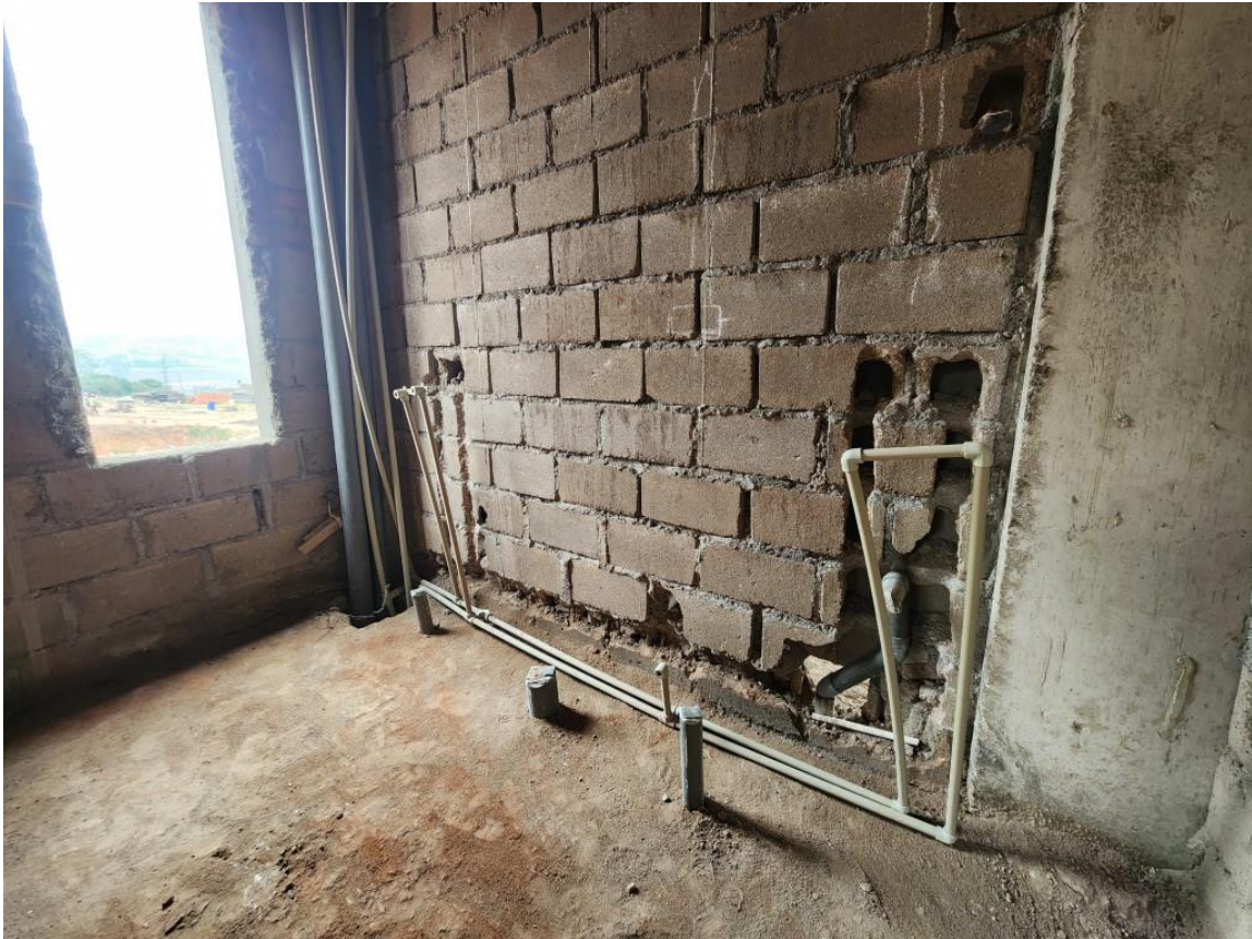
One of the bathrooms, with plumbing works ongoing