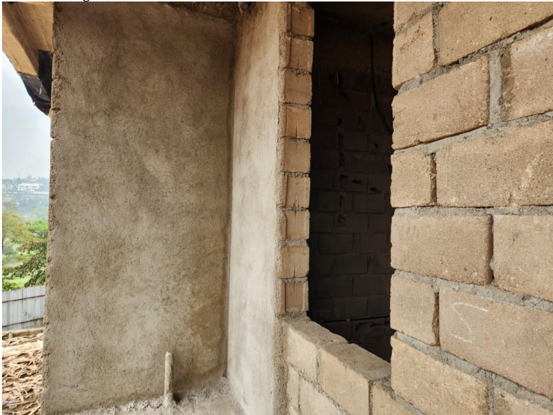
Walls separating the two units, plastering ongoing