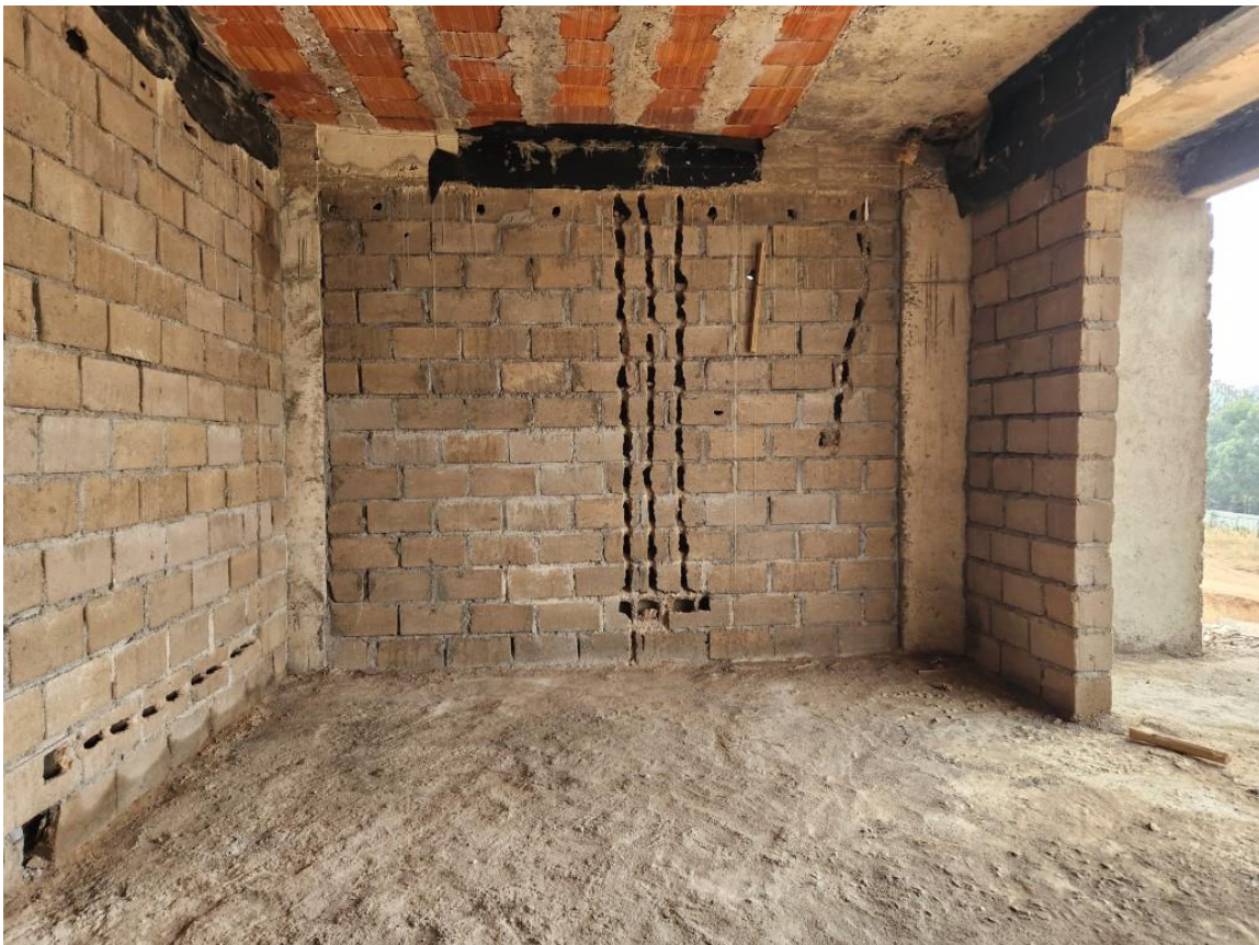
Electrical ducts in one of the apartments living area