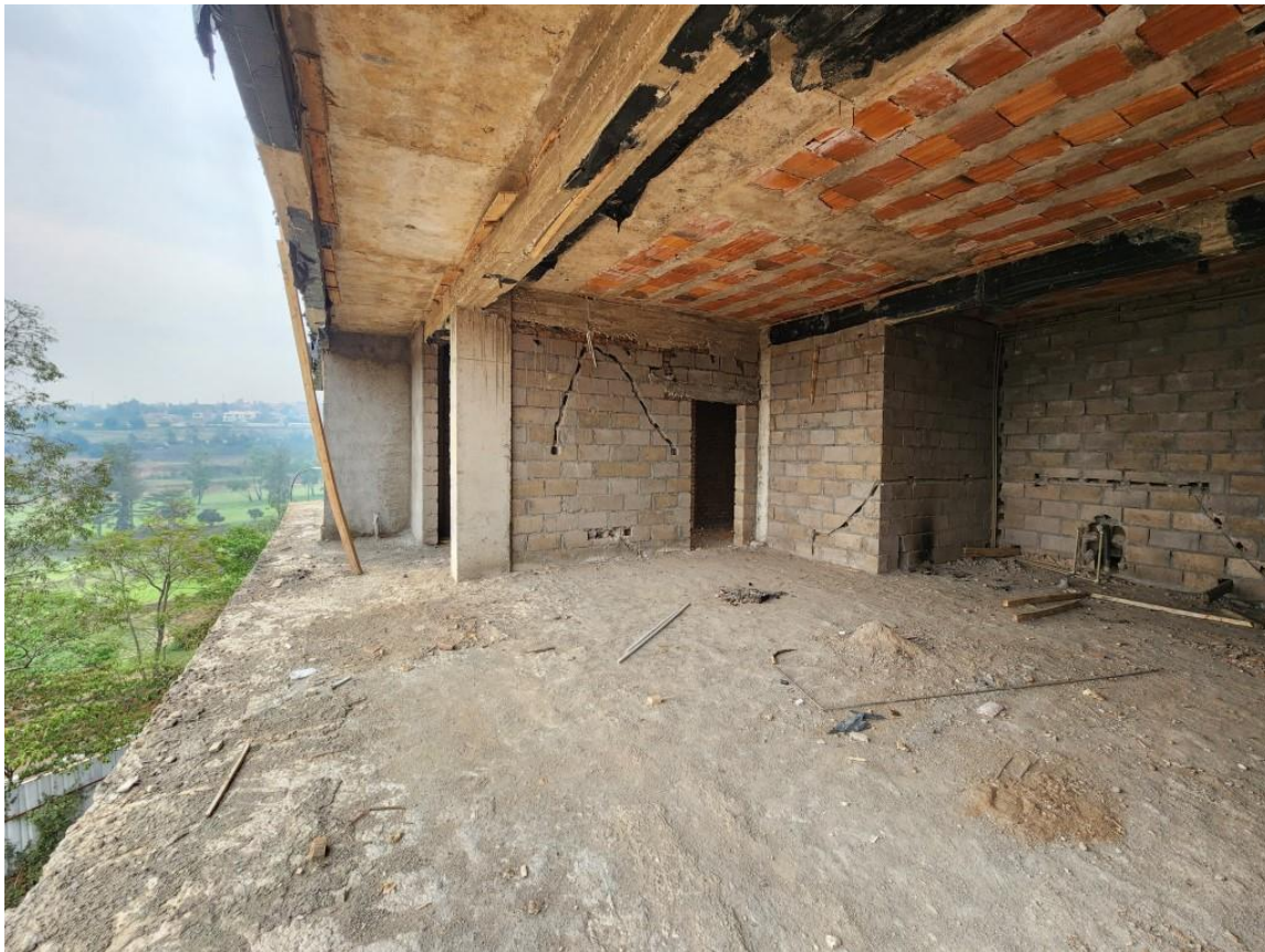
View of one of the apartments on the third floor, from the balcony