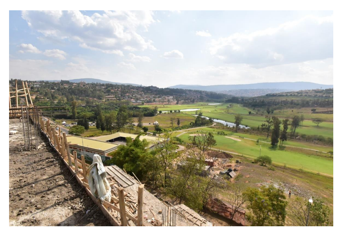
Golf course views from the site