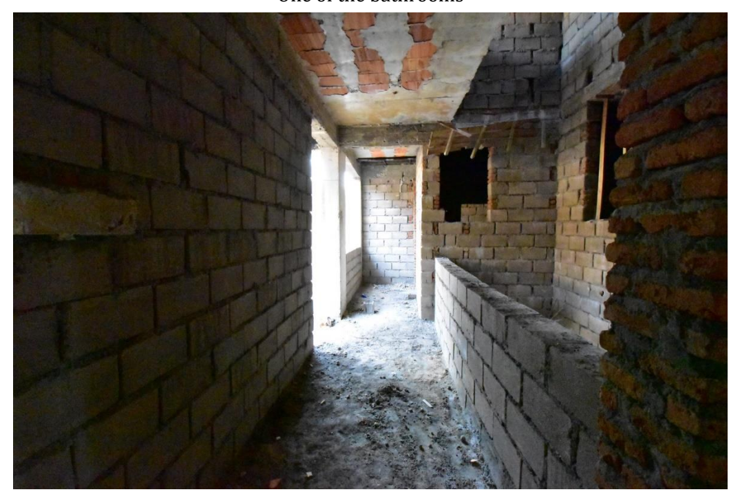
The corridor in the back, showing the way to the apartments