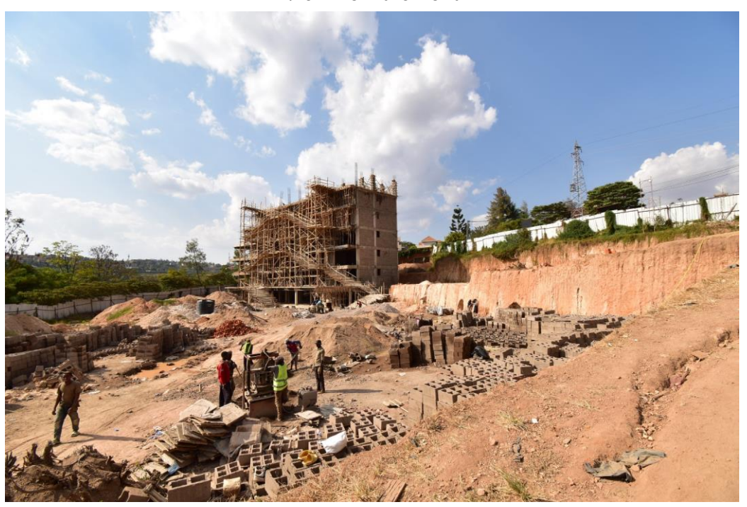
View of phase 1