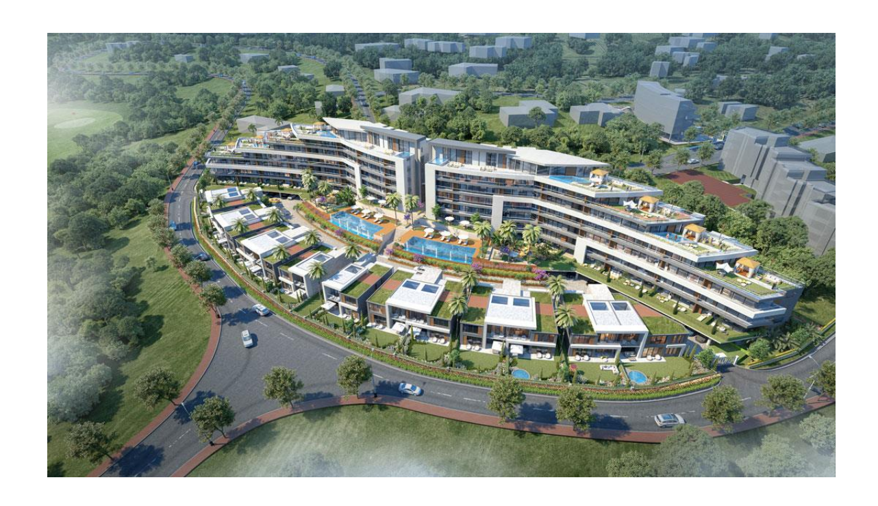
PROGRESS REPORT JUNE AND JULY 2023