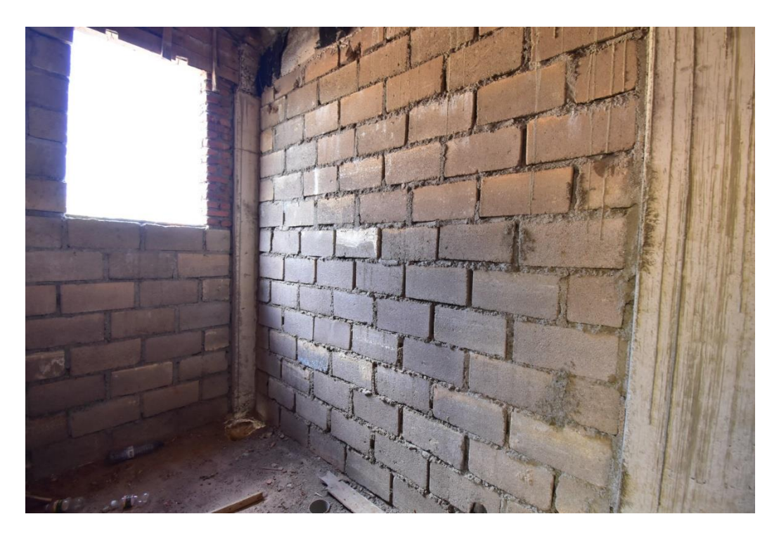
One of the bathrooms