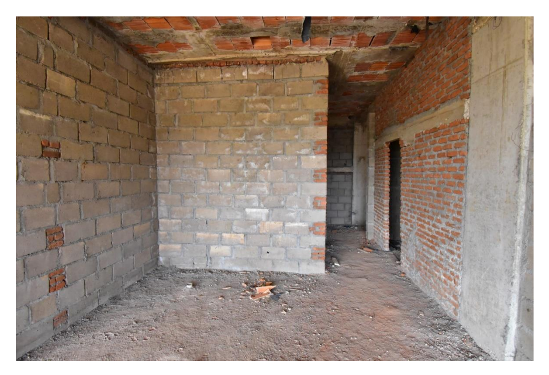
One of the bedrooms