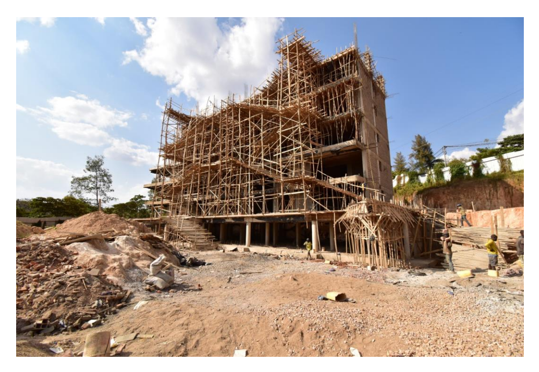
View from the front