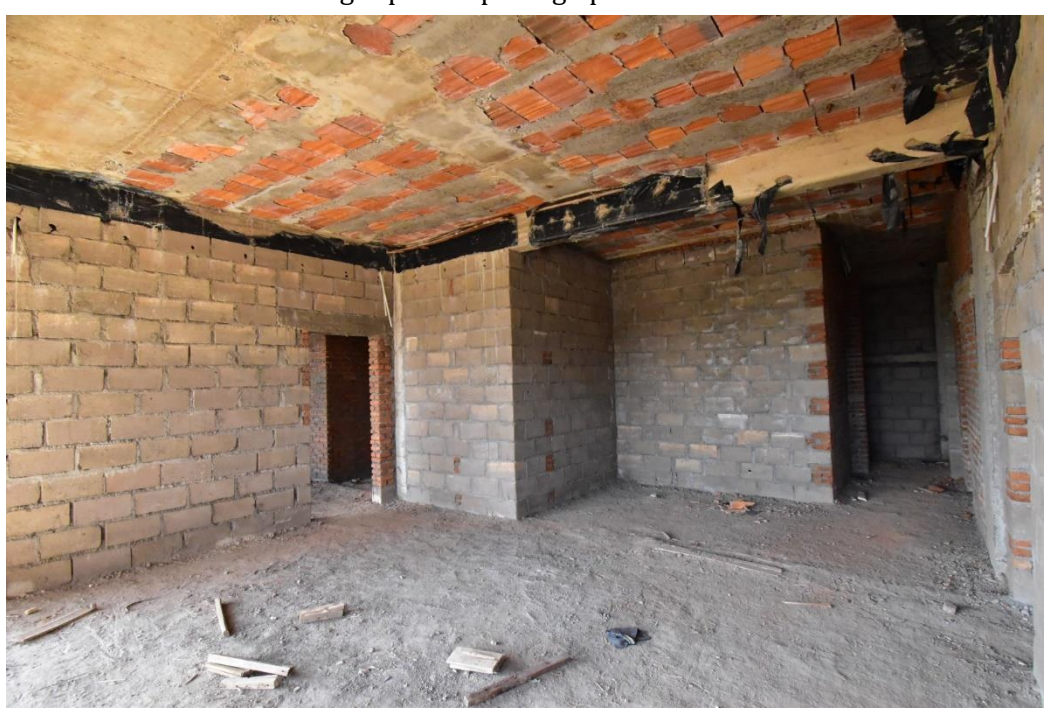
Living area in one of the middle units