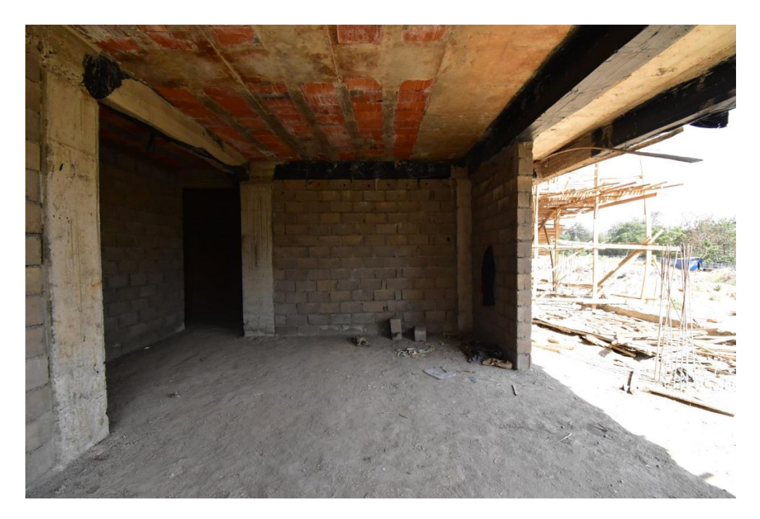
Large spaces opening up to the front