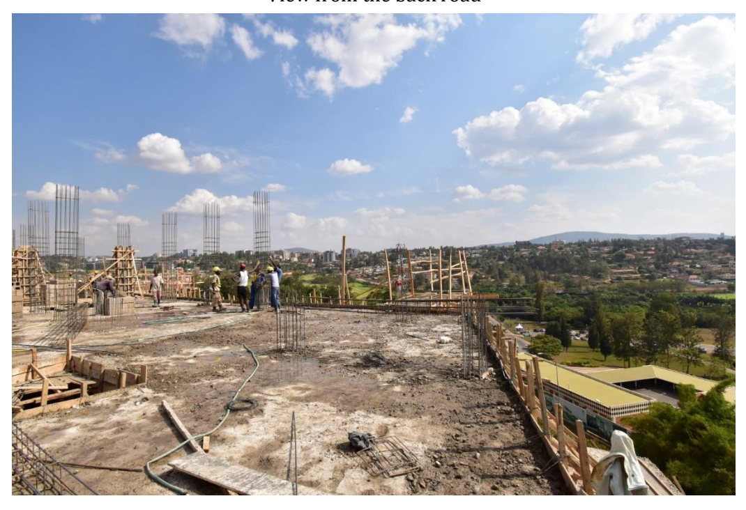
Working with the views