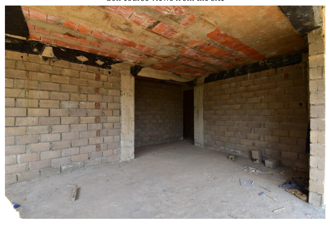
Living area in one of the units